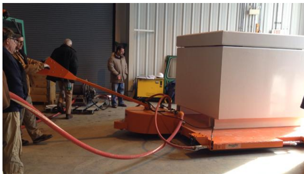
(Aero-Go) Air Pallet for Load-In Facility