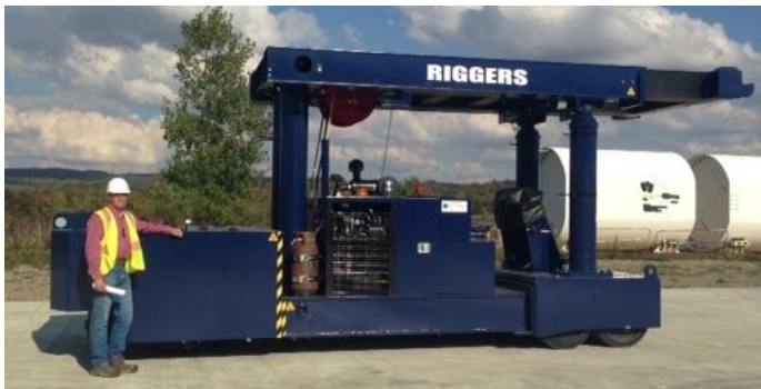
TL220 Delivery Complete