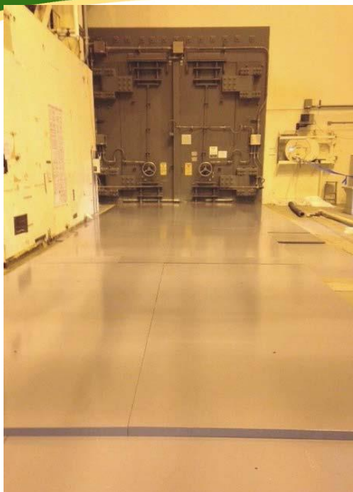
Load-In Facility (LIF) Runway Installed