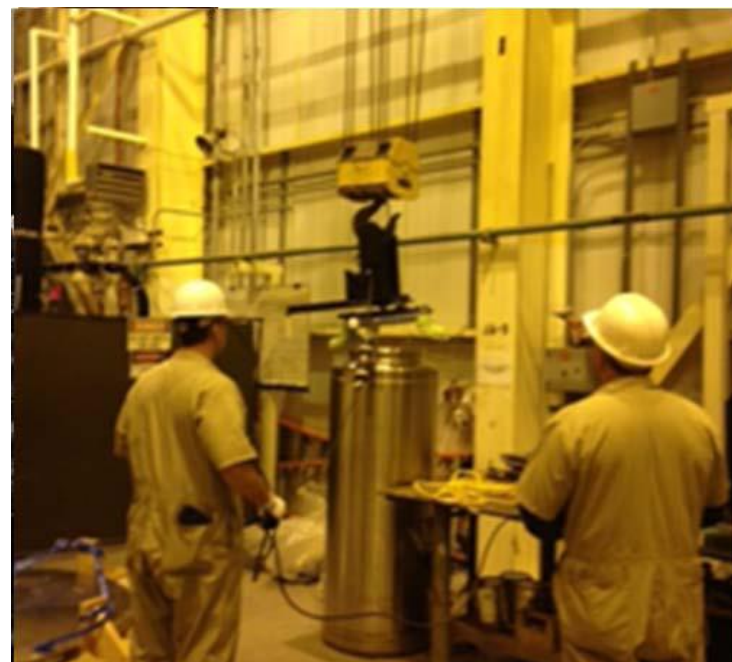
Canister Decon Unit Proficiency Training