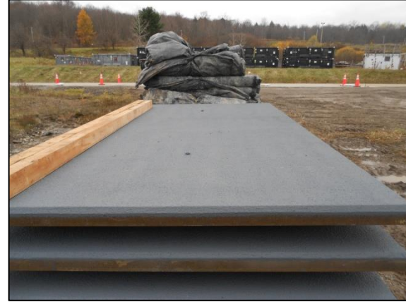
Mitigated overhead and underground utility interferences