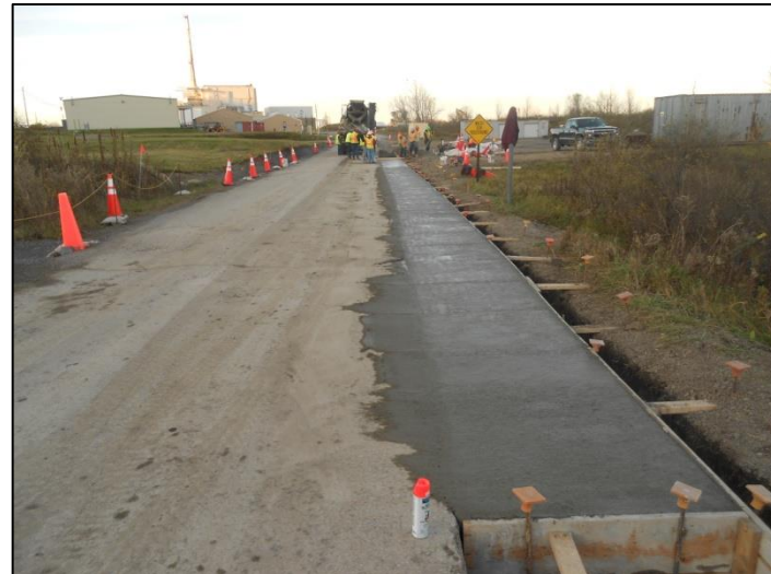
Conducted ~1600 linear feet of road widening