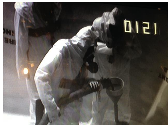
Grouting Subsurface Void Space