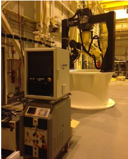
Automated Welding System (AWS) Delivered and Tested