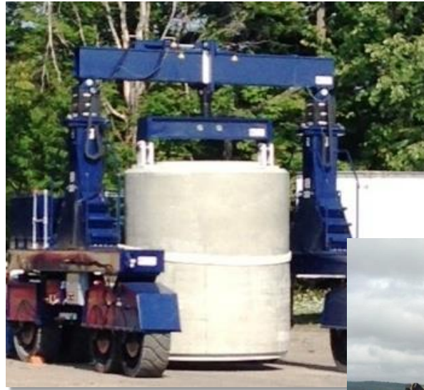
Vertical Cask Transporter (VCT) and Tugger Delivered and Tested