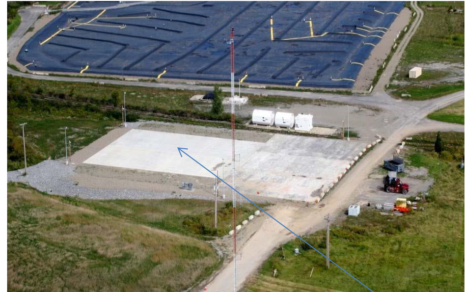
High Level Waste Storage Pad