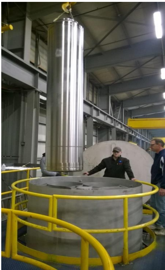
8 Overpacks Fabricated and Fit Tested