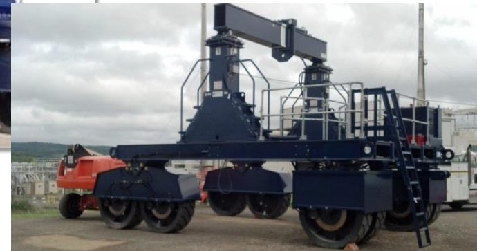
Low Profile Rail Cart 80% Fabrication Complete Load Testing in Mid-February Delivery in March