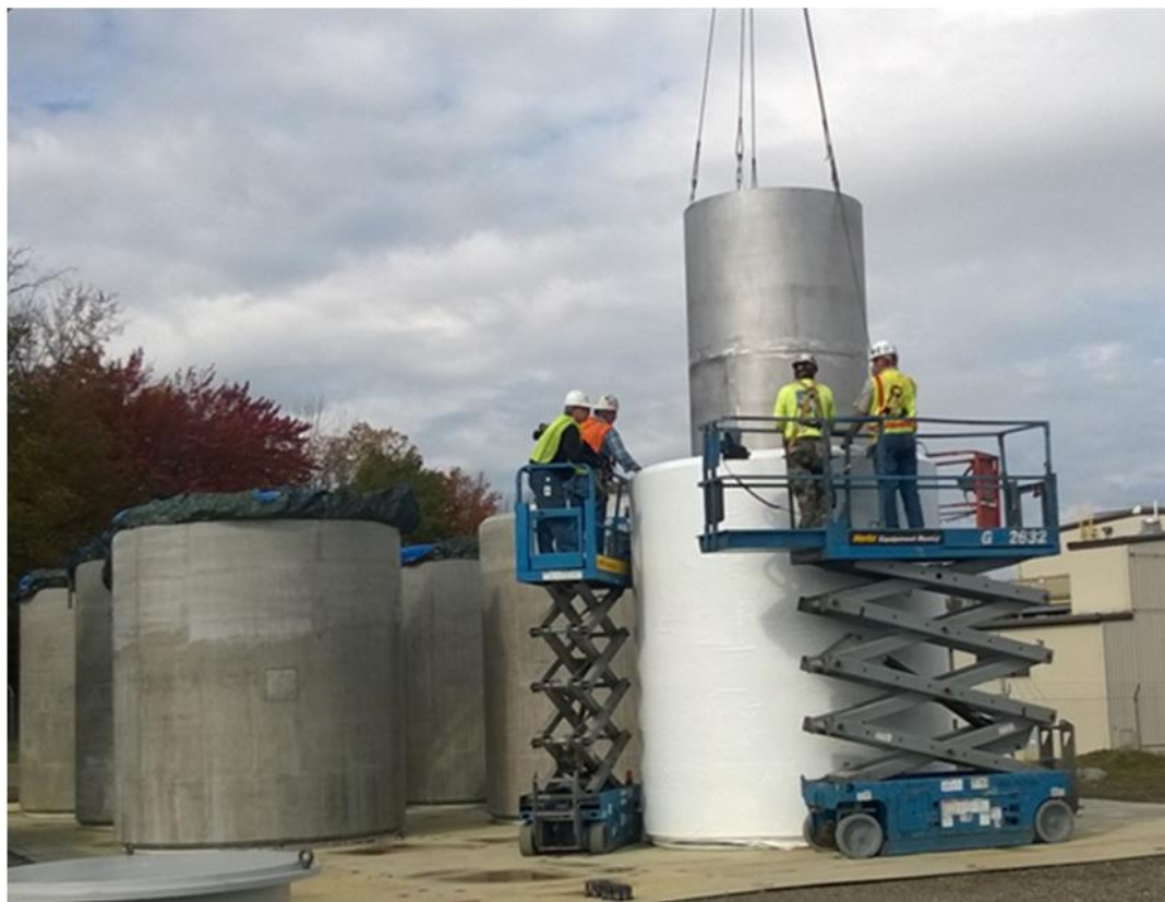
16 Vertical Storage Casks Constructed, 8 Overpacks Loaded in VSCs