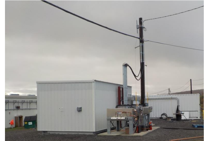
New Data and Communications Center