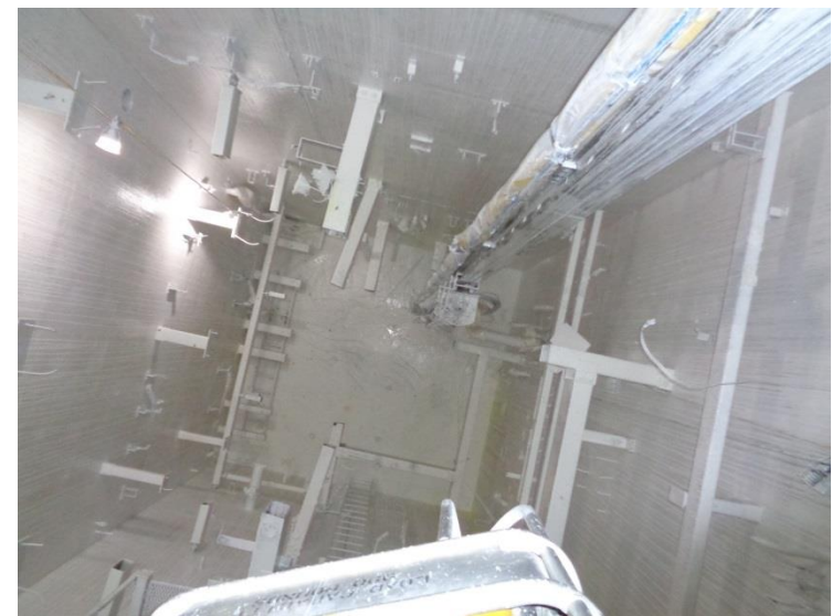
Extraction Cell-1 in 2017