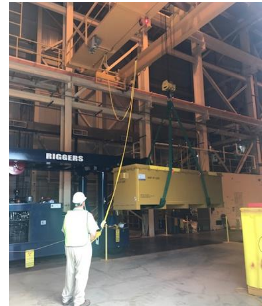
Legacy Waste Container Being Removed from Main Plant