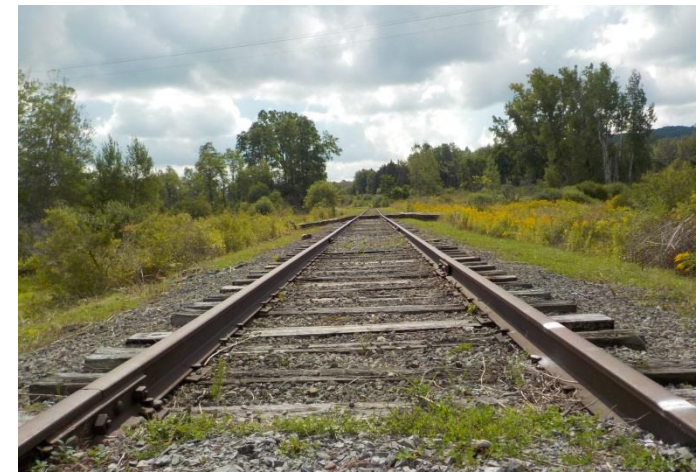
Vegetation Cleared on Rail Spur