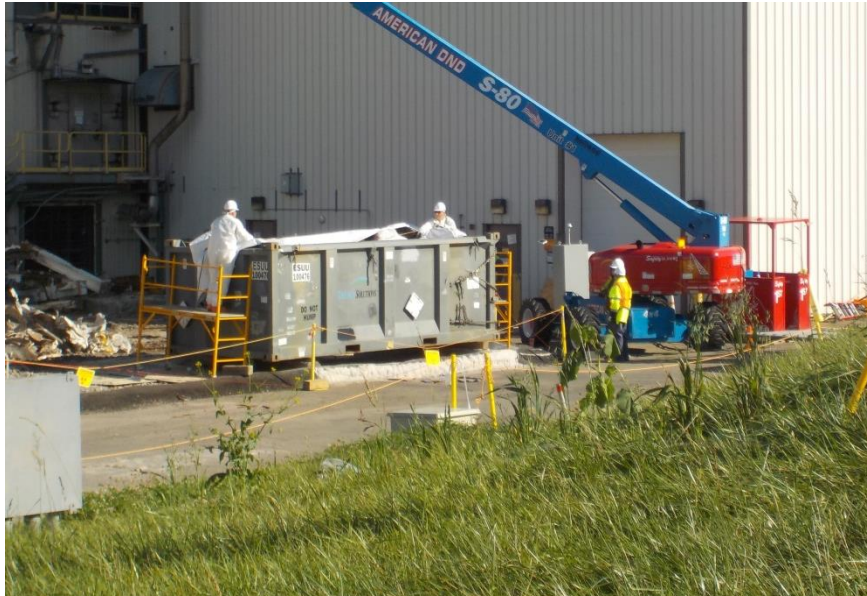
Vitrification Facility Waste Box Closure at the Demolition Site