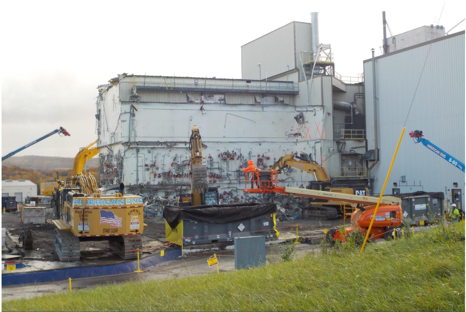
Vitrification Facility West Side – October 24, 2017