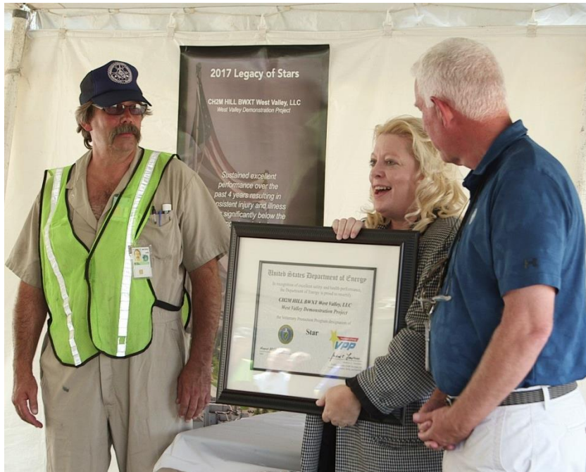
WVDP recertified as a DOE Voluntary Protection Program STAR Site – Sept. 11, 2017