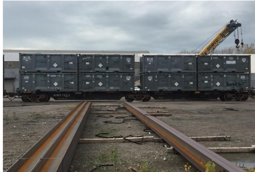
Intermodals Loaded on Rail Cars for Shipment at Blasdell Transloading Facility