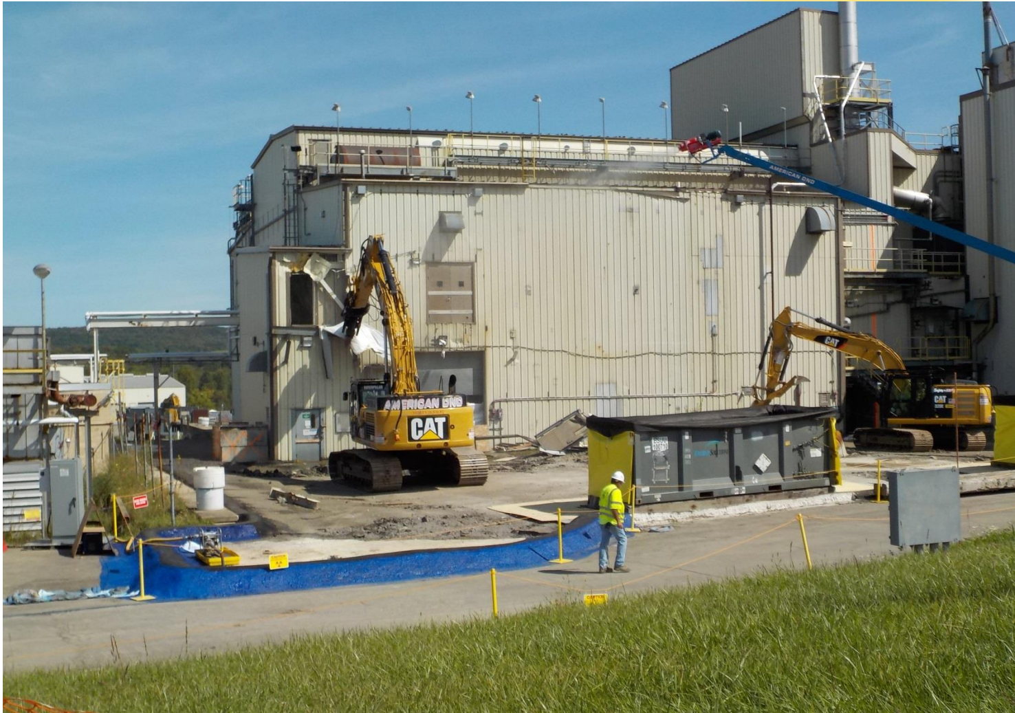
Vitrification Facility Demolition Start – September 11, 2017