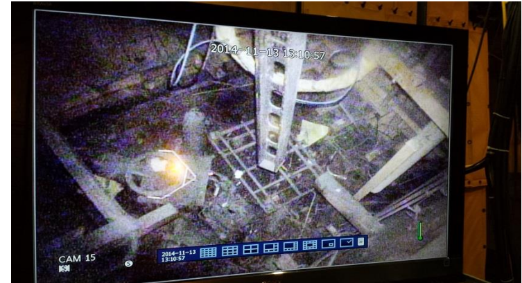
Extraction Cell-1 in 2014