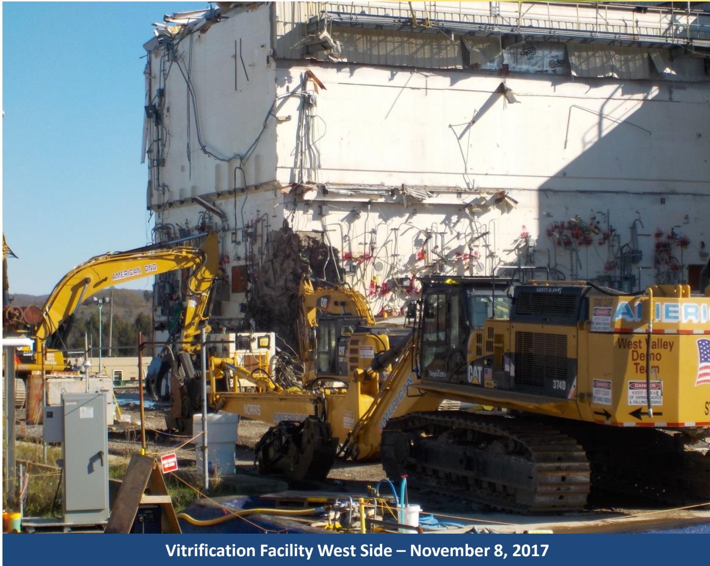
Vitrification Facility West Side – November 8, 2017