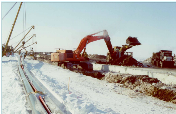
Figure 2. Pipeline construction and installation from ice

The Nikaitchuq pipeline was constructed in 2009 in up to 3m water depth. It is 5.6 km long and consists of a pipeline bundle consists of a 14-inch pipe-in-pipe production flow line in an 18-inch carrier, a 12-inch insulated water injection line, 6-inch spare line and a 2-inch diesel line. Like Oooguruk, there is low risk of ice gouge in the area.