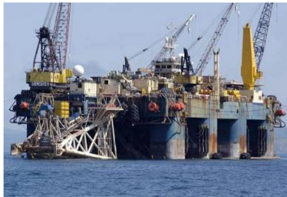
Figure 4. PLV Seamac laying pipe for Sakhalin 2

The pipeline design took into account high strain capacity requirements and extremes of ambient temperatures to avoid the potential for brittle fracture. The installation method used was double joint S-lay combined with stringent AUT inspection of the offshore welds (see Figure 4). A significant part of the offshore pipeline sections is in water depths shallower than 32 meters and therefore complete burial is required to protect them from ice gouge damage. Also seabed morphology and coastal erosion influenced burial depth design. Shore approaches through the surf erosion zone were constructed with extra deep trenches, using major dredging equipment and cofferdams. For routing the pipelines in the non-buried zones, boulder fields and seabed scars were avoided and/or removed as required. These pipeline systems have been in service since 2009 without incident or reported contact with gouging ice. The pipeline systems are equipped with an Atmos leak detection system and an oil spill blockage system.