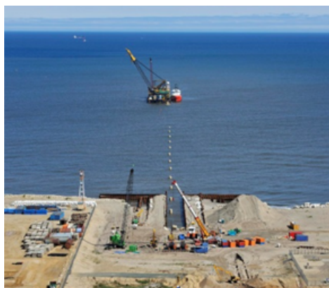
Figure 3. Sakhalin 1 Arkutun Dagi pipeline shore approach