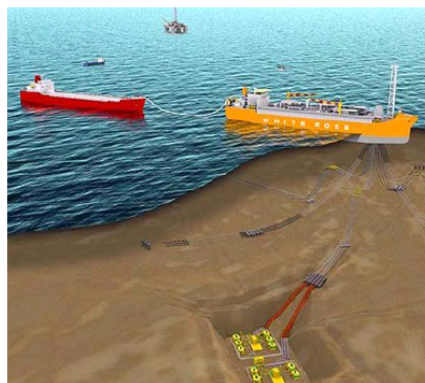
Figure 5. Excavated drill center for FPSO operation

There are currently two operating floating production, storage, and offloading vessels on the Grand Banks offshore Newfoundland. Terranova was installed in 2001 and White Rose in 2005. The subsea well templates for these FPSO developments are located within excavated pits in the seafloor, commonly known as excavated drill centers (Figure 5). The excavated drill centers were dredged with cutter suction dredging equipment in about 100 meters water depth to produce large pits that would allow the wellheads to remain below the level of the seafloor to protect from seafloor-gouging icebergs. Subsea flowlines for these fields are sacrificial – not buried, but instead designed to be flushed and isolated in the rare event that an iceberg threatens contact with them. The seafloor in the Grand Banks area contains hardpan and boulders, rendering it very challenging to bury pipelines. To the author's knowledge, these are the only functioning subsea facilities exposed to potential ice (albeit iceberg) contact.