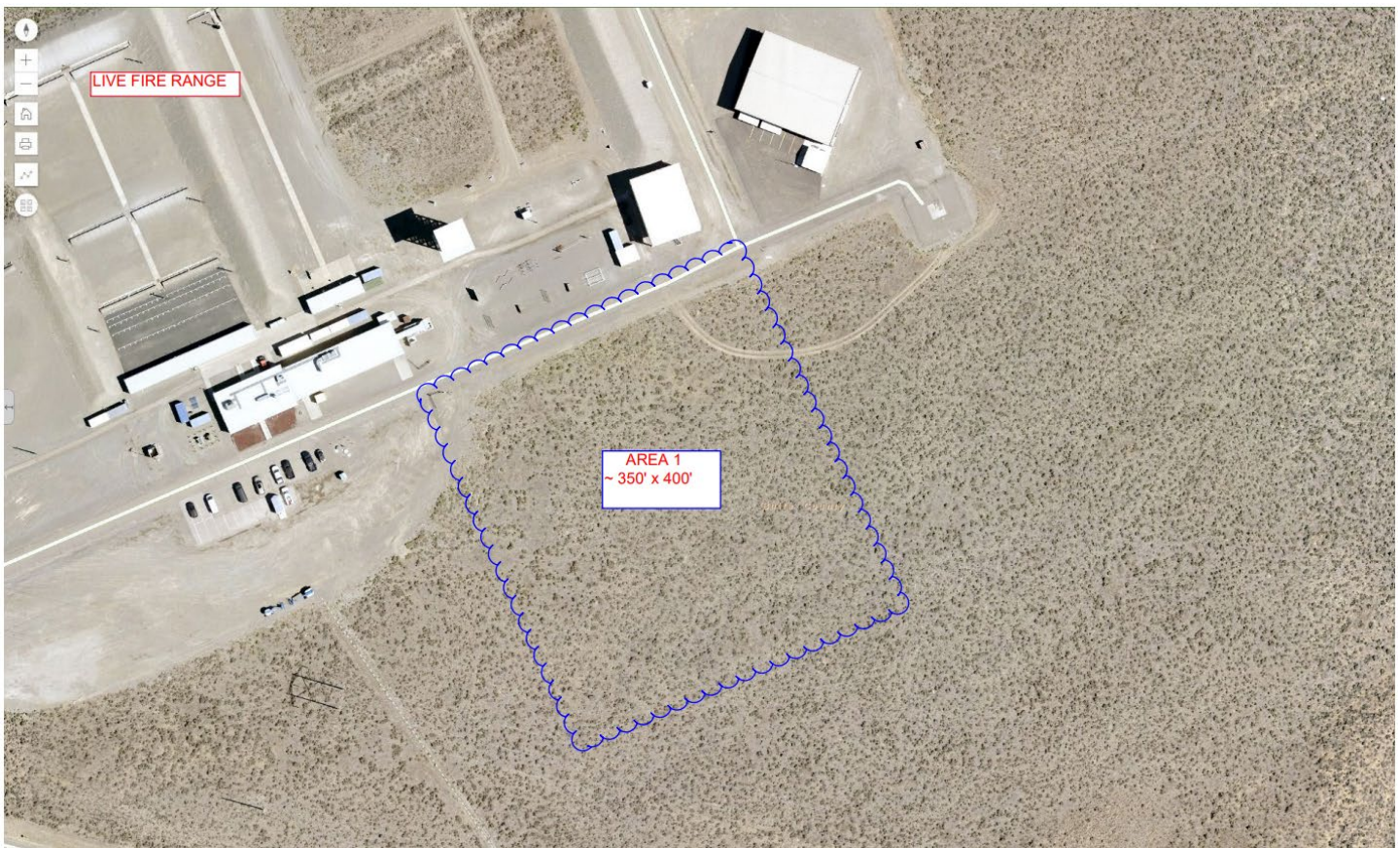
Figure 1. Site Survey Area/Approximate Building Location.

The building will be constructed to INL standards for the applicable use-type. The building will have HVAC, a compressed air system, fire protection, fire alarm, applicable electrical needs, security, and telecommunication capabilities. Required for construction will be the need to excavate for foundations and footings as well as the use of pit run from the Monroe Pit to support concrete and asphalt placement.