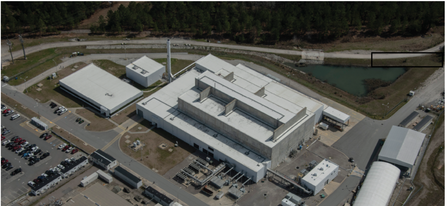
An aerial view of the Salt Waste Processing Facility at the Savannah River Site.

Since 1996, SRS has been removing the sludge waste from tanks, pre-treating and delivering it to the Defense Waste Processing Facility (DWPF) for final treatment. The DWPF was built to vitrify concentrated high-activity tank waste into a stable form and store it for eventual permanent disposal. The Saltstone Production Facility (SPF) was constructed to immobilize and dispose of low activity decontaminated salt waste. To effectively utilize these existing facilities for liquid radioactive waste disposition, a processing capability was needed for separating and concentrating the high-activity constituents from the salt waste solutions resulting from tank closure operations. Construction of the SWPF was completed in June 2016.