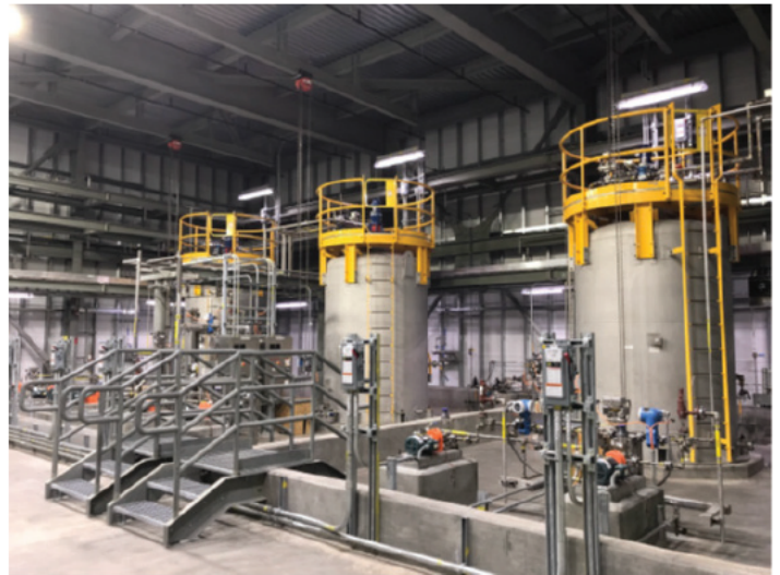
Next Generation Solvent in SWPF. The SWPF is expected to process up to 9 million gallons of waste per year by FY 2024 following the implementation of the Next-Generation Solvent.

The first batch of radioactive waste, approximately 4,000 gallons, was transferred to SWPF on Oct. 5, 2020 beginning “hot” commissioning of the facility. SWPF successfully completed the hot commissioning testing phase of operations in January 2021, having validated radiation shielding, environmental emissions, and product waste acceptance requirements while processing over 320,000 gallons of radioactive liquid waste. SWPF then entered full operations and processed just over 2,000,000 gallons of salt