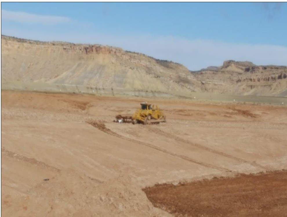
Photo 28. RRM Placement September 12, 2017