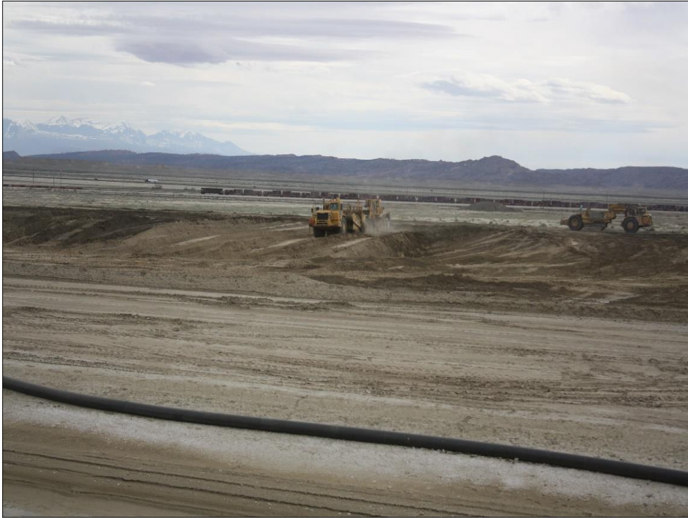
Photo 3. Phase 3b Cell Excavation March 22, 2017