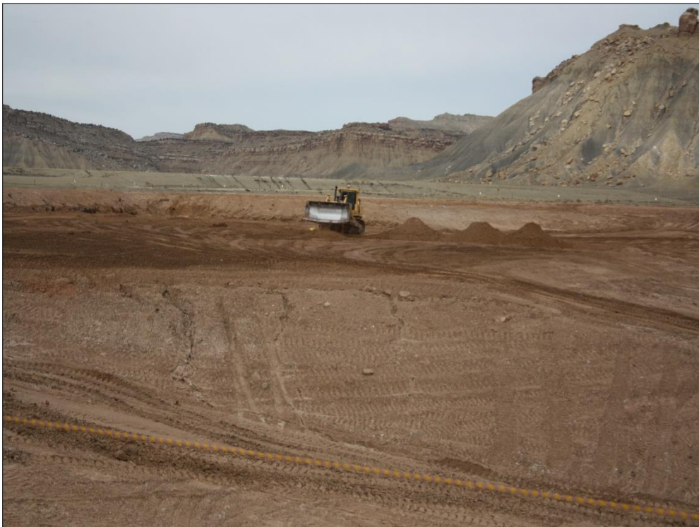
Photo 16. RRM Placement March 21, 2017