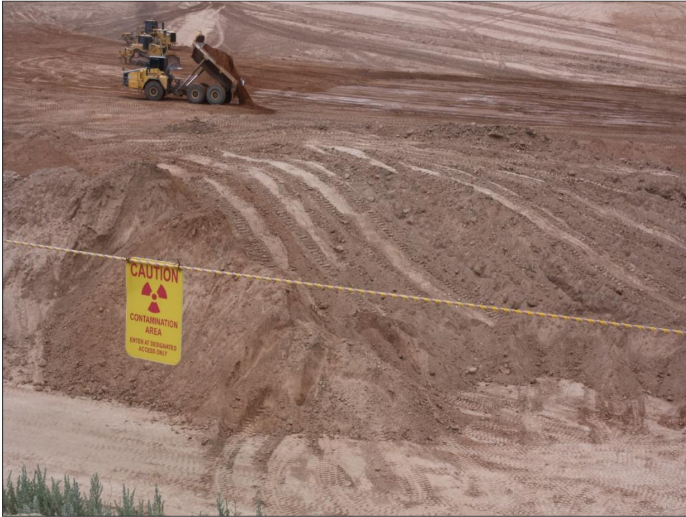
Photo 23. RRM Placement August 1, 2017