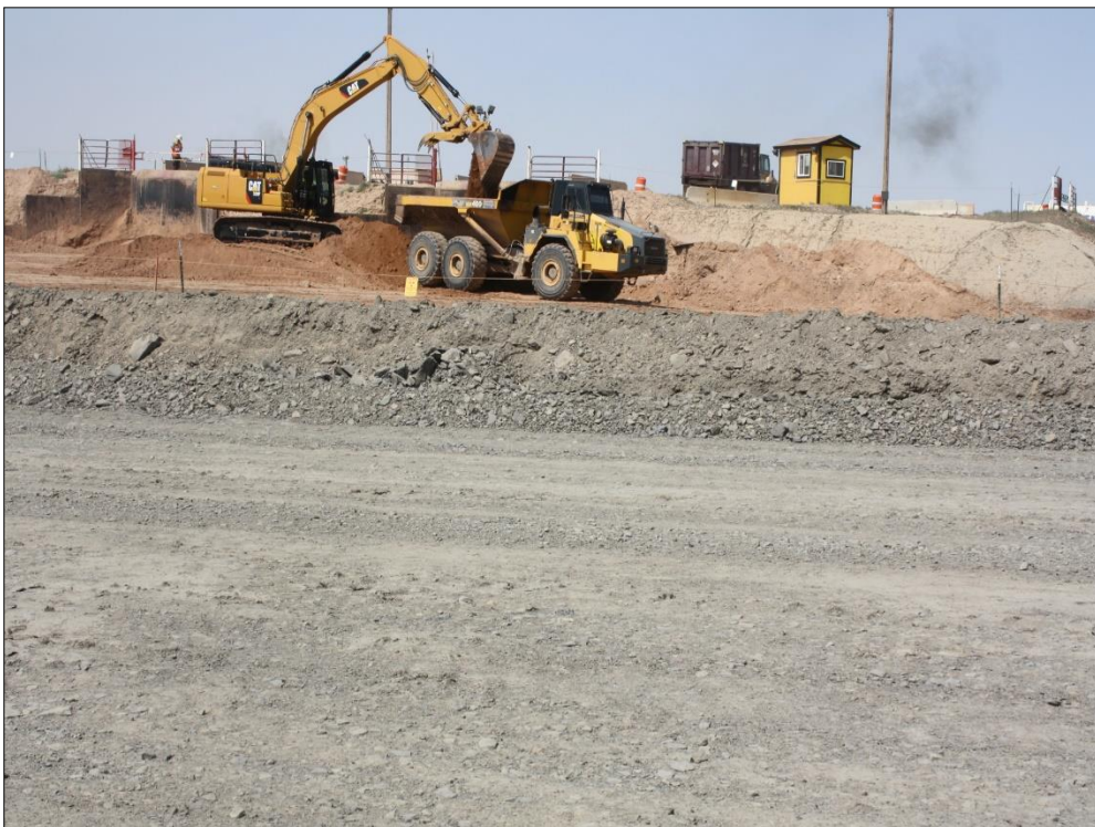
Photo 20. RRM Loadout June 27, 2017