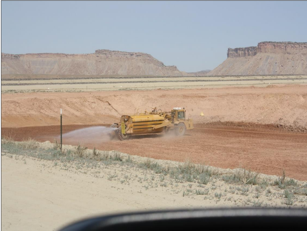
Photo 21. RRM Moisture Conditioning June 27, 2017