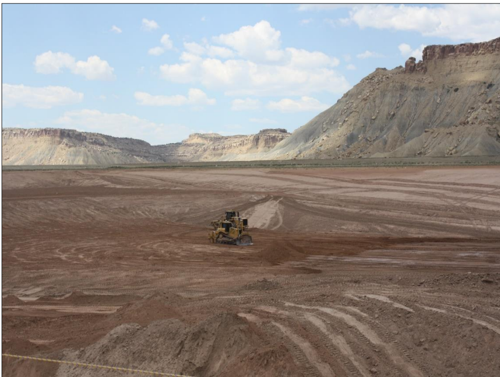
Photo 22. RRM Placement July 27, 2017