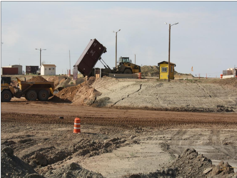
Photo 24. Container Dumping August 29, 2017