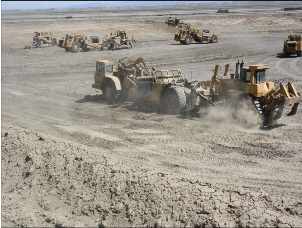
Photo 5. Phase 3b Cell Excavation April 20, 2017