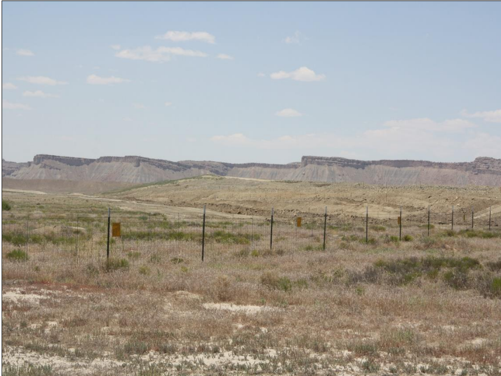
Photo 31. Spoils Embankment May 25, 2017