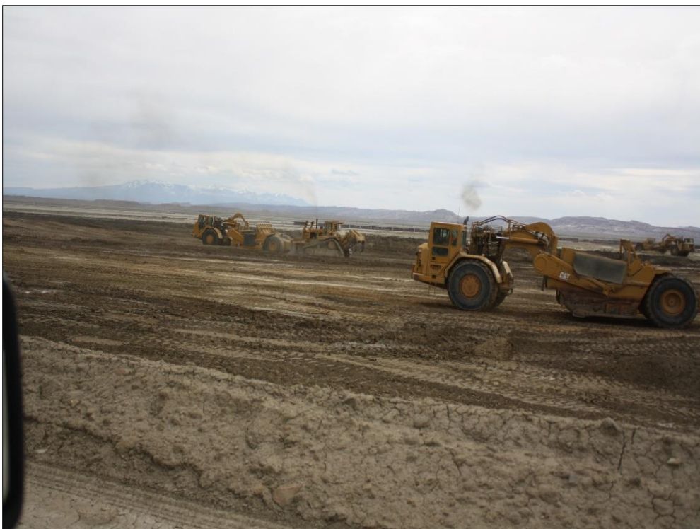
Photo 2. Phase 3b Cell Excavation March 21, 2017