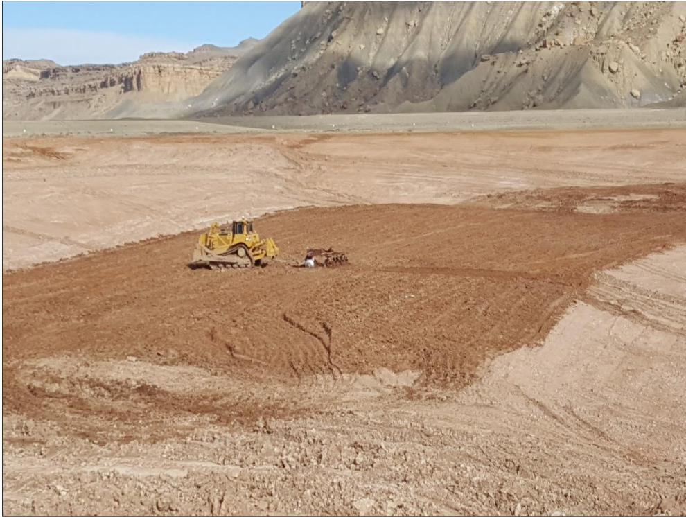
Photo 19. RRM Placement June 1, 2017