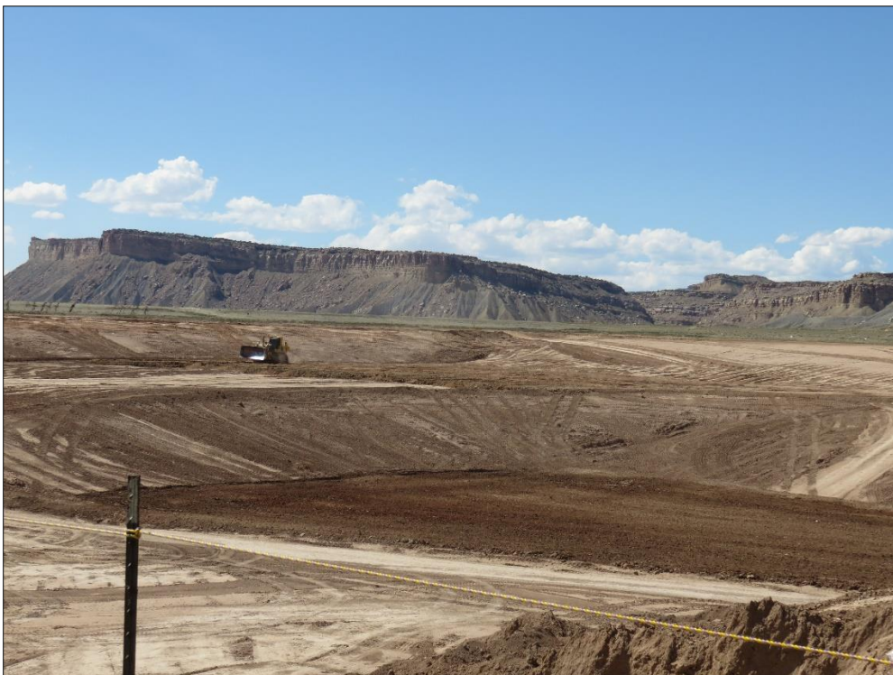
Photo 18. RRM Placement May 24, 2017