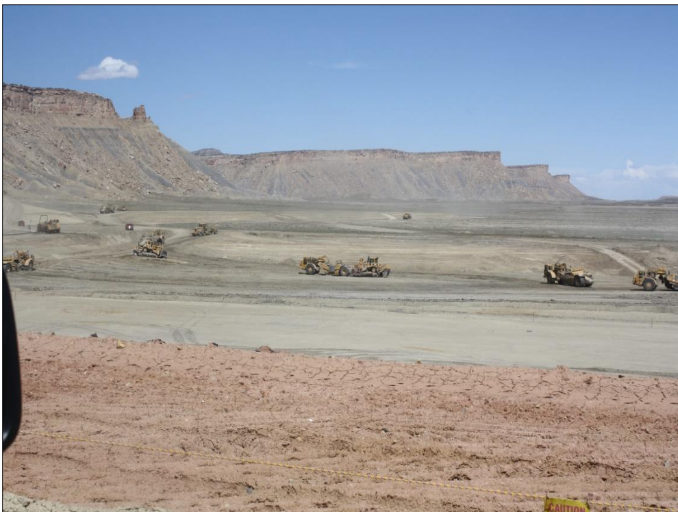
Photo 6. Phase 3b Cell Excavation April 20, 2017