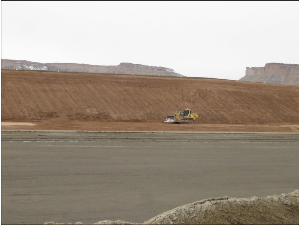
Photo 13. RRM Placement February 7, 2017