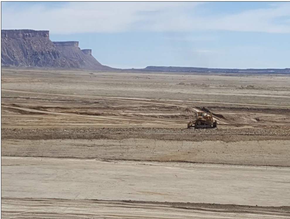
Photo 4. Phase 3b Cell Excavation April 7, 2017