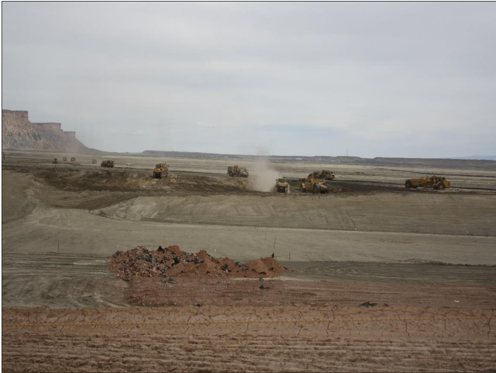
Photo 1. Phase 3b Cell Excavation March 21, 2017