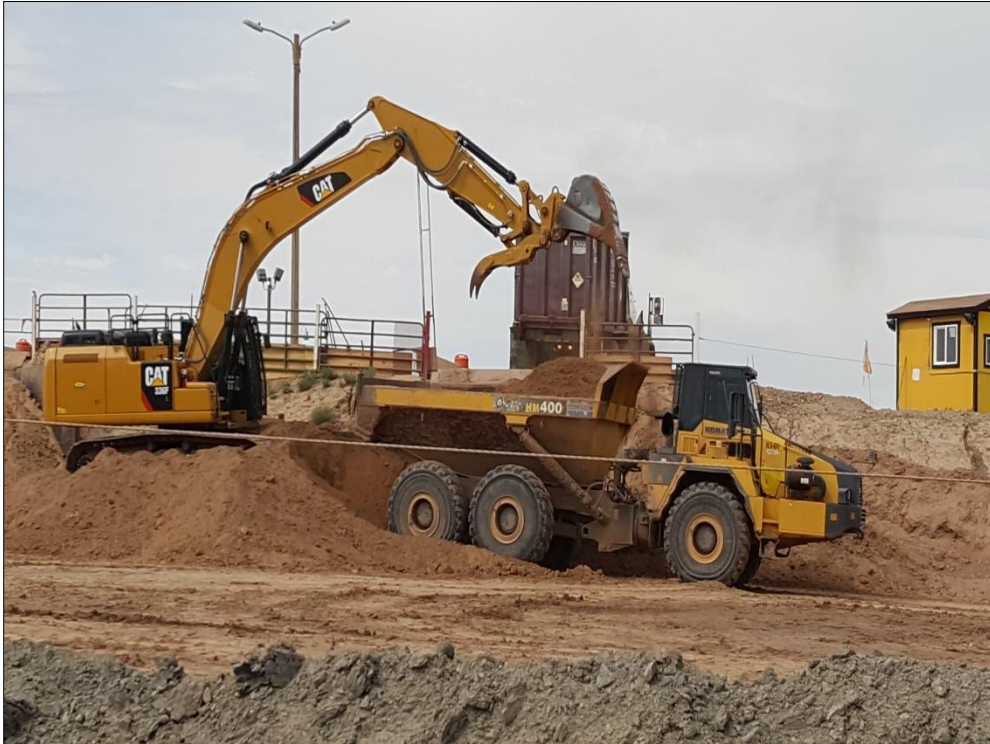
Photo 27. RRM Loadout September 5, 2017