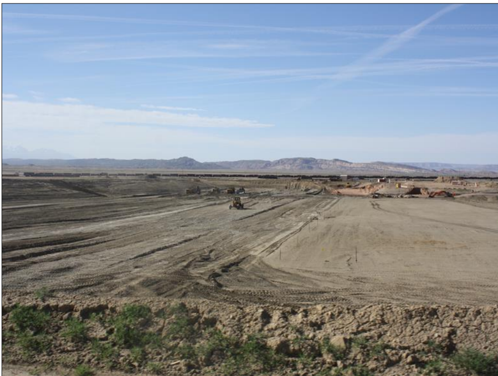
Photo 8. Phase 3b Cell Excavation May 15, 2017