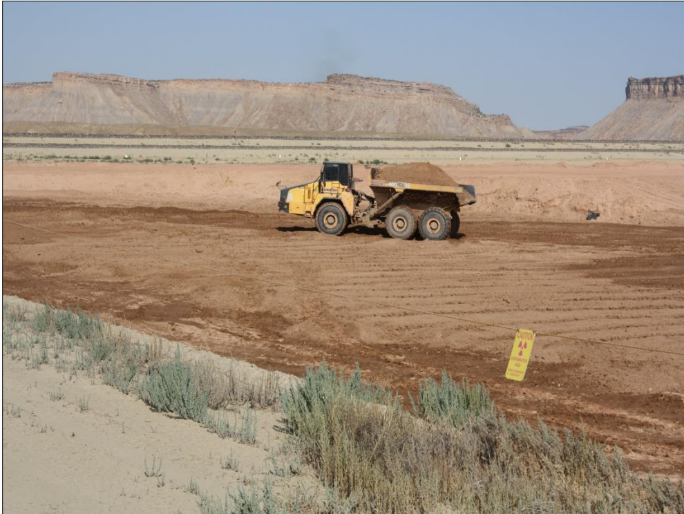
Photo 25. RRM Placement August 29, 2017