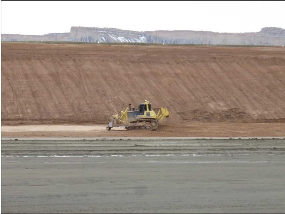
Photo 15. RRM Placement February 9, 2017