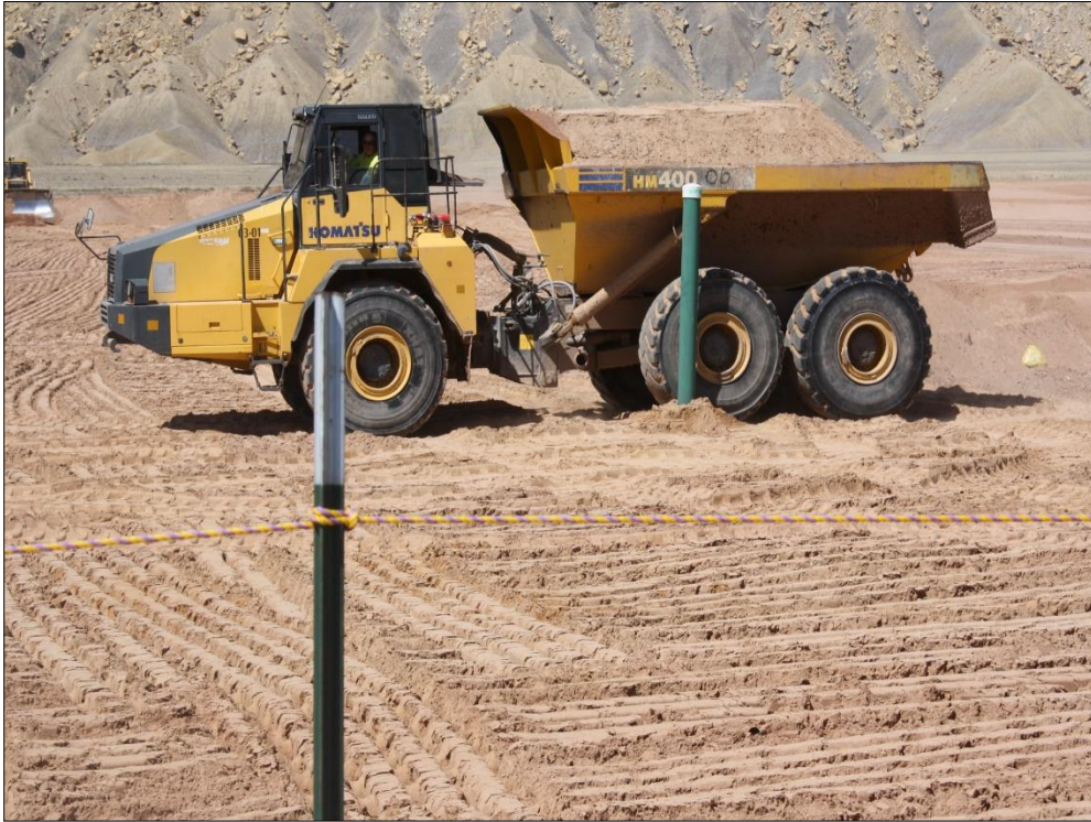
Photo 17. Compaction of RRM Placement near Standpipe 01, April 20, 2017