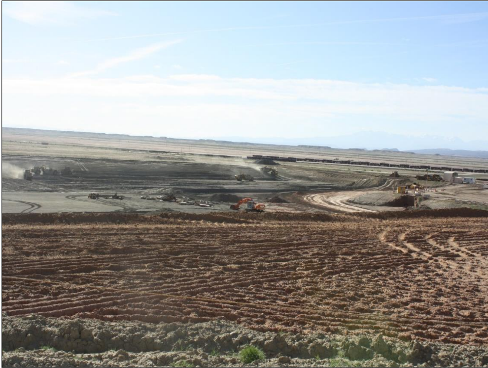
Photo 7. Phase 3b Cell Excavation May 15, 2017