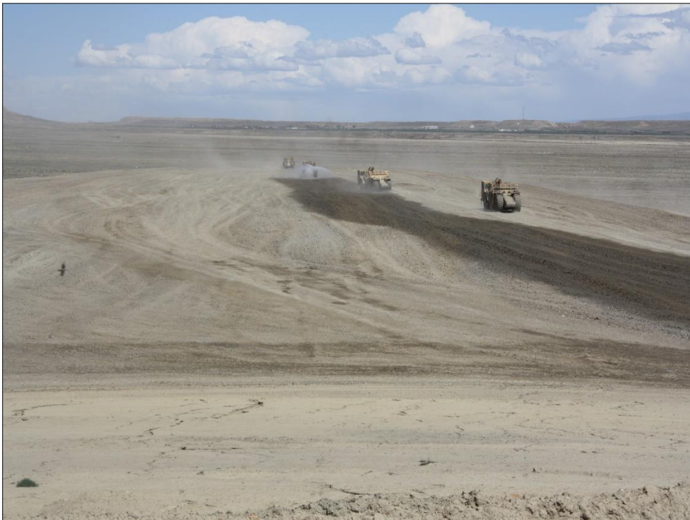
Photo 30. Spoils Embankment Placement April 20, 2017