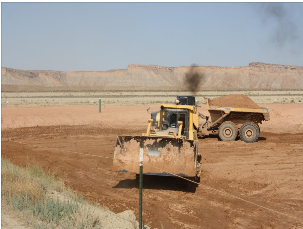
Photo 26. RRM Placement August 29, 2017