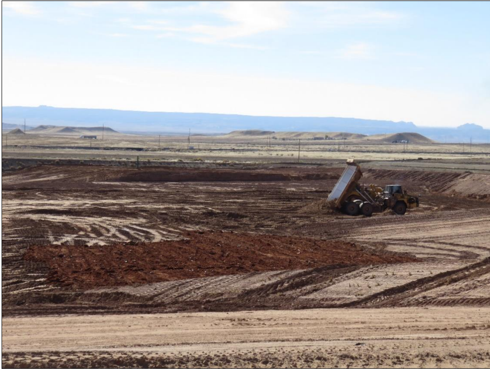
Photo 9. RRM Placement October 11, 2016