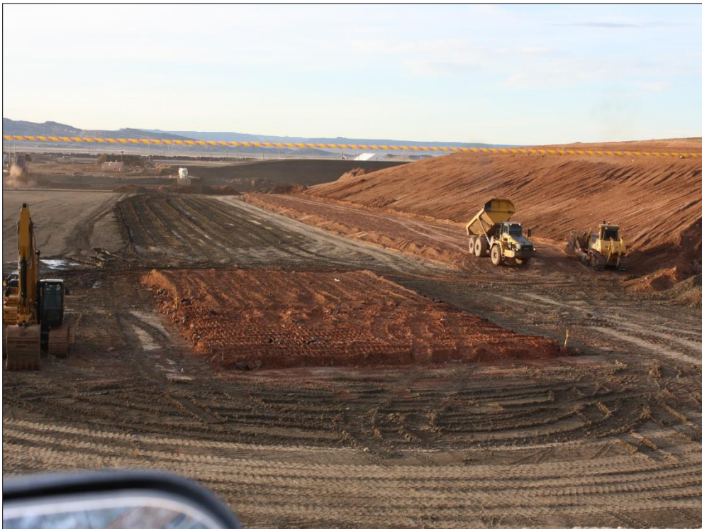
Photo 14. RRM Placement February 9, 2017