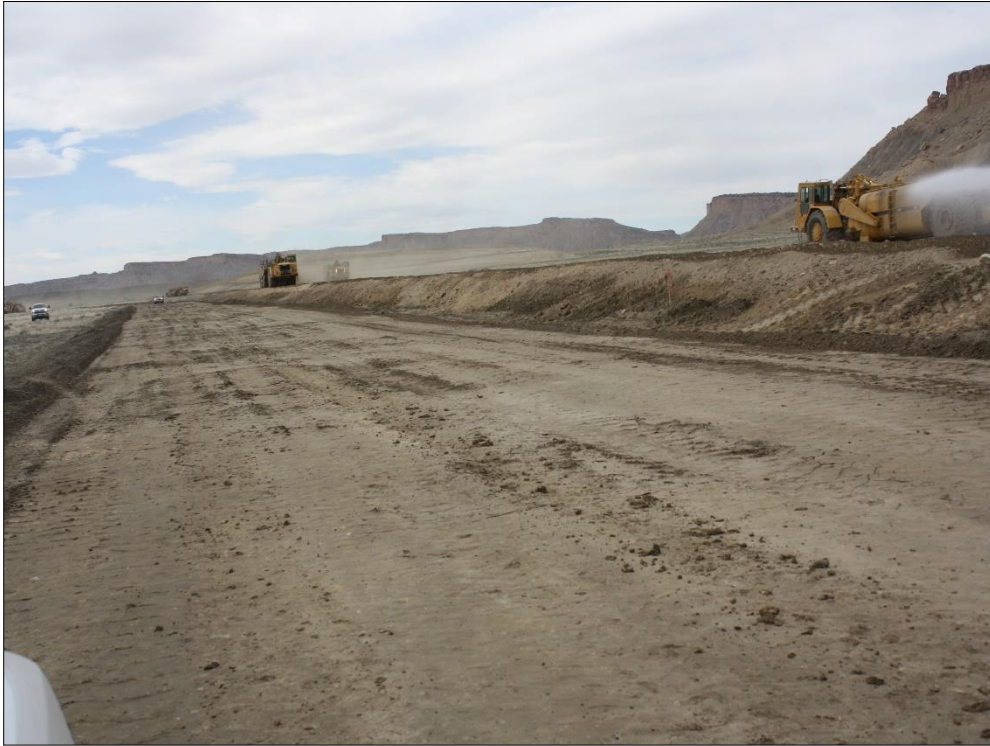
Photo 29. Spoils Embankment Placement March 21, 2017