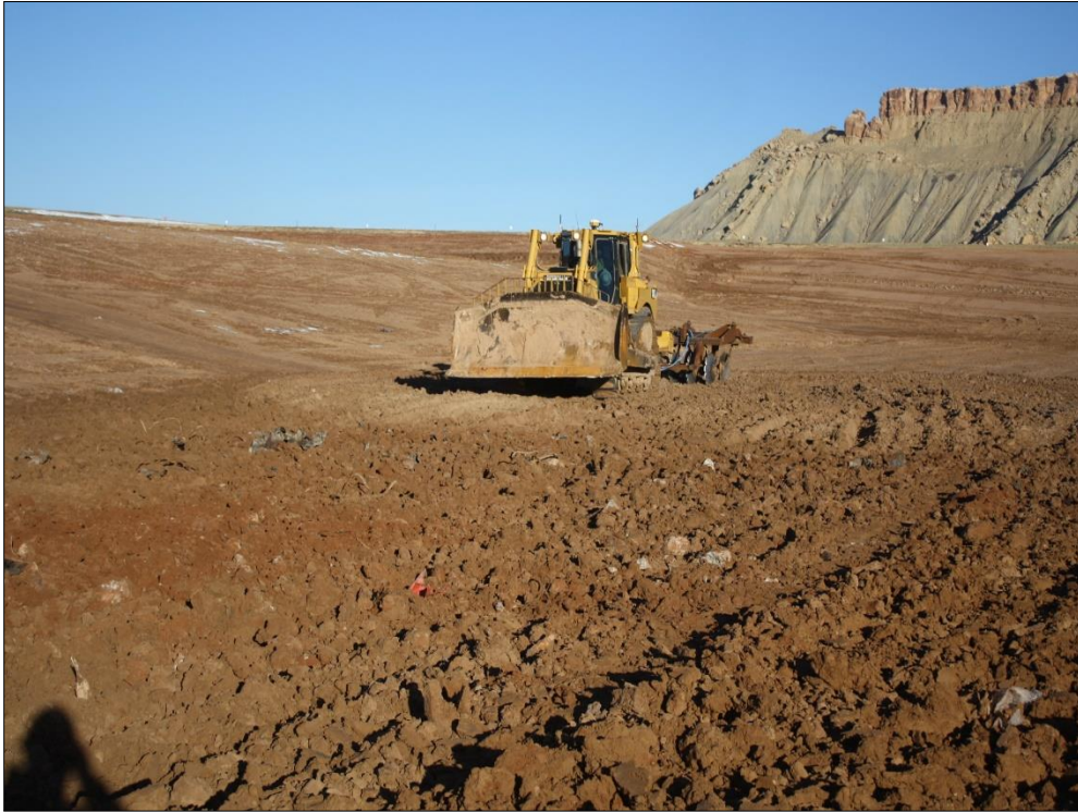
Photo 11. RRM Placement December 28, 2016