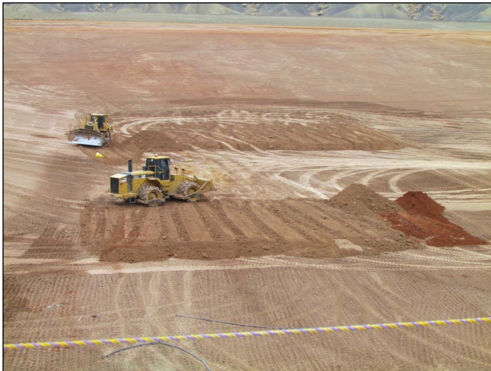
Photo 28. RRM Placement - Debris August 23, 2016