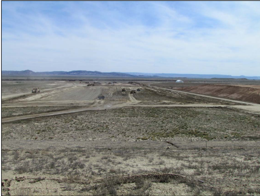
Photo 5. Phase 3a Cell Excavation April 7, 2016