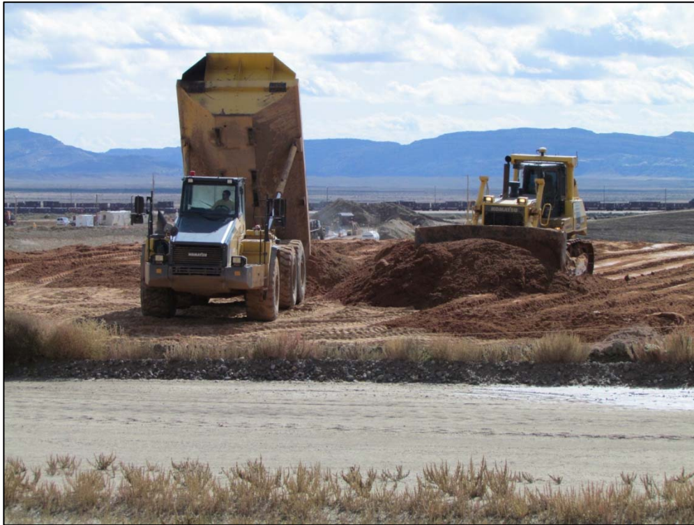
Photo 11. RRM Placement October 26, 2015