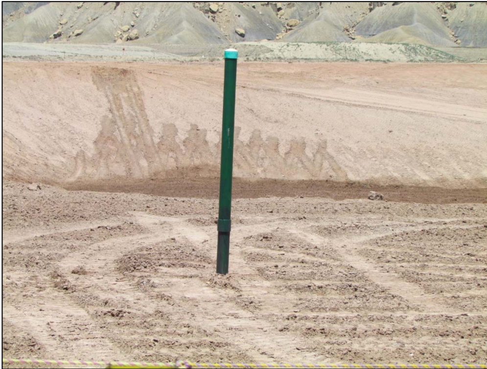
Photo 23. RRM Placement - Standpipe Compaction June 20, 2016