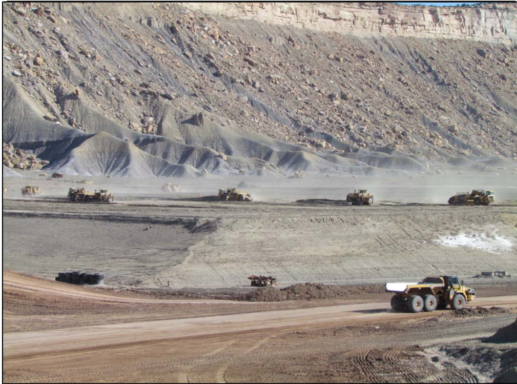
Photo 3. Phase 3a Cell Excavation March 22, 2016