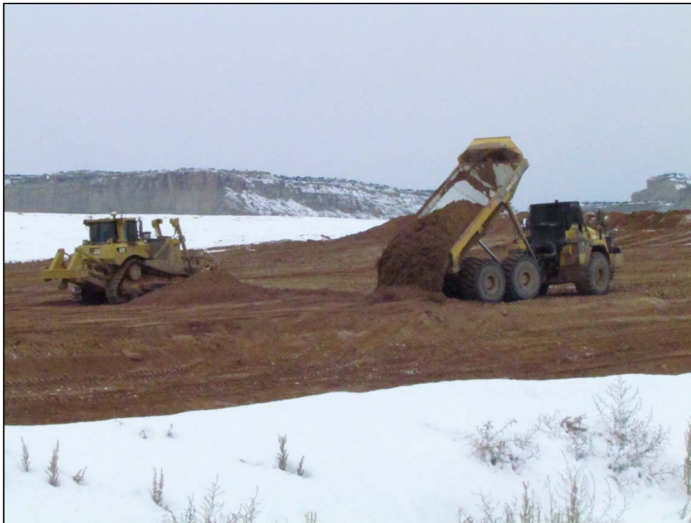
Photo 16. RRM Placement February 4, 2016