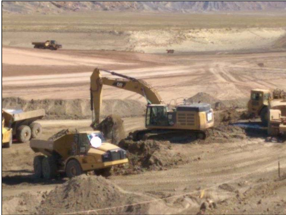
Photo 10. Perimeter Embankment October 2015