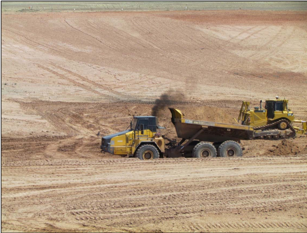
Photo 21. RRM Placement June 8, 2016