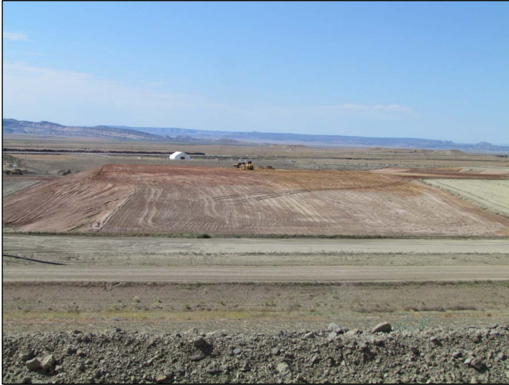
Photo 25. RRM Placement Top of Waste July 26, 2016