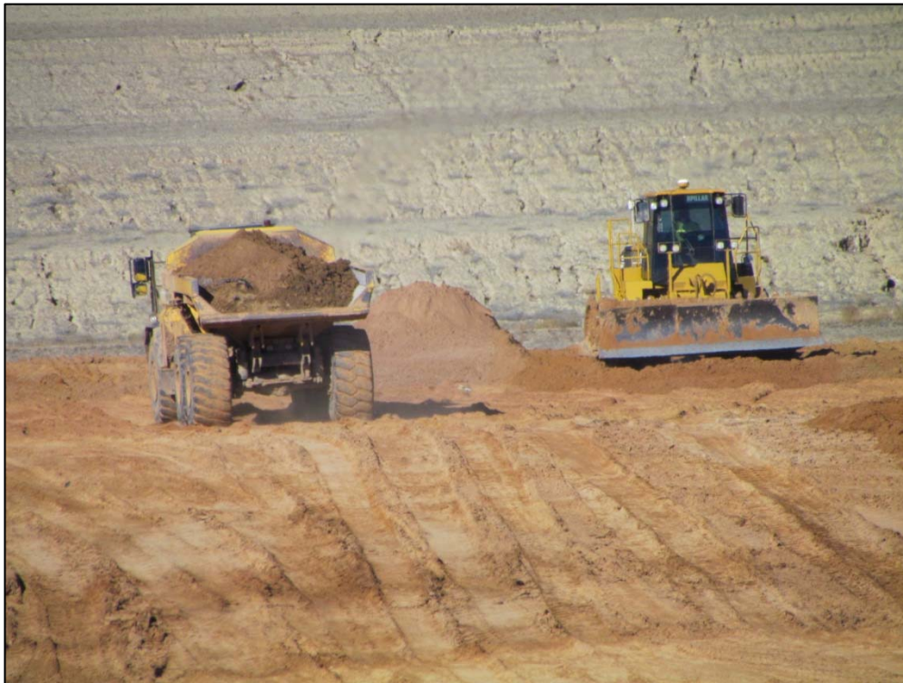
Photo 12. RRM Placement November 17, 2015