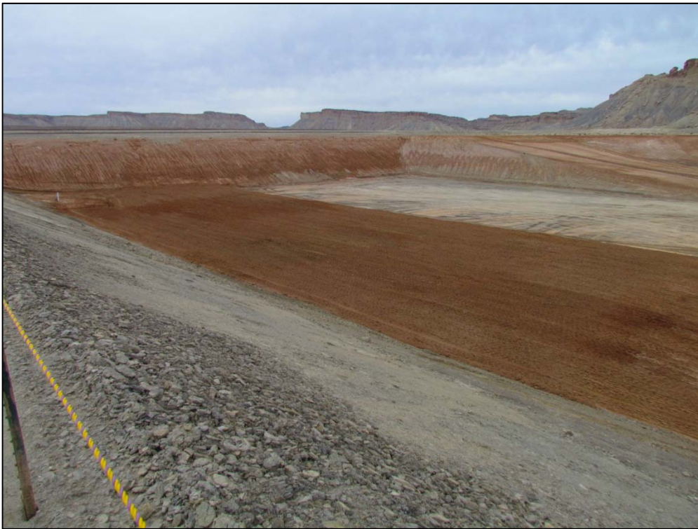
Photo 14. RRM Placement December 10, 2015