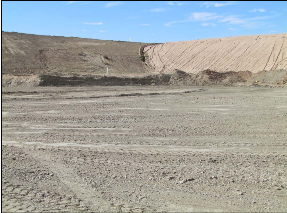
Photo 1. Removal of Former Dump Ramp in Phase 2 October 1, 2015