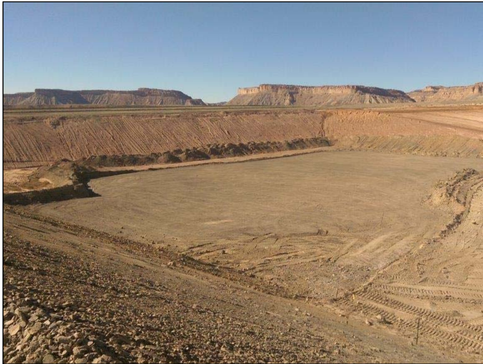
Photo 2. Removal of Former Dump Ramp in Phase 2 October 1, 2015