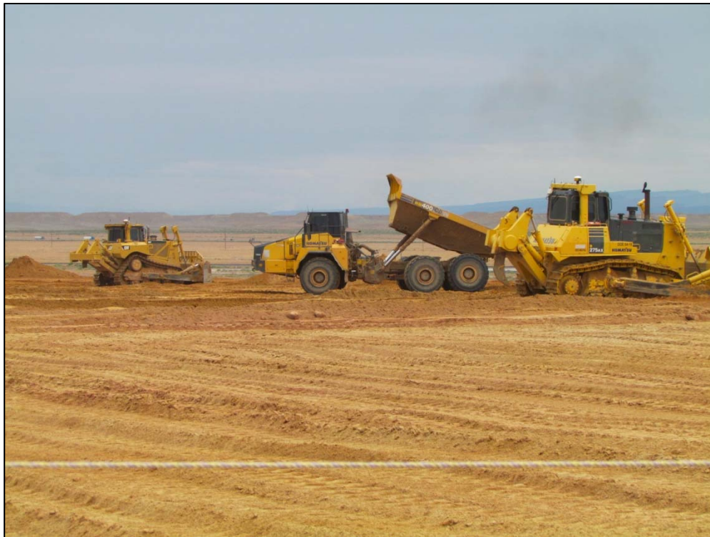
Photo 26. RRM Placement Top of Waste August 4, 2016