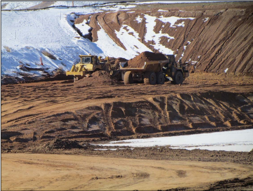
Photo 15. RRM Placement January 28, 2016