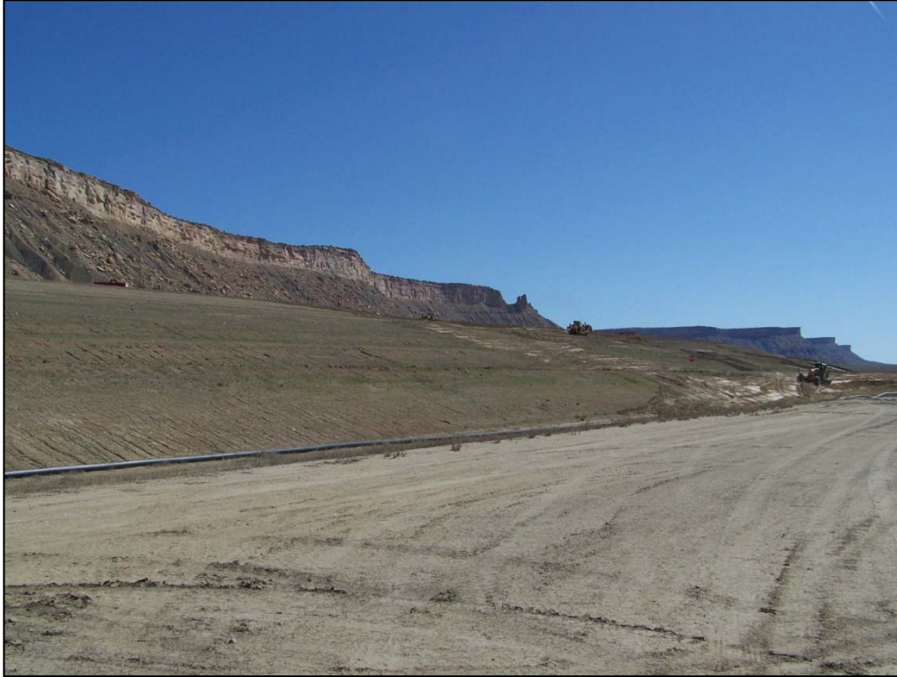
Photo 35. Spoils Embankment Placement May 12, 2016