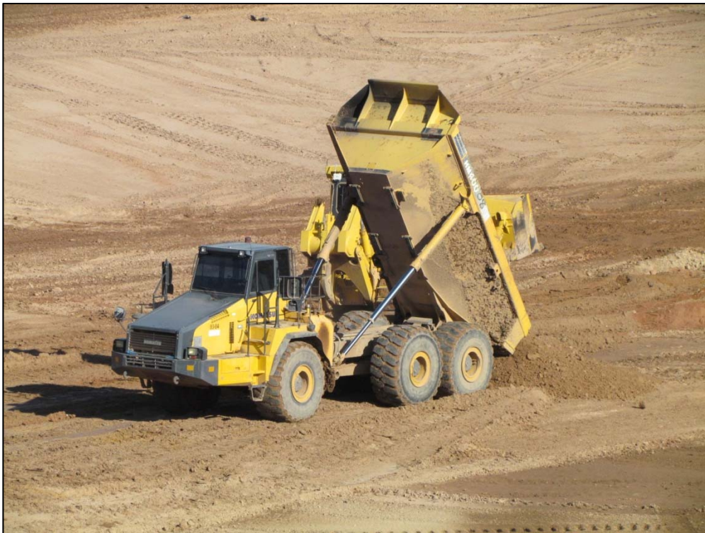
Photo 30. RRM Placement September 8, 2016