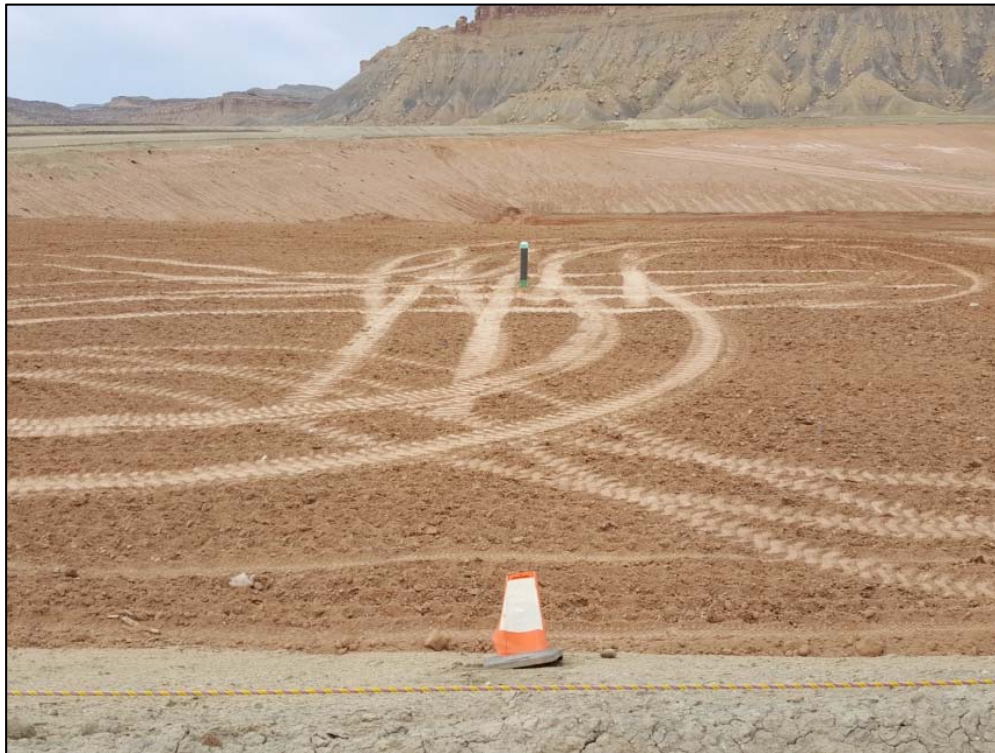
Photo 20. RRM Placement May 26, 2016