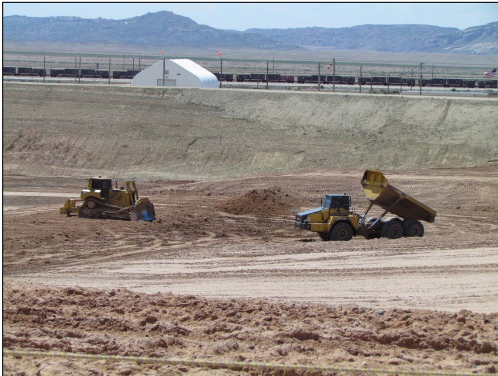
Photo 22. RRM Placement June 8, 2016