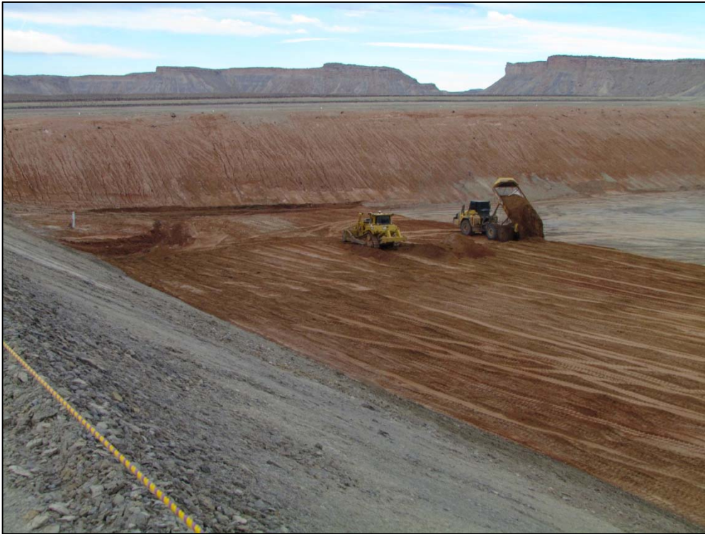
Photo 13. RRM Placement December 8, 2015