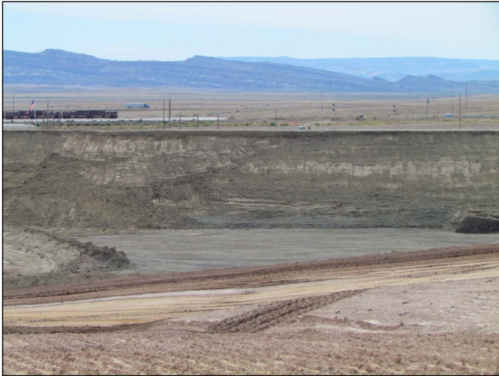
Photo 8. Perimeter Embankment October 8, 2015