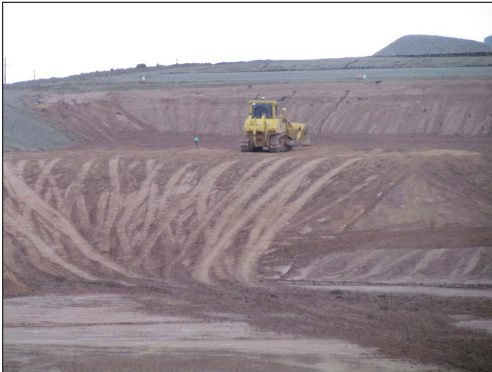
Photo 18. RRM Placement March 29, 2016