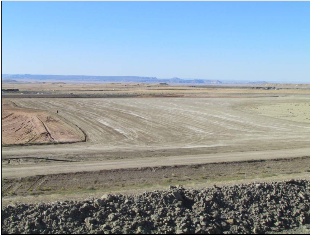
Photo 32. Completed Interim Cover September 8, 2016