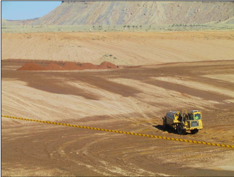
Photo 29. RRM Placement September 8, 2016