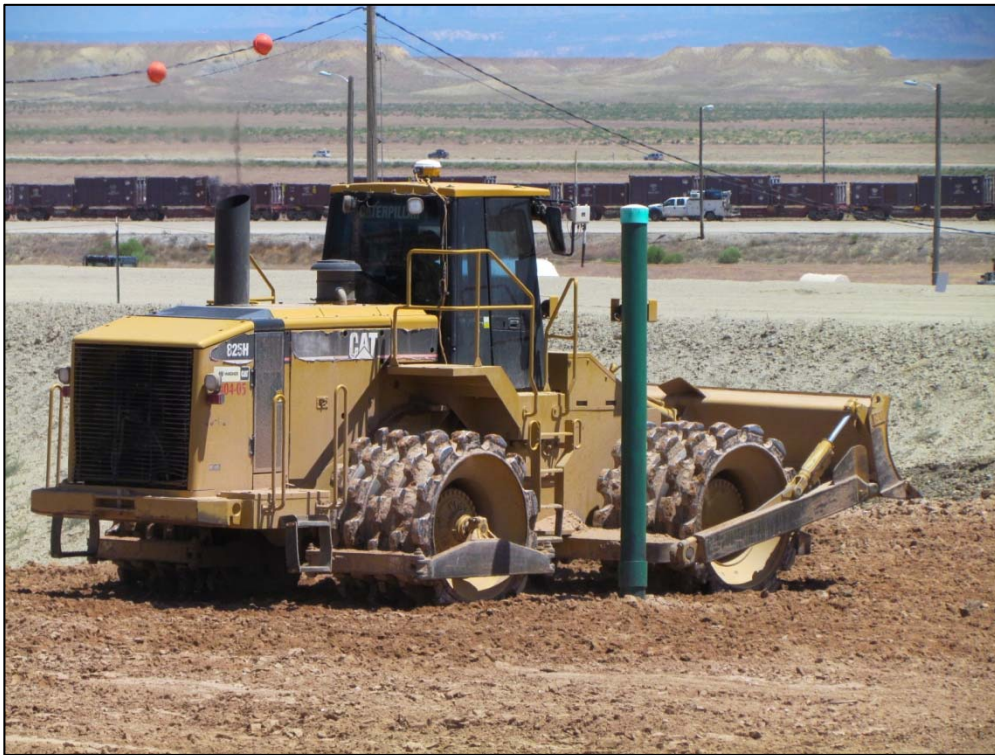
Photo 24. RRM Placement - Standpipe Compaction July 5, 2016