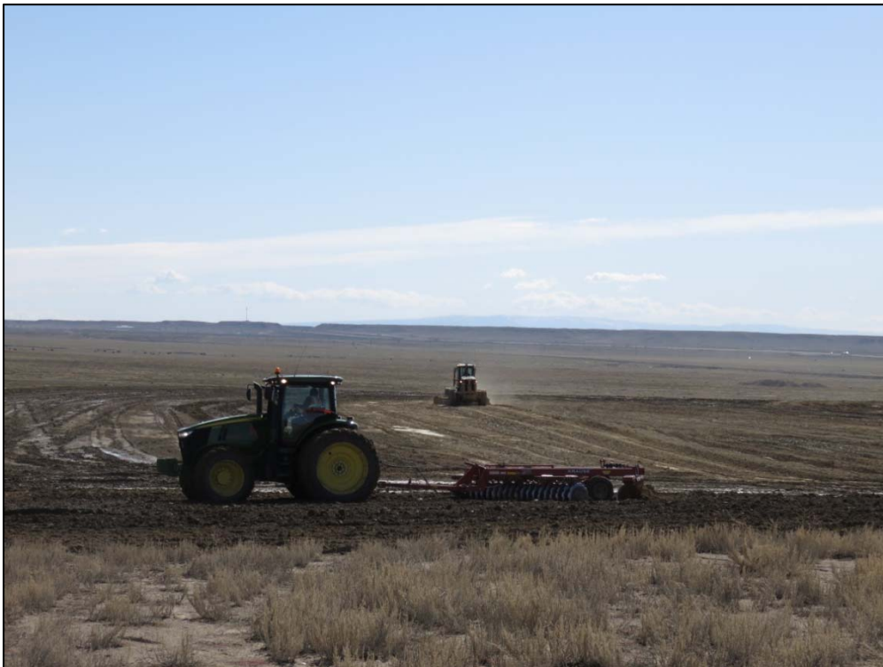
Photo 34. Spoils Embankment Placement April 5, 2016