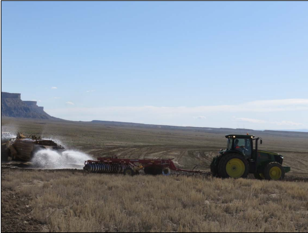
Photo 33. Spoils Embankment Placement April 5, 2016