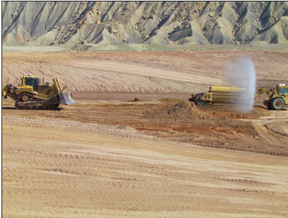
Photo 27. RRM Placement August 9, 2016