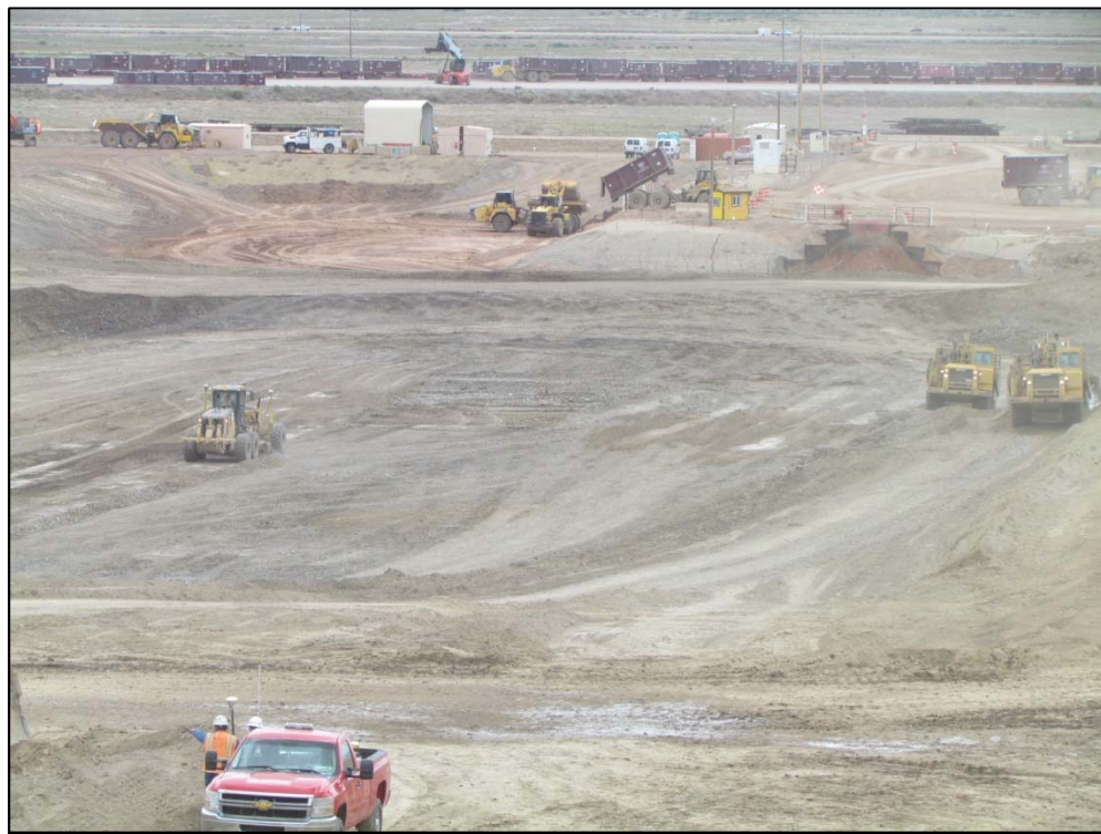
Photo 6. Phase 3a Cell Excavation April 18, 2016