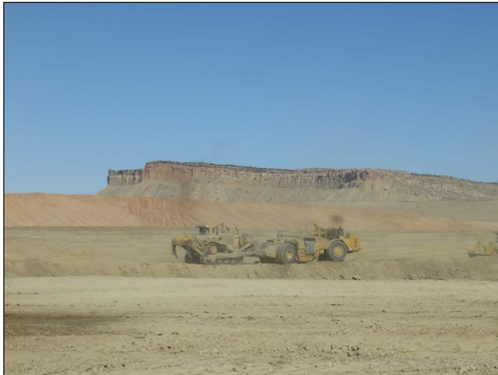
Photo 4. Phase 3a Cell Excavation April 5, 2016