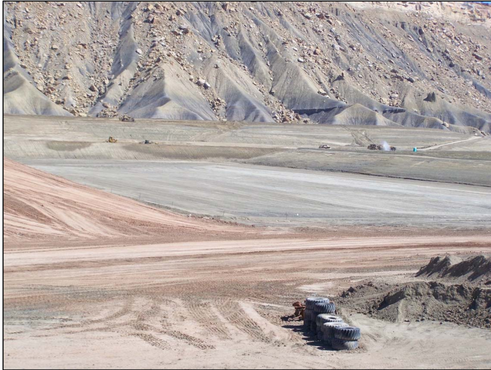
Photo 7. Phase 3a Cell Excavation May 12, 2016