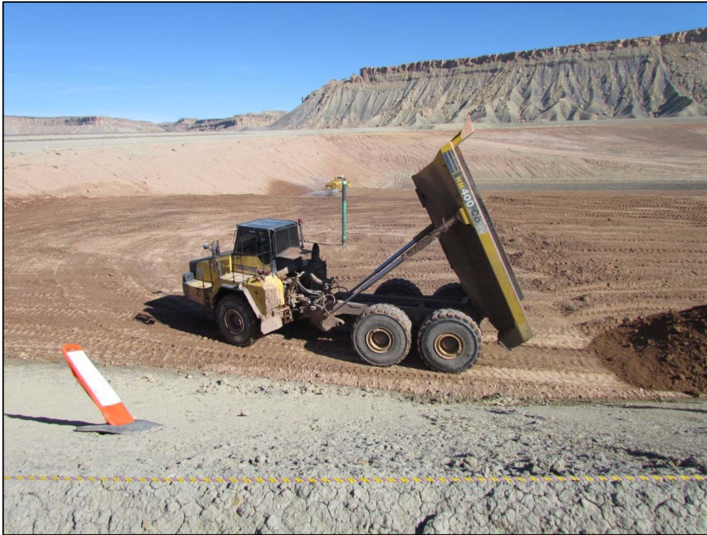
Photo 19. RRM Placement April 13, 2016