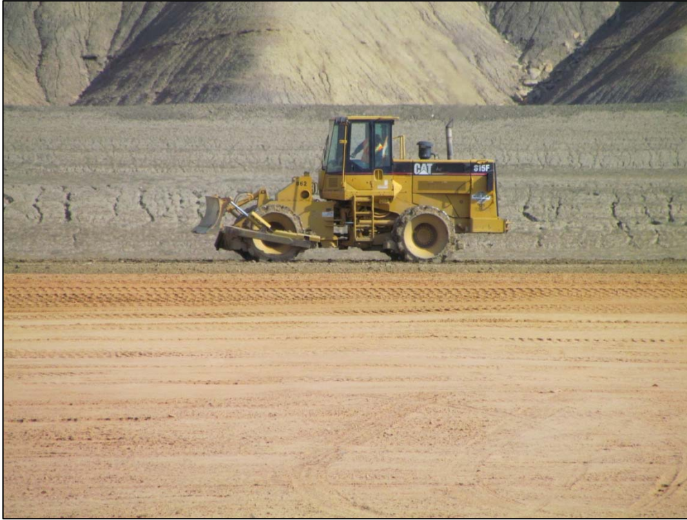
Photo 31. Interim Cover Placement August 25, 2016