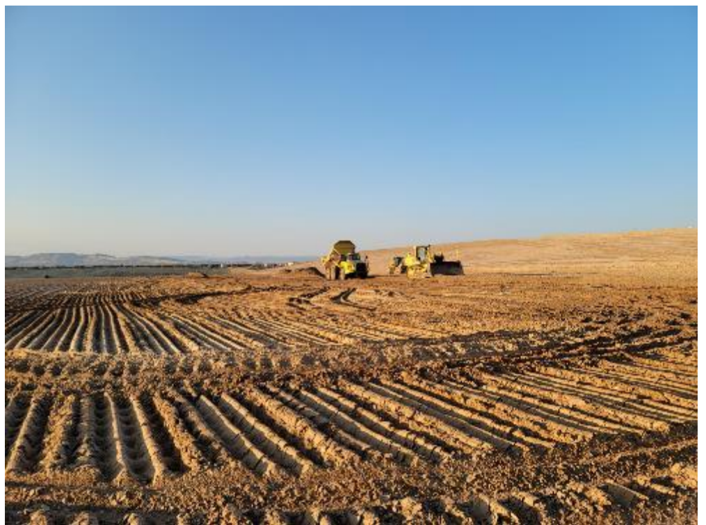
Appendix B. Photographs – RRM (continued)