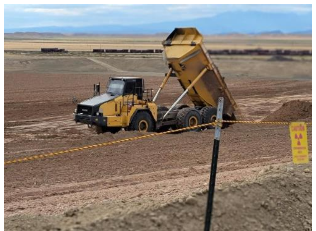
Appendix B. Photographs – RRM (continued)