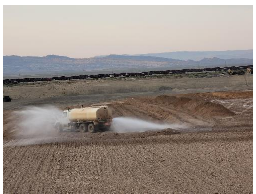
Photo 62. Dust Suppression and Moisture Conditioning September 2021