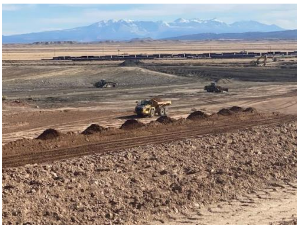
Appendix B. Photographs – RRM (continued)