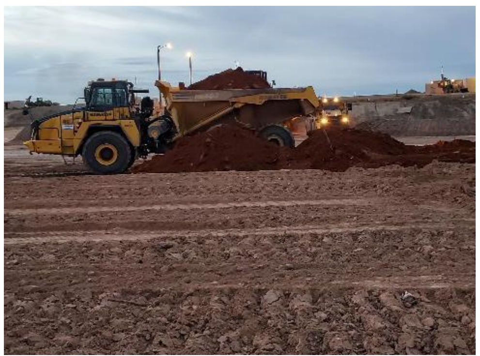
Appendix B. Photographs – RRM (continued)