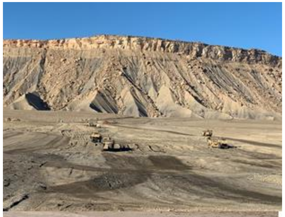
Appendix B. Photographs – Cell Excavation (continued)