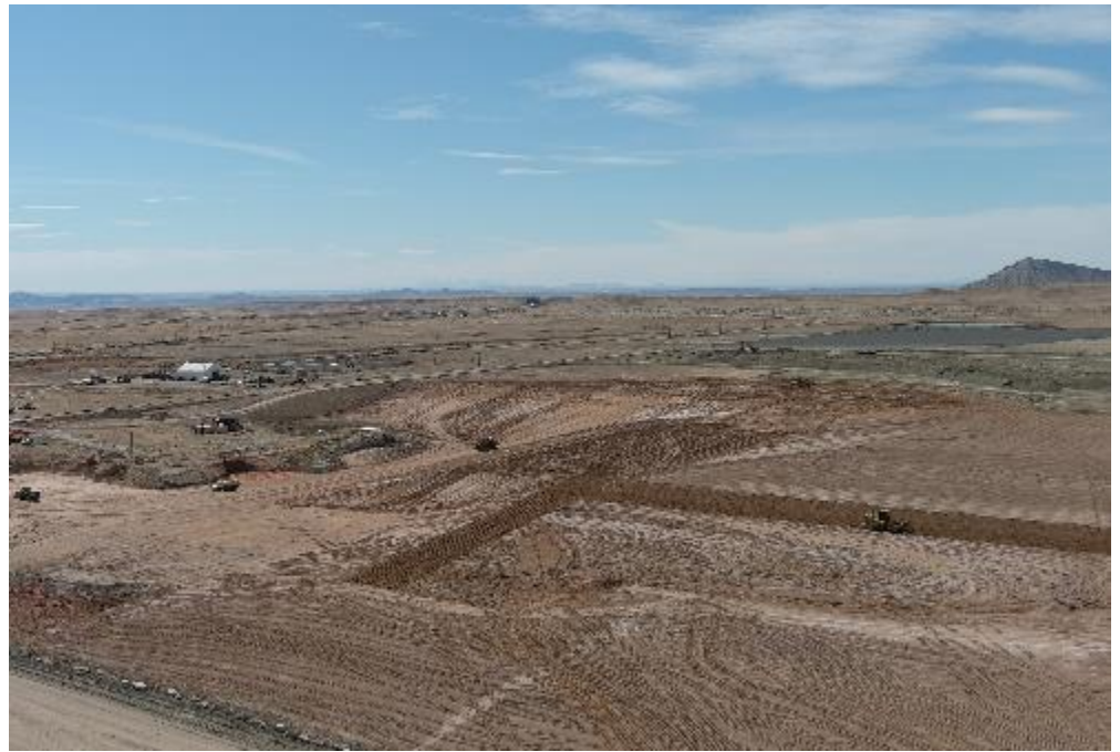
Appendix B. Photographs – RRM (continued)