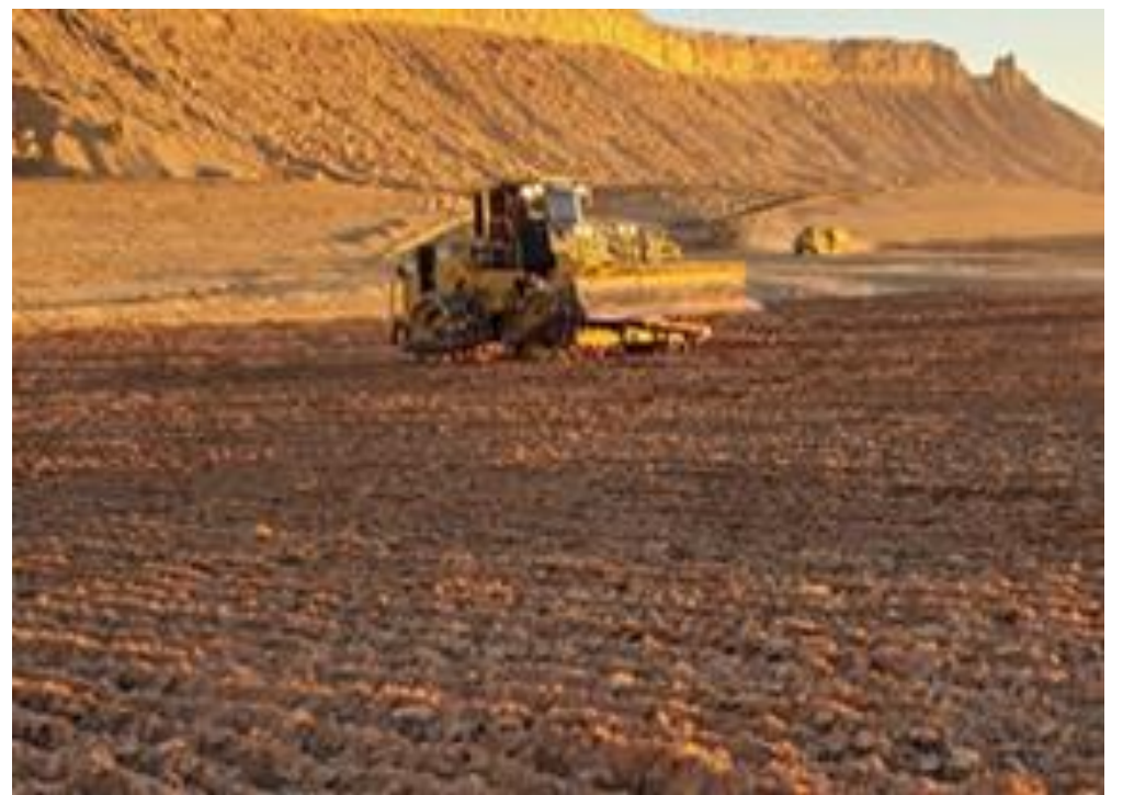
Appendix B. Photographs – RRM (continued)