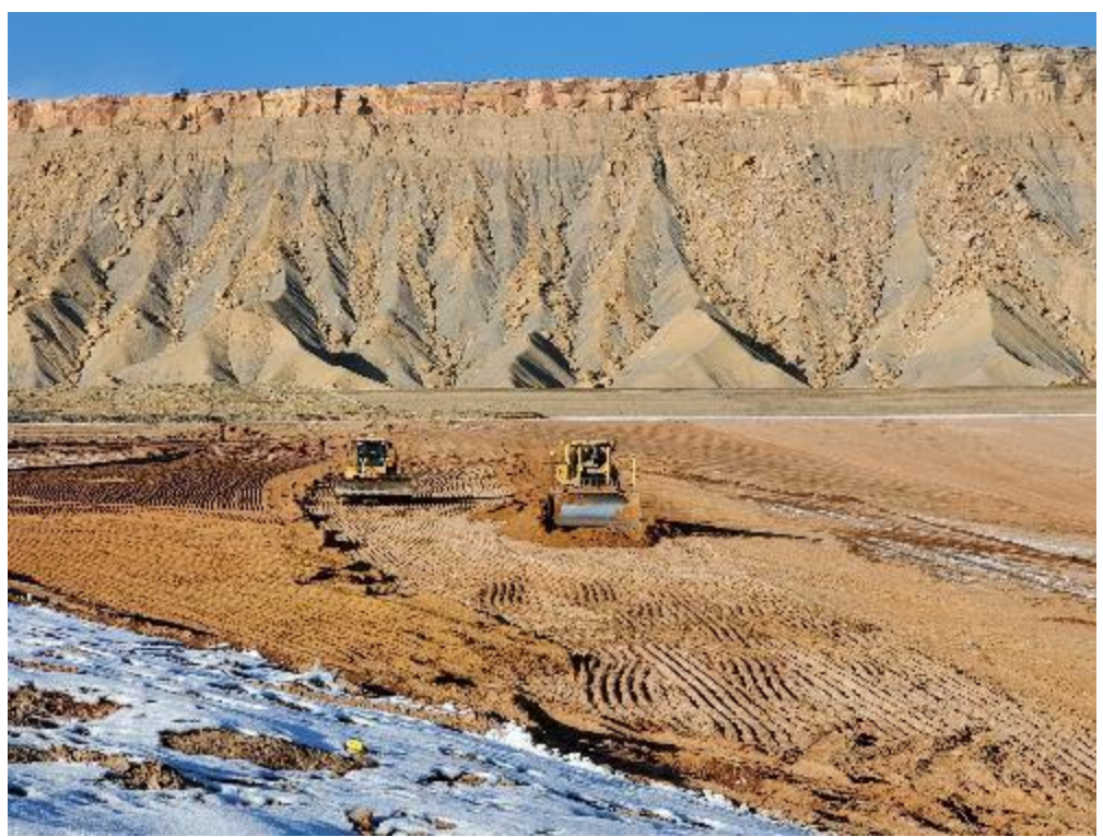
Appendix B. Photographs – RRM (continued)