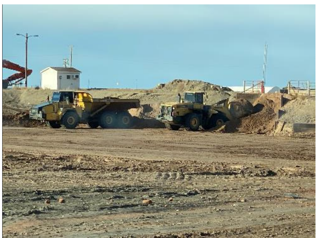
Appendix B. Photographs – RRM (continued)