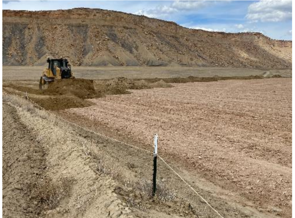
Appendix B. Photographs – Interim ( continued )