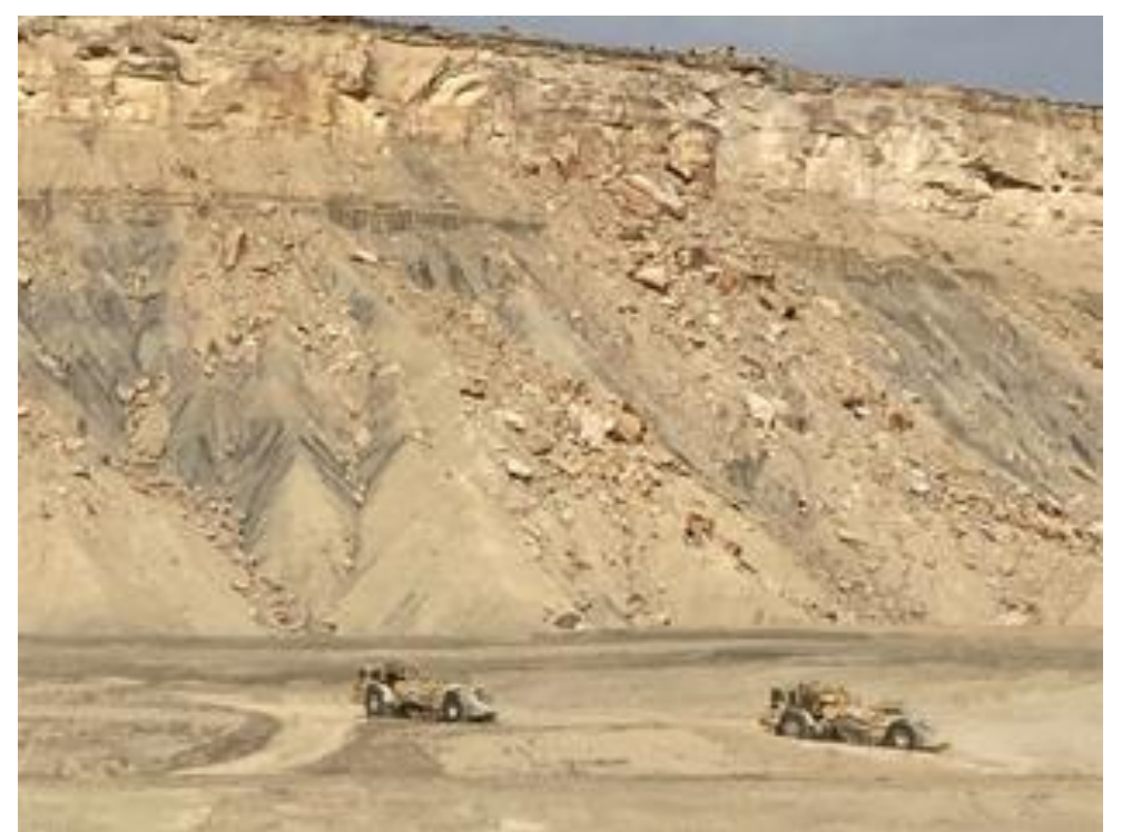
Appendix B. Photographs – Cell Excavation ( continued )