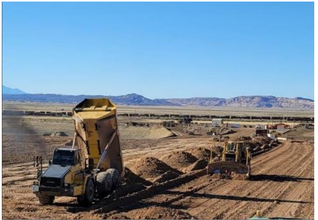
Photo 47. Placement of Material on Lift Area by Haul Truck May 2021