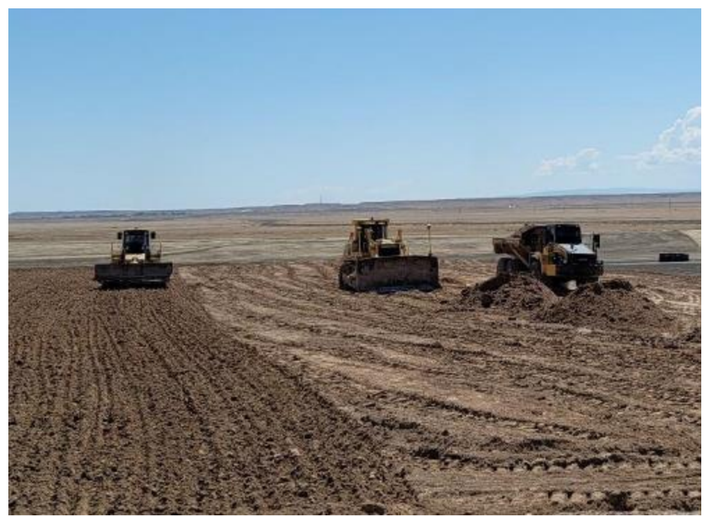
Appendix B. Photographs – RRM (continued)