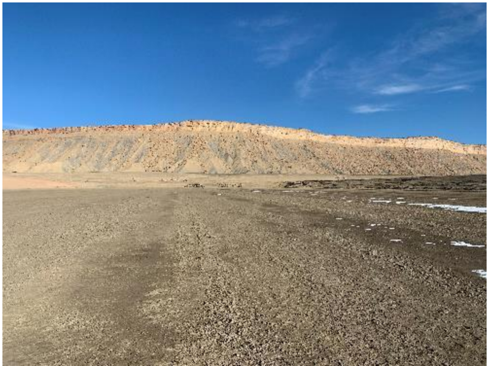
Appendix B. Photographs – Cell Excavation (continued)