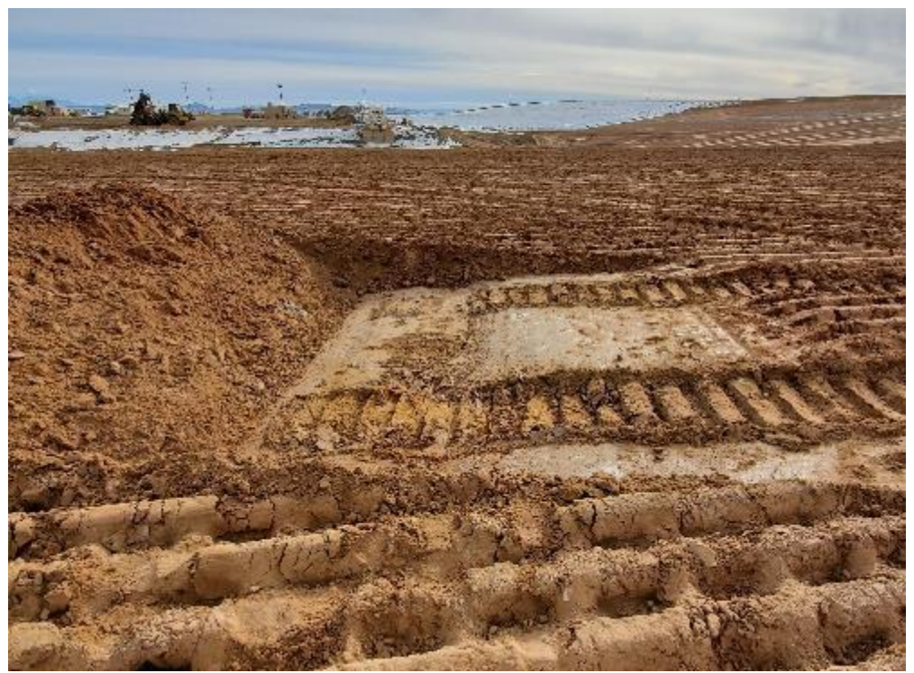
Appendix B. Photographs – RRM (continued)