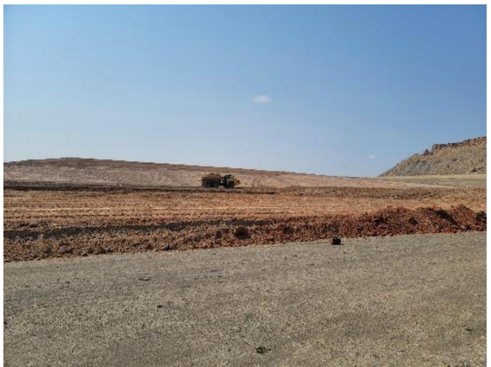
Appendix B. Photographs – RRM (continued)