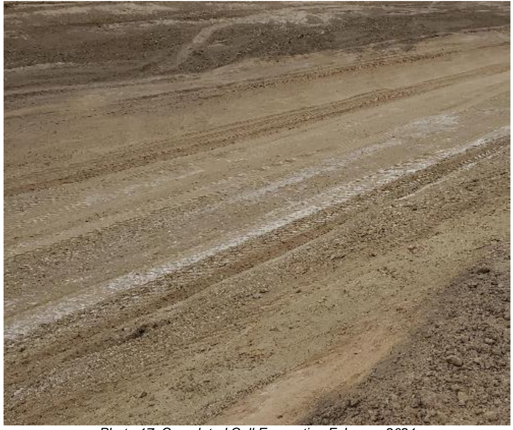
Appendix B. Photographs – Cell Excavation (continued)