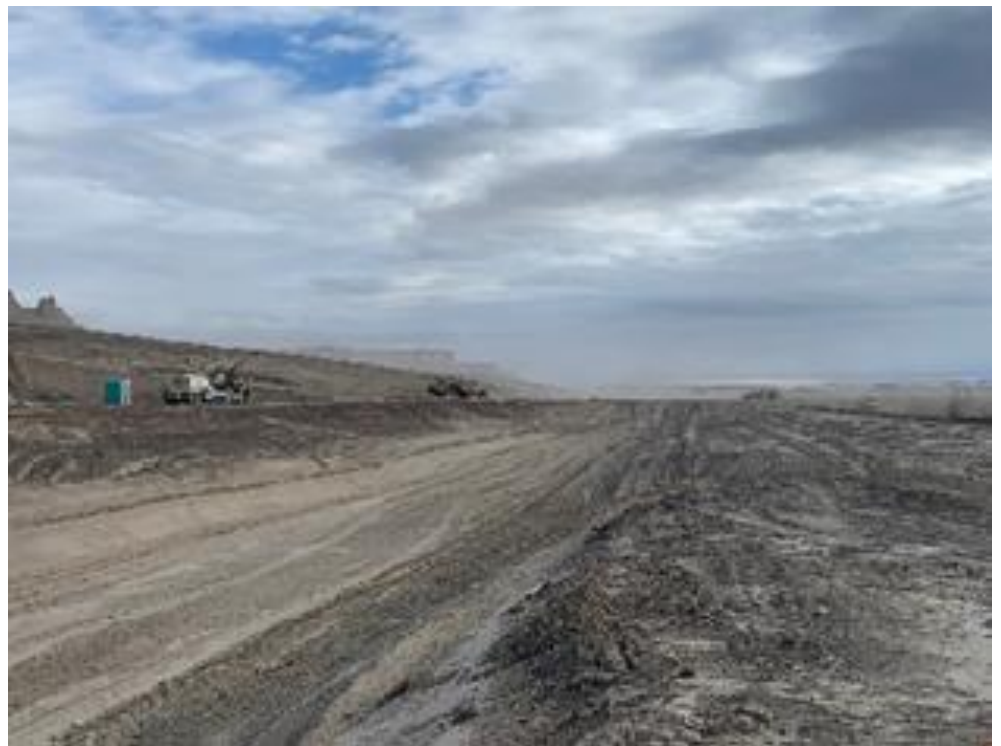
Appendix B. Photographs – Cell Excavation (continued)