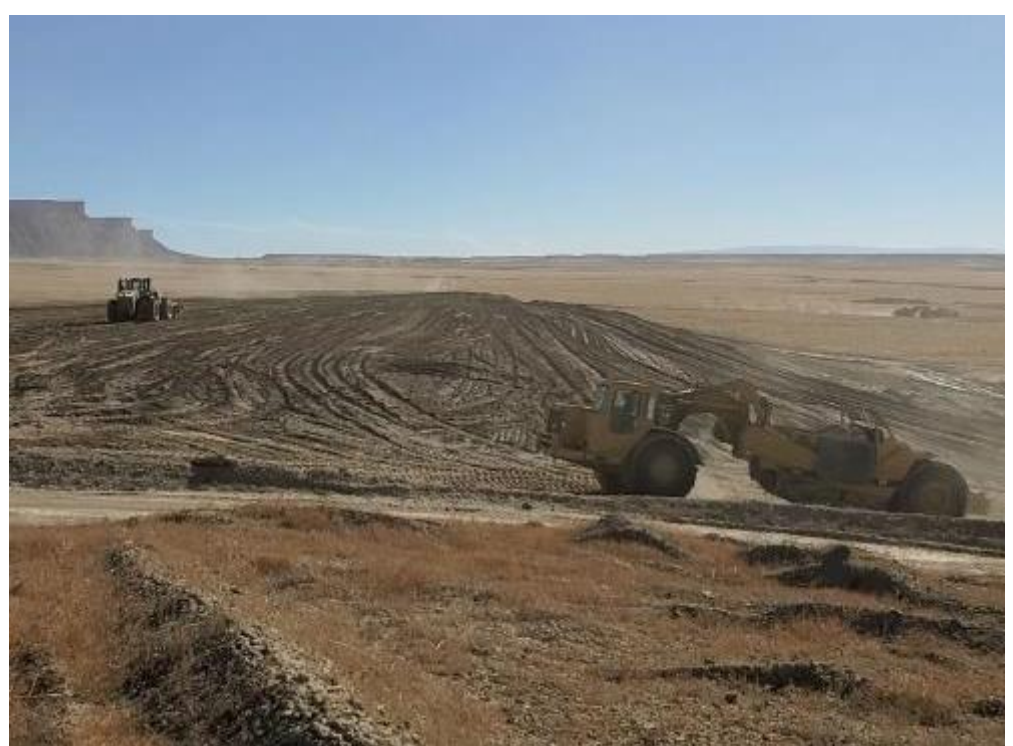
Photo 76. Hauling Material for Placement on Spoils Embankment November 2020