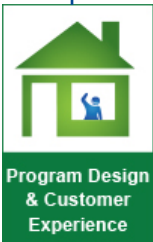
Program Design & Customer Experience