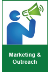
Marketing & Outreach