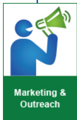
Marketing & Outreach