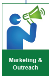
Marketing & Outreach