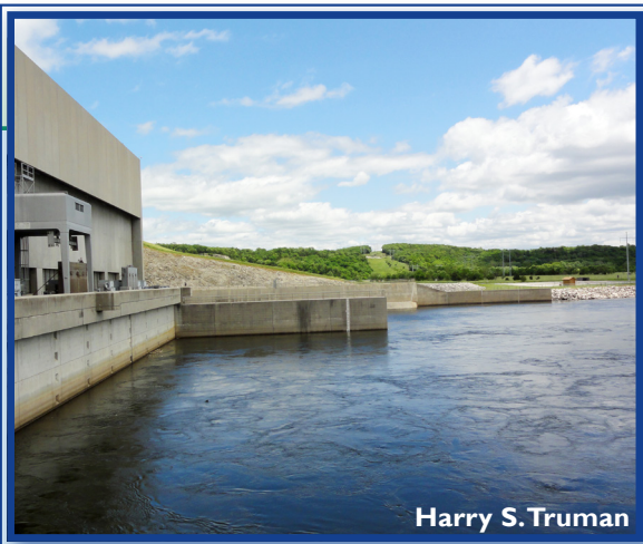
Harry S. Truman