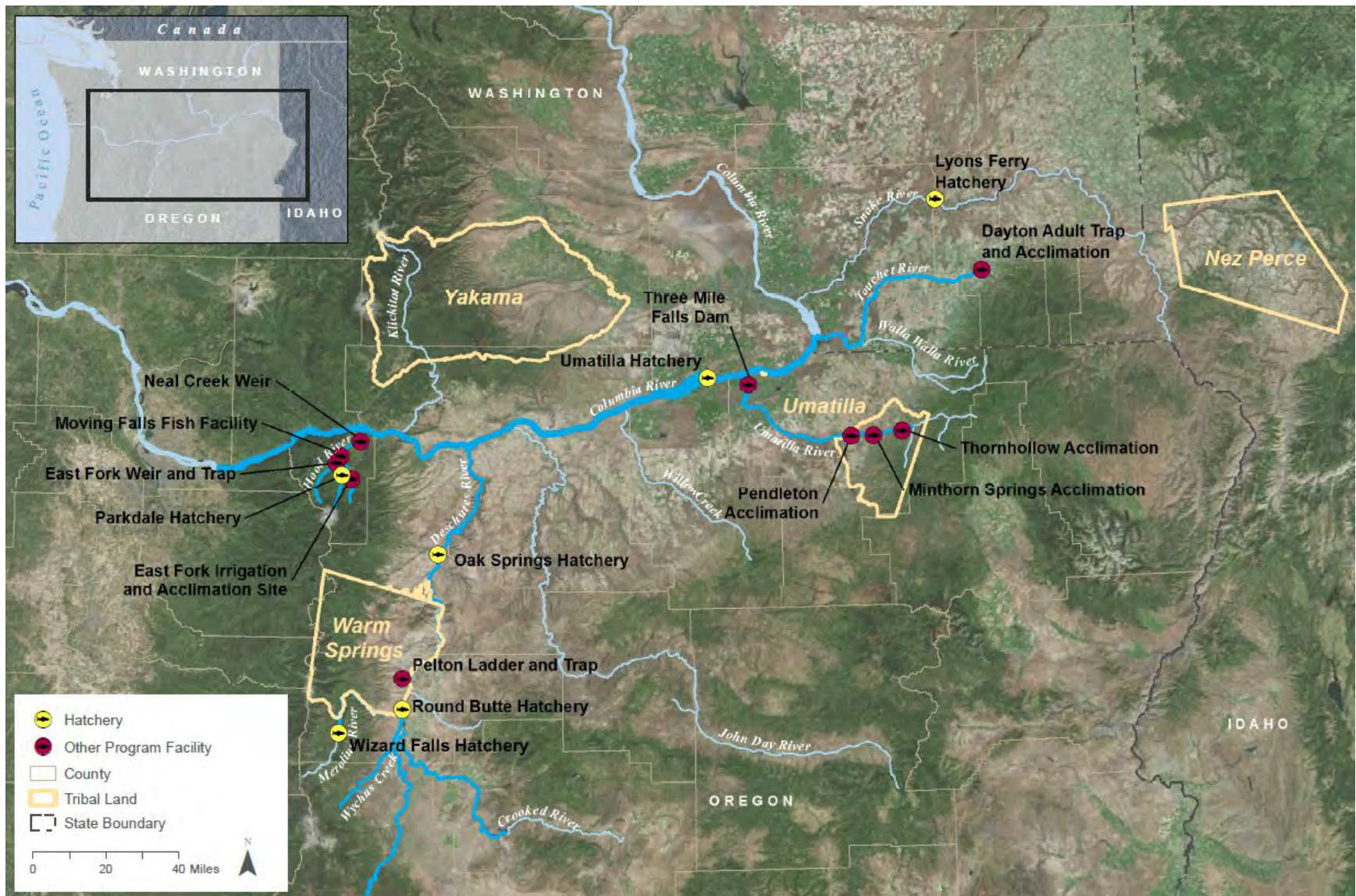
1 2 Figure 3-1. Map of Study Area for Cultural Resources Showing Tribal Reservations