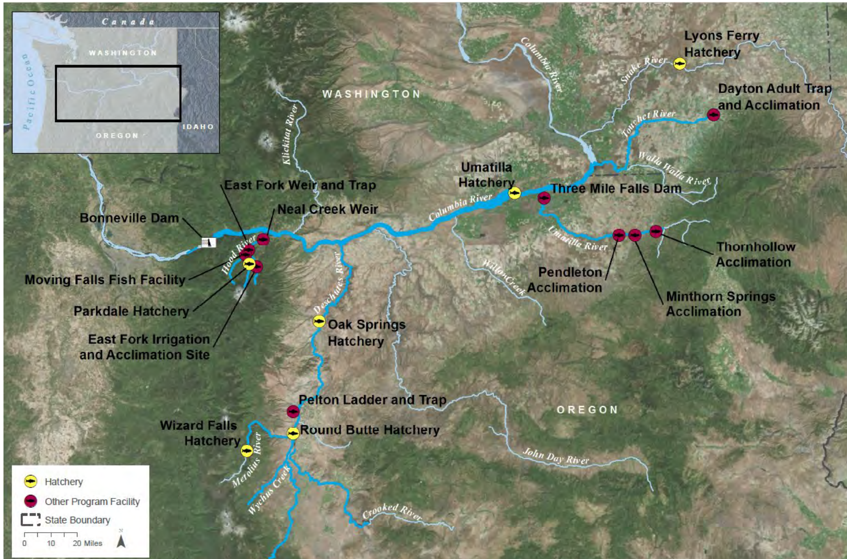
1 2 Figure 1-1. Map of Project Area, Highlighting the River Reaches (Dark Blue Shading) and Hatchery Facilities Included (the Snake 3 River adjacent to Lyons Ferry Hatchery is included in the Project Area)