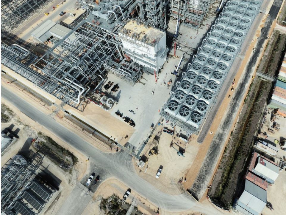
Asphalt in progress at South side of Train 6