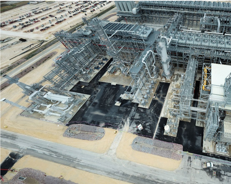
Asphalt complete at North side of Train 6