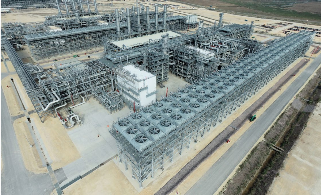
Train 6 and OSBL Substantial Completion