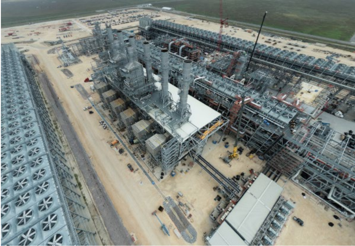
Progress at Train 6