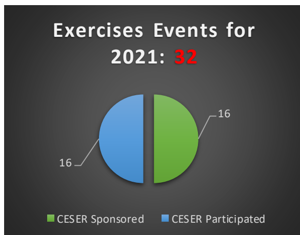
Table 1: Total Exercise Events for 2021

The final section of this report provides a summary of the 2022 strategic vision for the CESER ESE Program and provides a glimpse of anticipated major exercises scheduled for 2023 and 2024.