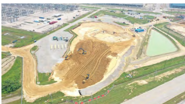
A northeast aerial view of the X-740 Groundwater Plume Excavation Project shows continuing progress on the site’s west side.

Operations at the OSWDF will be enhanced by a regulatory agreement that allows previously closed landfills and plumes within the site’s perimeter to be excavated and used as engineered fill at the OSWDF. The unique approach eliminates the need for off-site soils and will free up close to 1,000 acres of contiguous land to the community for beneficial reuse. In 2021, excavation of the X-740 groundwater plume was completed and provided approximately 37,000 cubic yards of soil as engineered fill for the OSWDF.