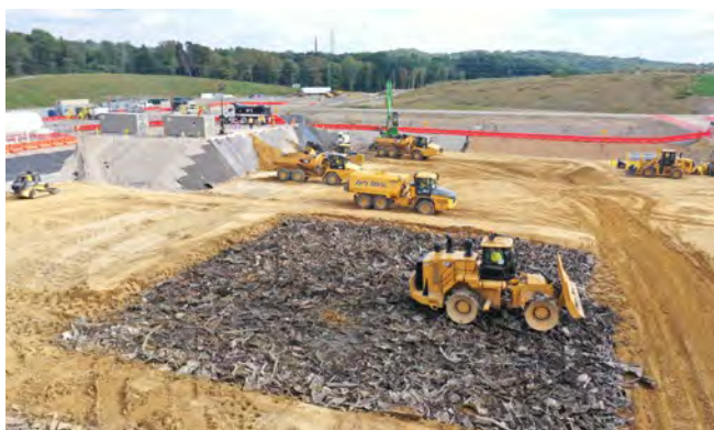
At the OSWDF, placement operations continue as a landfill compactor compresses debris from the X-326 demolition project.

The OSWDF began operations in 2021 as the landfill specifically engineered to safely accept debris from demolition at the Portsmouth Gaseous Diffusion Plant. The OSWDF received its first waste placement from the X-326 process building demolition in May. In total, the OSWDF expects to receive up to 5 million cubic yards of demolition debris and soils from the Portsmouth cleanup project.