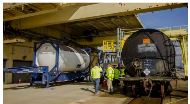
Workers prepare R-114 for removal from the Paducah site.

The project team also continued the multi-year project removal of R-114 refrigerant from the Paducah site. Used to cool equipment in the uranium enrichment process during production years, the site was left with eight million pounds of the product in storage. In 2021, the site removed and shipped 1.5 million pounds for treatment and disposal.