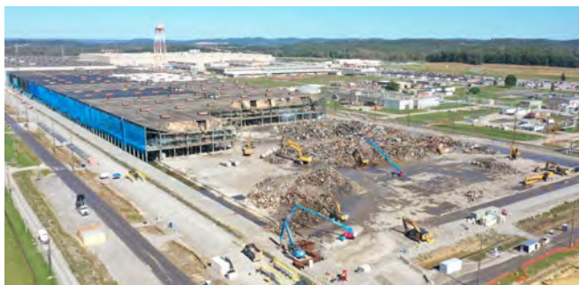
Demolition of the X-326 process building began in May.

In May, following more than nine years of safe and systematic deactivation, workers began the structural demolition of the 2.6 million square-foot X-326 process building, one of the three large former uranium enrichment facilities at the site. By the end of December, 40 percent of the building’s structure had been demolished, with the expectation that the remaining structural demolition will be completed in 2022.