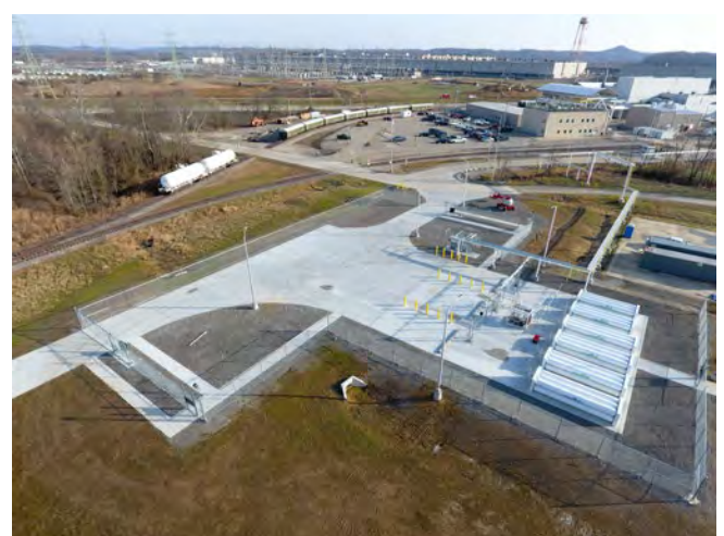
Aerial view of the bulk hydrogen system at the Portsmouth DUF6 facility.

Although DUF6 conversion operations were paused in 2021, the project moved forward with several major upgrades to the plants at Portsmouth and Paducah that will enhance their reliability and safety. This included the installation of the bulk hydrogen system at the plants. The bulk hydrogen systems will give the plants an alternate source of hydrogen, which is required for DUF6 conversion, thereby decreasing downtime during unplanned shutdowns.