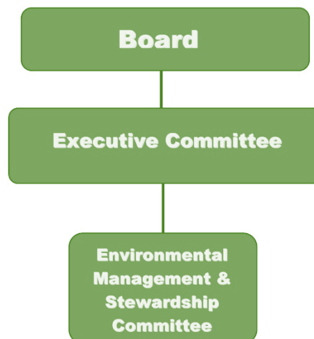
Figure 1. ORSSAB organizational structure.

Each year the board holds a planning meeting to determine how best to address its mission and what its committee structure should be. A summary of that meeting is available on the ORSSAB website at www.energy.gov/orssab . The board's organizational structure is shown in Figure 1. As allowed by ORSSAB Bylaws, other committees may be formed as needed during the year to address specific issues.