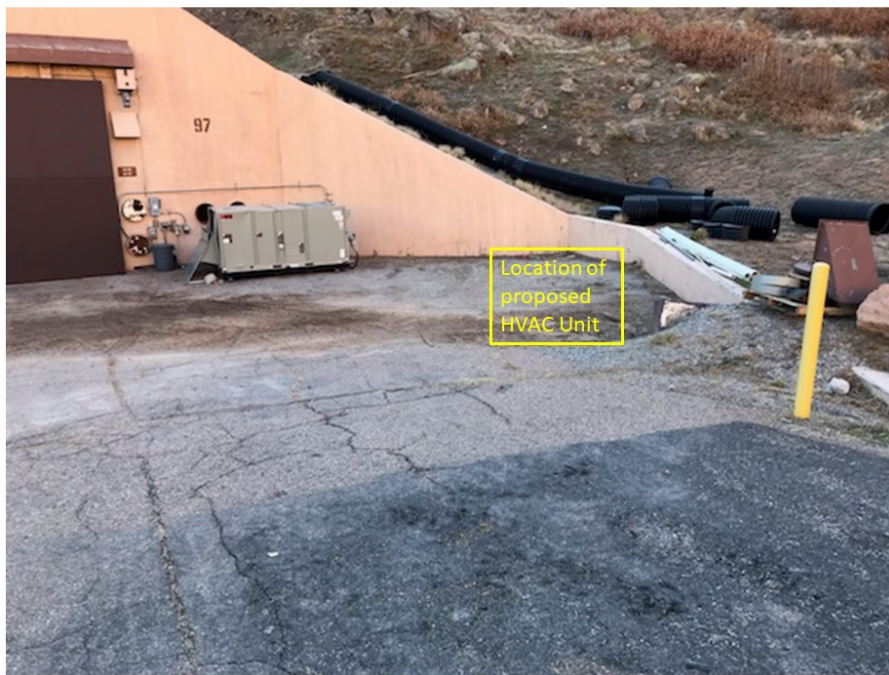
Photo 1. Proposed location of the HVAC unit on a paved area north of building 39-0097.

The proposed project is the addition of an HVAC unit 50ft north of building 39-0097 on a paved area (Photo 1). A footprint of 16 x 20ft will be cut from the paved area and excavated to a minimum 8in depth and filled with compacted base course to support the structure. The structure housing the condensing units consists of a pre-fabricated concrete pad with concrete shielding side walls and a metal grating roof. The enclosure will be approximately 9ft tall, which is below the top of the adjacent bunker that will act as shielding.