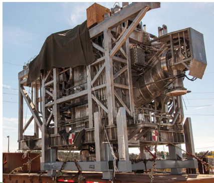
Left: Spare Melter for Waste Vitrification at DWPF.

Savannah River Site (SRS) is treating record-setting amounts of waste as the SWPF proves to be an aggressive workhorse for the site's liquid waste mission.