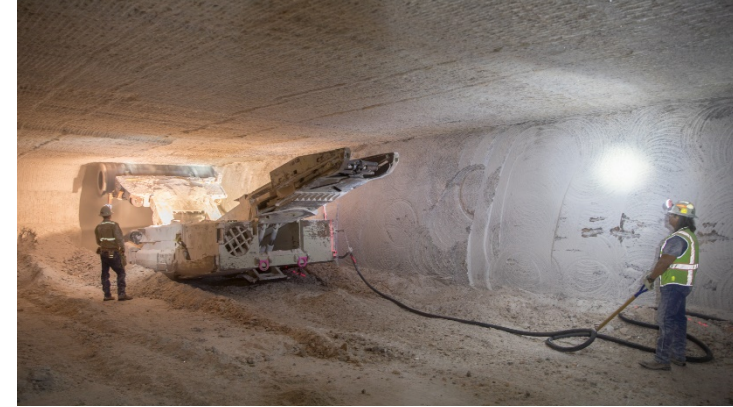
Top: An electric continuous miner machine chews through the last wall of salt in Panel 8's Room 7 to complete the rough cut of the panel.

Right: The SSCVS will be the largest containment fan system among DOE facilities when finished.