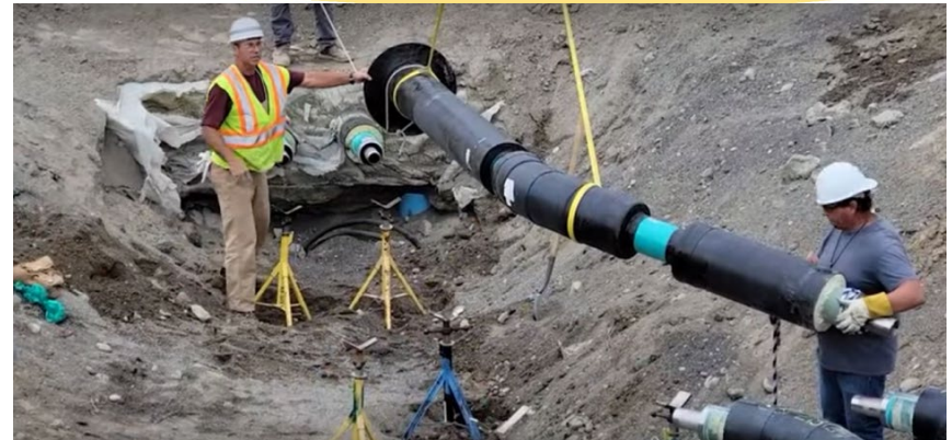
Hanford workers fit sections of double-walled pipe in place, connecting the site's tank farms to the Waste Treatment and Immobilization Plant.