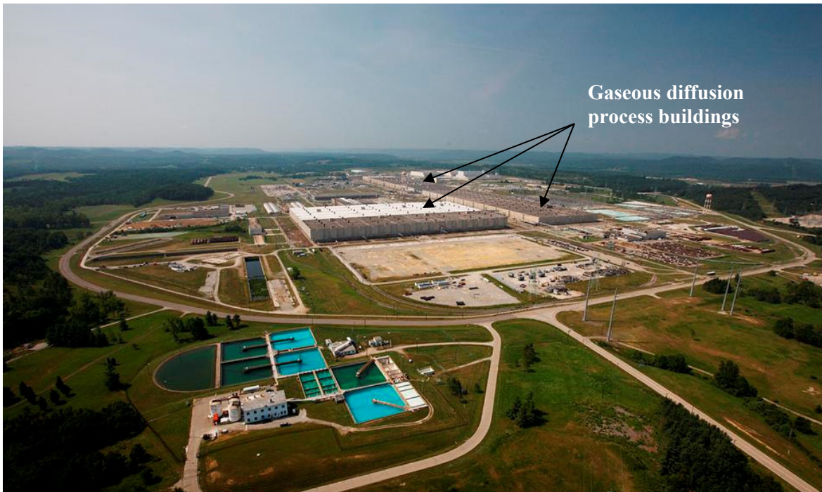
Figure 1.1 The Portsmouth Gaseous Diffusion Plant. (looking from the north-northeast towards the south-southwest)

DOE is responsible for D&D of the gaseous diffusion process buildings and associated facilities, environmental restoration, waste management, and uranium operations. DOE contractors FBP, Portsmouth Mission Alliance, LLC (PMA), and MCS managed DOE programs at PORTS in 2020.