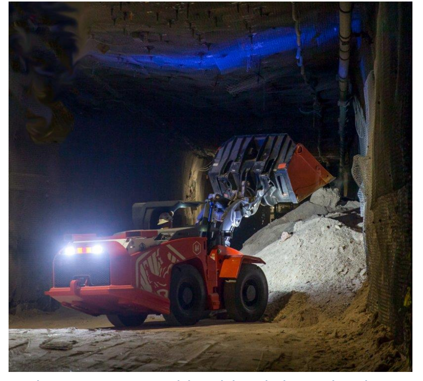
A battery powered load-haul-dump loader moves mined salt in the Waste Isolation Pilot Plant underground.

One of three solar fields at the East Tennessee Technology Park in Oak Ridge, TN. All three solar fields together provide an average of 1.7 megawatts of clean, renewable energy to the local grid annually.