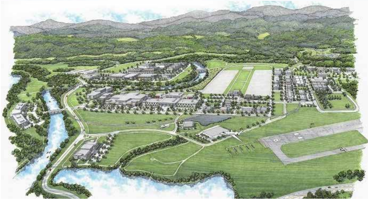
An artist's rendering of ETTP's potential as a fully realized multi-use industrial park. EM is working to complete all remaining cleanup at the site and transfer the land to the community for reuse.