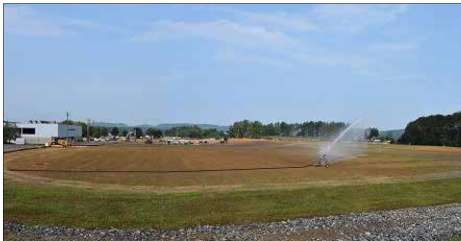
Large tracts of land, such as the former Centrifuge Complex site at ETTP, pictured, offer ideal locations for industrial development.

EM also designated nearly 3,500 acres for conservation, providing habitats for wildlife and hiking trails, bike paths, canoe launches, and other activities for residents and tourists.