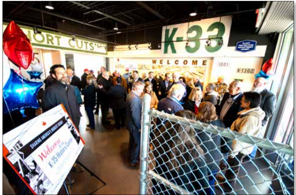
Attendees pack the lobby of the new K-25 History Center at the East Tennessee Technology Park in February 2020 for the center's grand opening celebration and ribbon cutting ceremony.

Since the K-25 MOA was first signed in 2003, it has been revisited several times through the years, and in 2012, a new MOA removed requirements to preserve the North Tower, retain parts of the K-25 building itself, and preserve