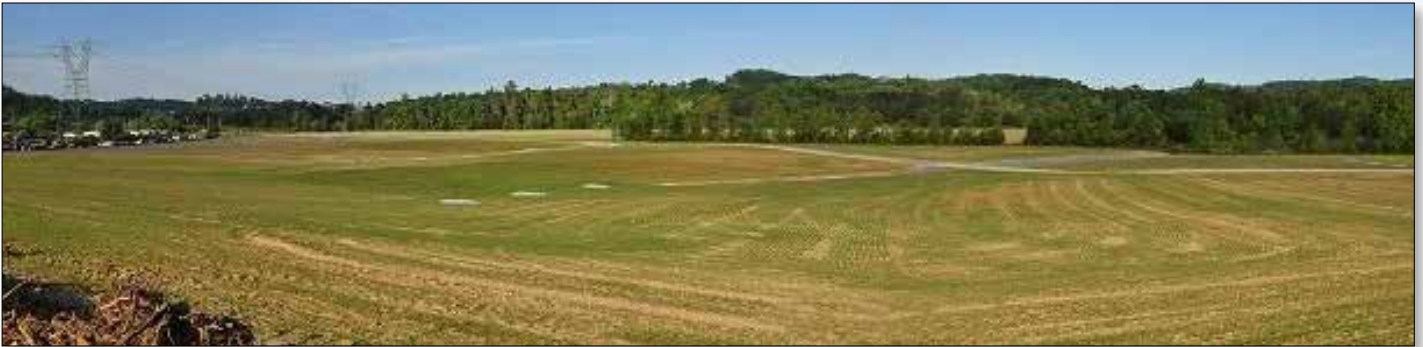
A view of a 21-acre portion of the Powerhouse Area at Oak Ridge. Several sites available for reuse at ETTP are some of the largest tracts of flat land available in our region, making them prime sites for large commercial enterprises to locate and bring jobs to the area.