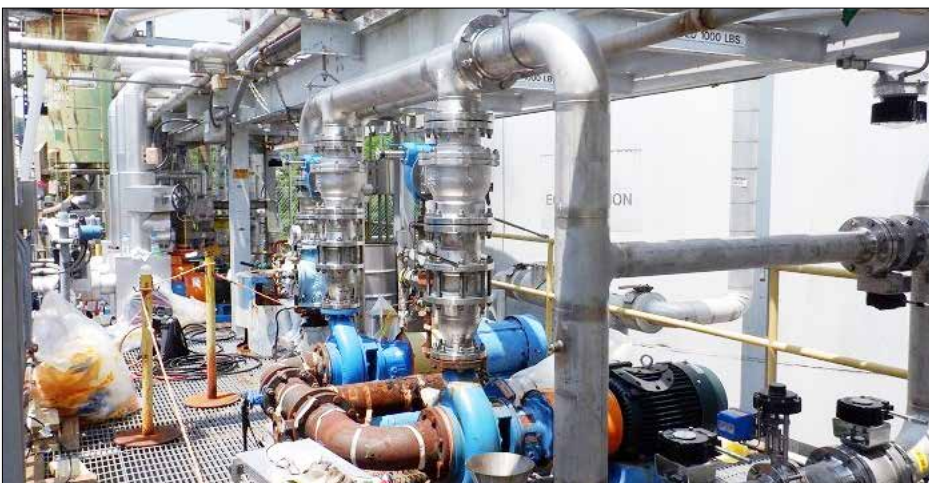
A view of the contrast between piping that is decades old — the rusted brown pipes in the foreground — and new piping workers are installing in the Liquid and Gaseous Waste Operations system at Oak Ridge National Laboratory.

Other efforts include building an evaporator that reduces liquid waste volume and replacing a diesel generator that powers pumping stations if power is interrupted.