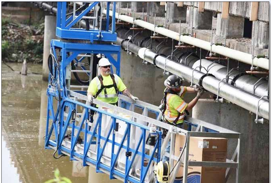
To facilitate the transition of Oak Ridge’s East Tennessee Technology Park from EM to the community, utilities and infrastructure have been upgraded and transferred, including most electrical power, gas, and sanitary sewer systems.

Through EM’s cleanup progress and transfers, ETTP is now a multi-use industrial park home to more than 20 businesses. Those companies will soon be joined by two new developments that will be the biggest at ETTP to date