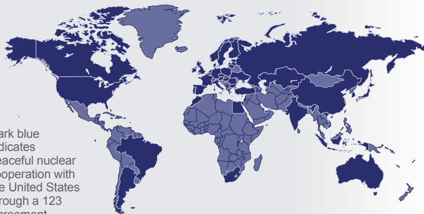
Dark blue indicates peaceful nuclear cooperation with the United States through a 123 Agreement

NNSA strengthens the nonproliferation and arms control regimes by building the capacity of international partners to prevent proliferation, ensure peaceful nuclear uses, and enable verifiable nuclear reductions. This mission includes international nuclear safeguards, export controls, nuclear verification, and nonproliferation policy.