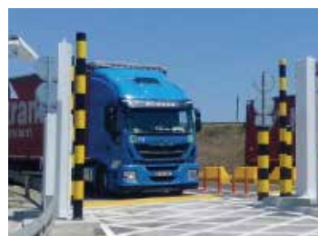
Radiation portal monitors conduct 24-hour screening at points-of-entry

NNSA works with over 100 partners worldwide to secure nuclear and radioactive material and to detect and deter trafficking of this material. This mission includes: international nuclear security; radiological security; and nuclear smuggling, detection, and deterrence.