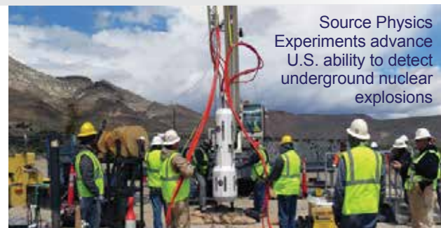
Source Physics Experiments advance U.S. ability to detect underground nuclear explosions

NNSA drives innovative research that develops technologies and expertise to detect foreign nuclear proliferation activities and produces operational proliferation detection capabilities, leveraging technical expertise at the national laboratories, plants, and sites, as well as at universities and within private industry.