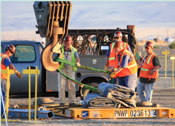
Photo: Crane and rigging crew at the Hanford Site