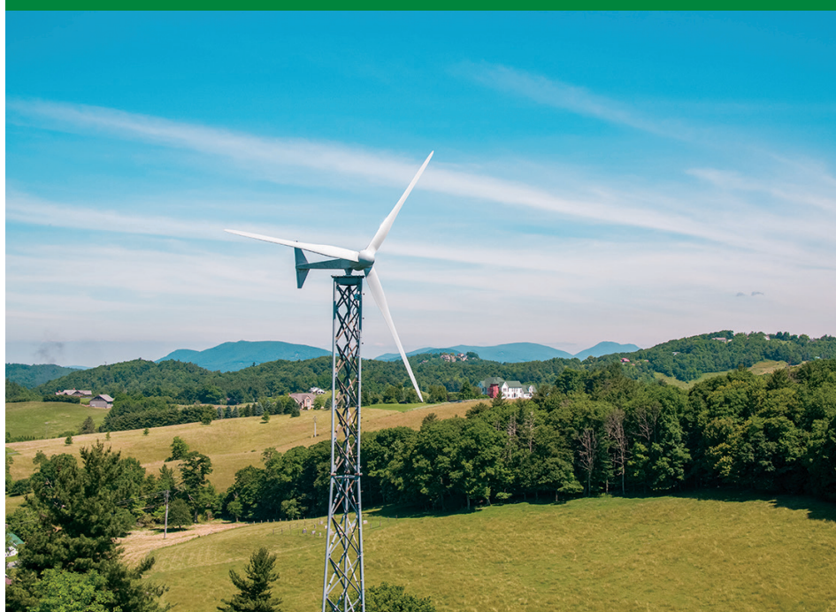
A Bergey Excel 15 wind turbine in Blowing Rock, North Carolina.