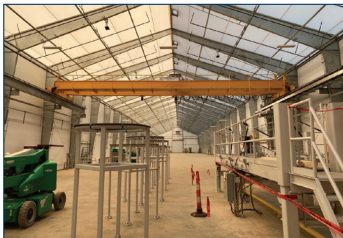
Inside view of the CCO Characterization and Storage pad, which adds the capability to store and characterize CCO drums of diluted plutonium prior to their shipment to WIPP.

excess plutonium for the first time. Work to downblend 6 MT of DOE-EM material has been ongoing.