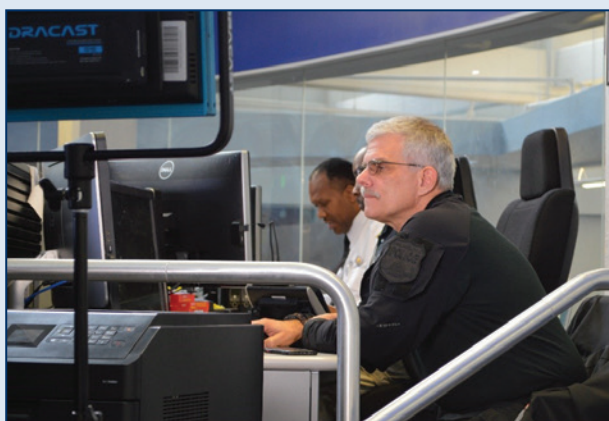
For law enforcement, ORS provided training and strategies to enable safe and effective response to a radiological theft along with centralized monitoring systems that integrated critical alarms and video from local facilities into operations centers.