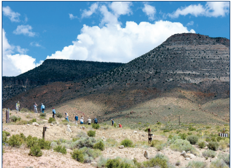
NNSA's Nevada National Security Site, where, among other locations, the TSVT will train.

The TSVT's overarching objectives include verifying a country's nuclear testing history, confirming cessation of nuclear testing activities, and monitoring to ensure no testing takes place in the future. TSVT on-site activities will range from subject matter expert examination of key test site locations to targeted in-field sample and data collection for subsequent analysis. Activities can be as basic as visual observation of test signatures, such as infrastructure or ground disturbances, up to resource-intensive drilling to retrieve nuclear debris after an underground nuclear explosion. Rich Goorevich, Assistant Deputy Administrator for