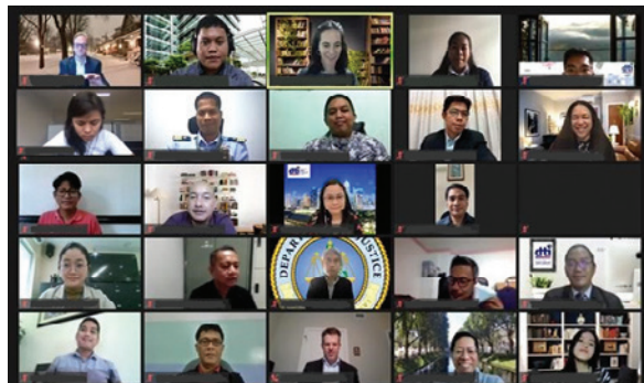
Experts from the United States and the Philippines discuss how to effectively investigate possible violations of export control laws)