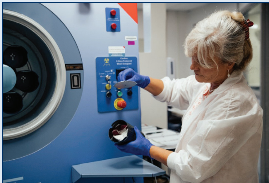
Through the Cesium Irradiator Replacement Project, participating businesses were able to achieve permanent radiological risk reduction.

Cooperating with law enforcement proved effective during a recent incident in Phoenix where enforcement officials were able to successfully respond to the theft of a radiological device. The theft occurred in April 2019 when an employee of a private firm stole three radioactive sources with the intent of constructing a radiological dispersal device (RDD), delivering it to a public location, and ambushing first responders in an active shooter scenario. The individual, who had training in the use of these stolen industrial radiography cameras containing iridium-192 and unfettered access to the devices, posed a serious radiological threat to the community.