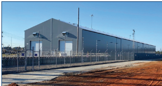
Outside view of the completed CCO Characterization and Storage pad.

Completion of the CCO pad joined the growing list of SPD program accomplishments during the COVID-19 pandemic. In June 2020, updates to the current glovebox used for plutonium downblending were completed and the program increased to two-shift downblending operations. In February 2021, SPD reached a key program milestone by downblending a portion of