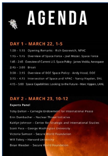
Space Camp agenda

panelists discussed emerging threats and opportunities in space, how the Biden Administration should respond, the future of the Trump Administration’s space policies, the possibility of additional space treaties, and – most importantly – what NPAC can do now to prepare for the future.