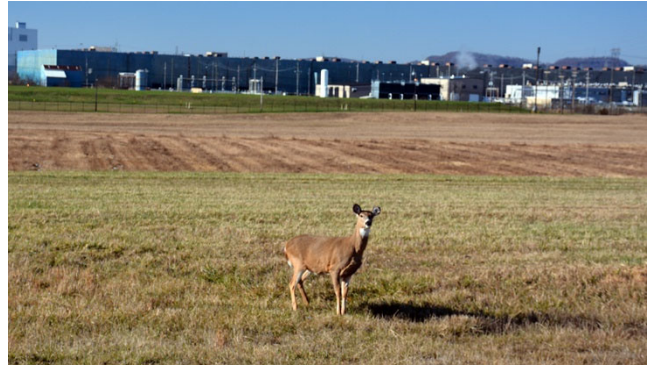
Deer at the Portsmouth Site

Since 1989 DOE's Office of Environmental Management (EM) has been conducting environmental cleanup at PORTS. DOE and its contractors' activities at the site include: