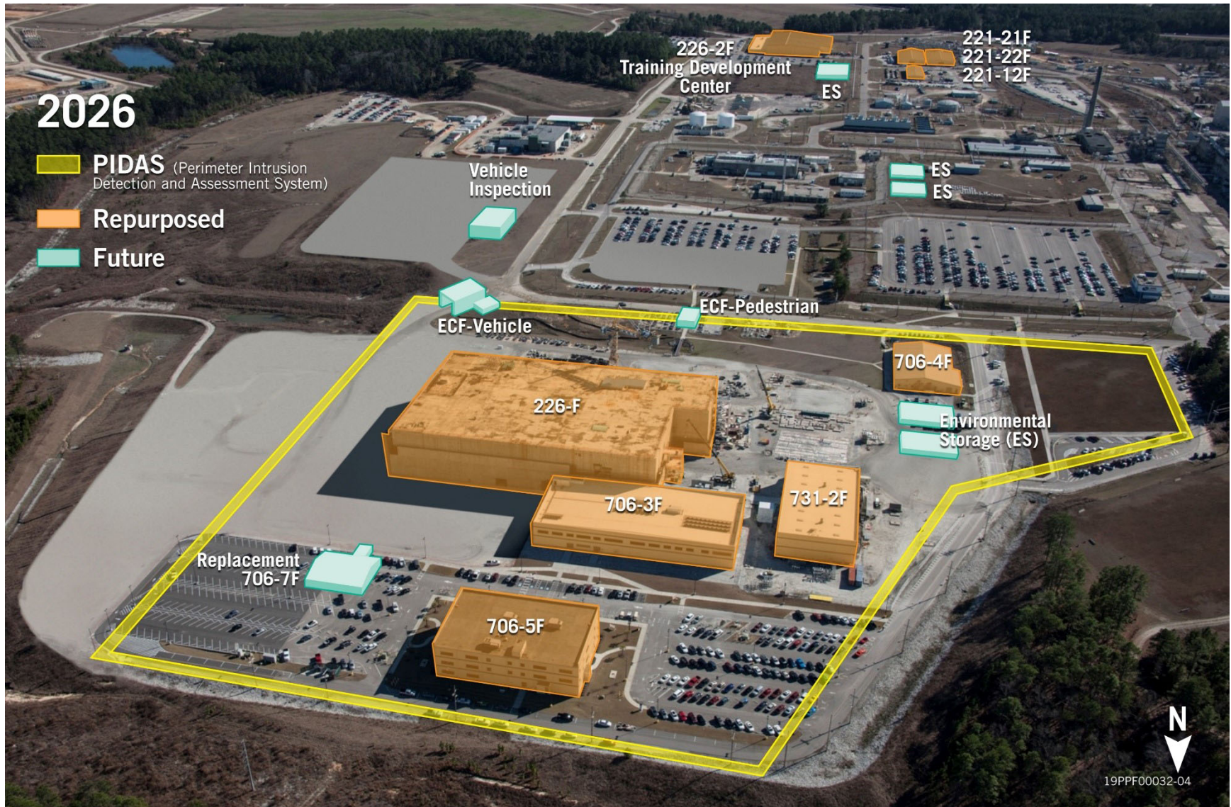
Figure S-4—Notional PIDAS Configuration for Option of Retaining Existing Administration Building