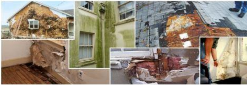
Moisture intrusion problems in the building envelope (Source: DOE Emerging Technologies Roadmap, 2019).