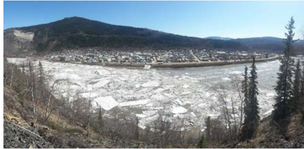
Figure 9.3. Ice breakup on the Yukon River in Alaska.

of the year. Although most river current devices being tested in Alaska are floating devices, bottom-mounted devices are being tested in other locations. A bottom-mounted device in a deep location would be less vulnerable to ice and would be exposed to less floating debris. Little published technical study is available on the formation of frazil ice and ice breakup phenomena (Figure 9.3). So even if a current generator can operate under the ice, there may be additional challenges during the transitions from ice-covered to free of ice in spring and back to ice-covered in the fall.