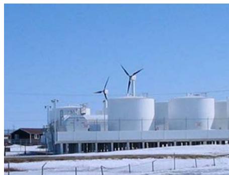
Figure 9.2. Wind generators with oil storage tanks in foreground. Image by Ian Baring-Gould, National Renewable Energy Laboratory 16097

In remote communities, bases, and resorts, electric power is essential for lighting, water pumping, and running services, such as waste water treatment. As show in Figure 9.2, many remote communities are currently powered by diesel generation, some with a wind turbine. Although diesel fuel is power dense and allows for on-demand power, it presents operational and logistical challenges. Inland river, northern, northwestern, and western region communities in Alaska depend on a few bulk deliveries by barge when weather conditions permit. Sometimes fuel must be flown in if supplies run short. Although barge delivery of fuel to remote locations is expensive, air freight is far more expensive (Alaska Energy Authority 2016a). In Bethel, Alaska, the last barge of fall tops off the tanks, leaving the community with almost 13 million gallons of fuel to use over the next 8 months or so (Demer 2016). When stored for long periods of time, diesel grows mold and requires additional treatment before use, which adds to the cost of storage.