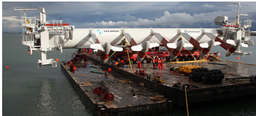
Figure 8.5. Five tidal turbines integrated with the Oosterscheldekering storm surge barrier in the Netherlands.

Power generated from marine energy devices could be used to supplement other energy sources during emergency response and disaster relief activities, offsetting the heavy reliance on diesel generators (Table 8.1). The reliance on diesel requires it to be shipped to areas ravaged by disaster, creating logistical and financial challenges. Further, using diesel generation close to communities creates environmental health and safety issues, as a result of storing and burning diesel in those areas. Medium to large marine energy devices could be used to aid in grid restart, whereas smaller devices could improve the resiliency of isolated grids in response to severe storms or other disrupting events.