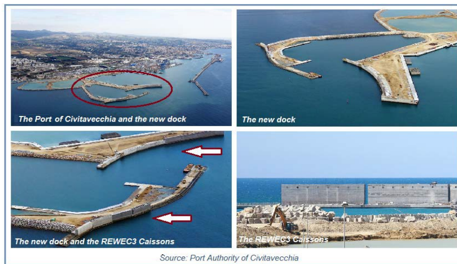
Figure 8.3. The Resonant Wave Energy Converter 3 Device in Civitavecchia Port, Italy.