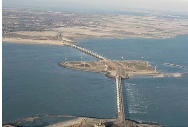
Figure 8.4. Oosterscheldekering storm surge barrier in the Netherlands.