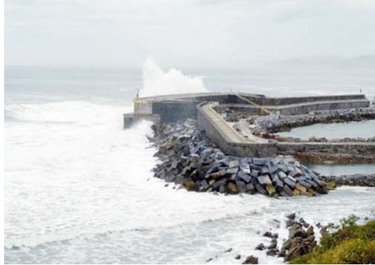
Figure 8.2. Mutriku, Spain, oscillating-water-column-breakwater integration.