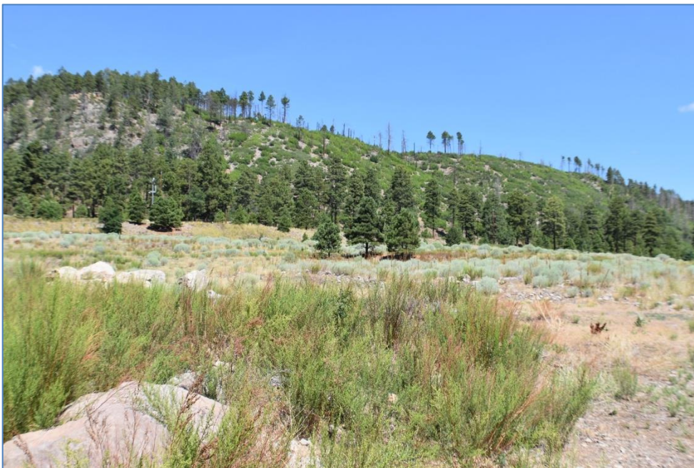
Figure 2-3: PV Array Site Location looking west toward West Jemez Road.