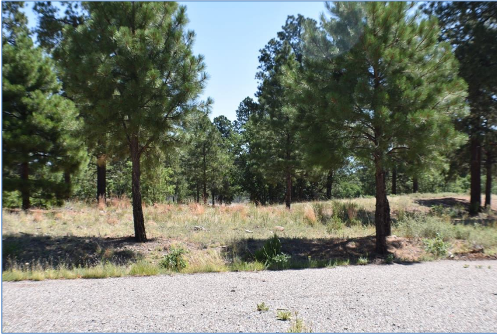
Figure 2-6: Vegetation Characteristic at the Potential 5 Additional Acres Available for the PV Array.