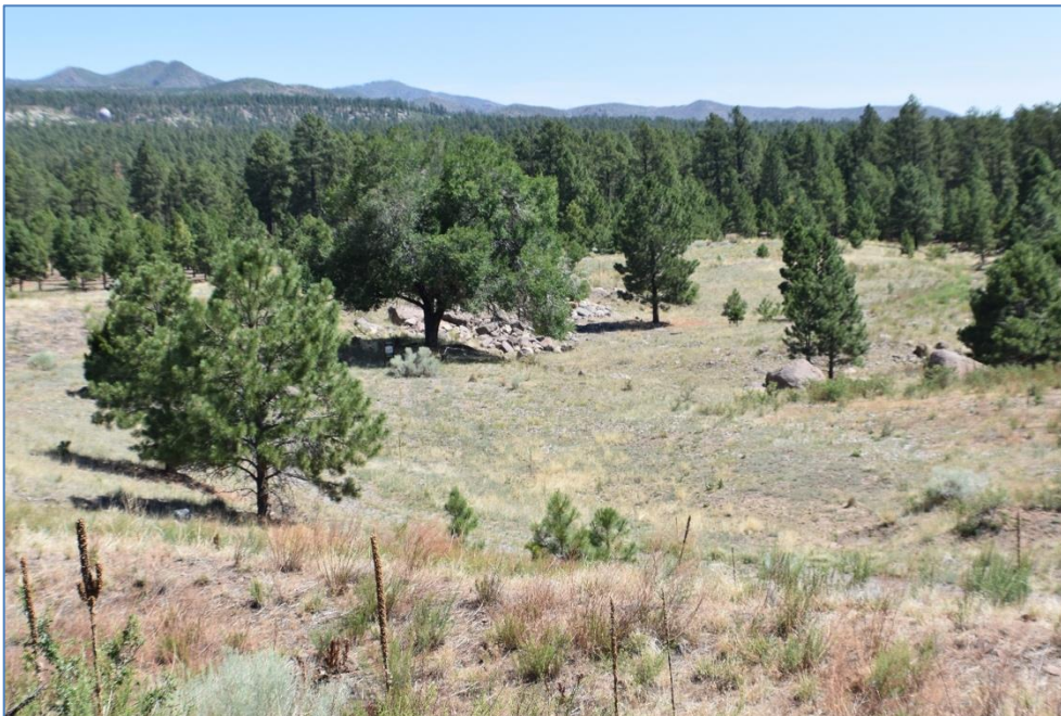
Figure 2-5: PV Array Site North Facing View.