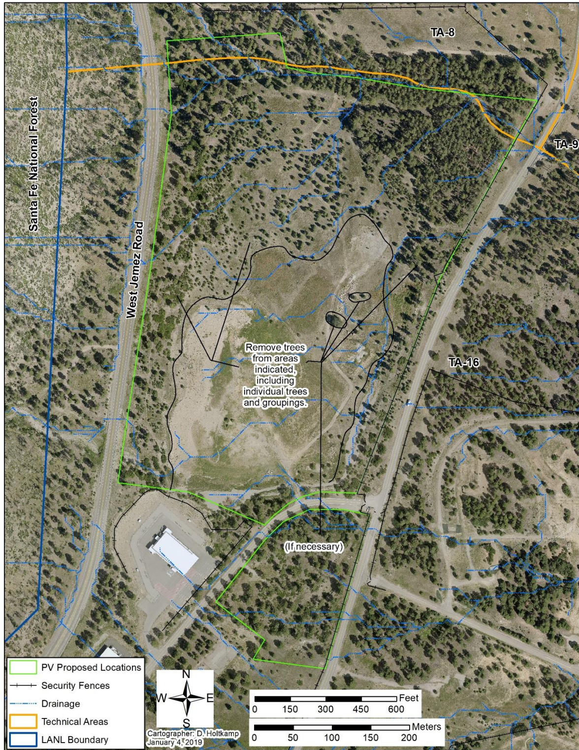
Figure 2-8: PV Array Site Preparation Potential Tree and Shrub Grubbing Areas.