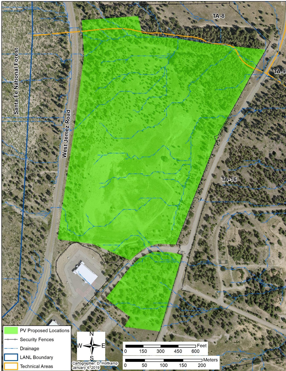
Figure 2-1: Proposed PV System Site Locations.