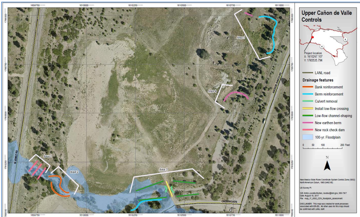
Figure 2-7: Cañon de Valle Watershed Enhancement Project