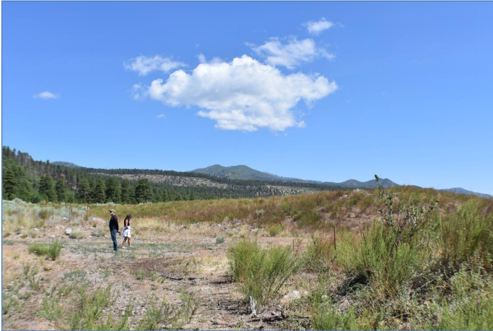
Figure 2-4: PV Array Site View to the Northwest.