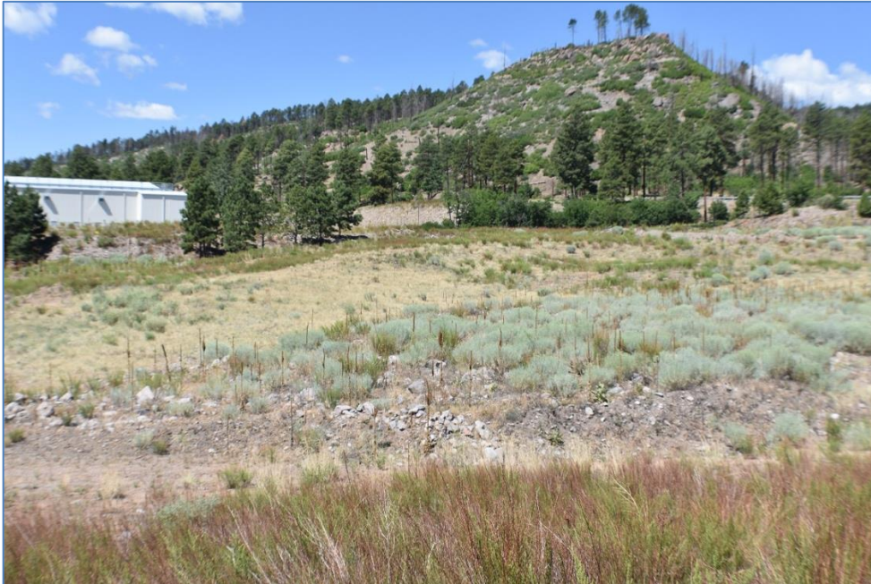
Figure 2-2: PV Array Southern Boundary that Abuts the Cañon de Valle Watershed Enhancement Project Boundary.