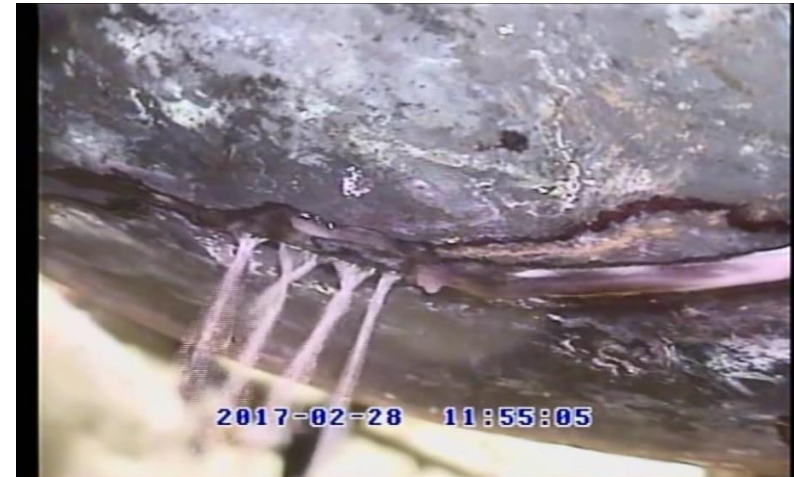
SRS 3H evaporator leak