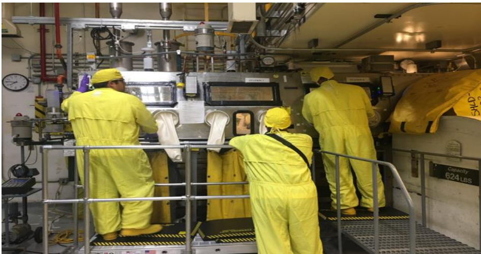
Technicians at the glove box inside WCRRF