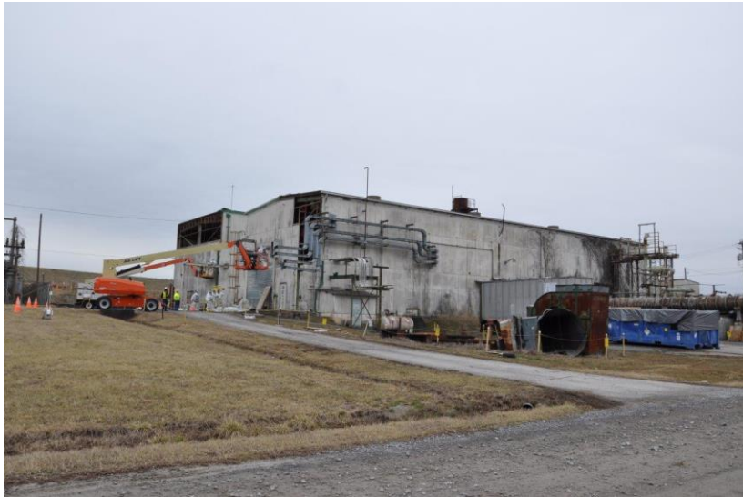
Poplar Creek K-633 (ETTP)