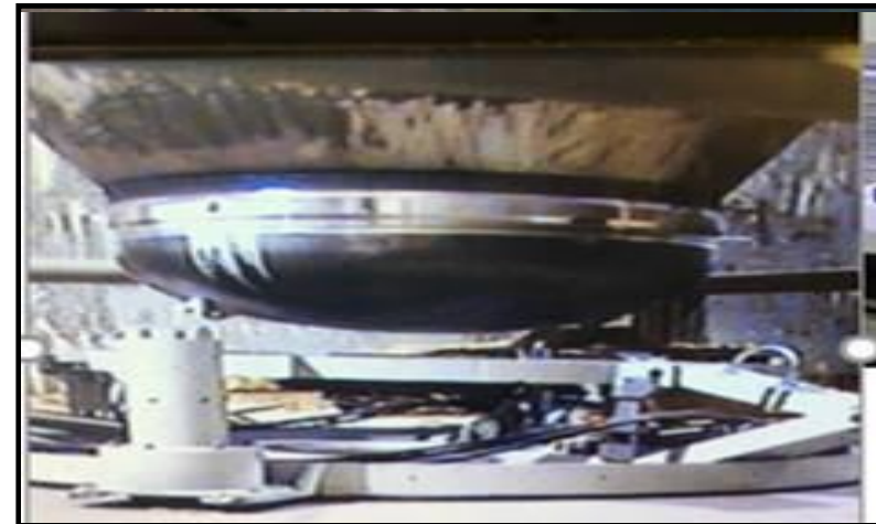
3-H evaporator after repair