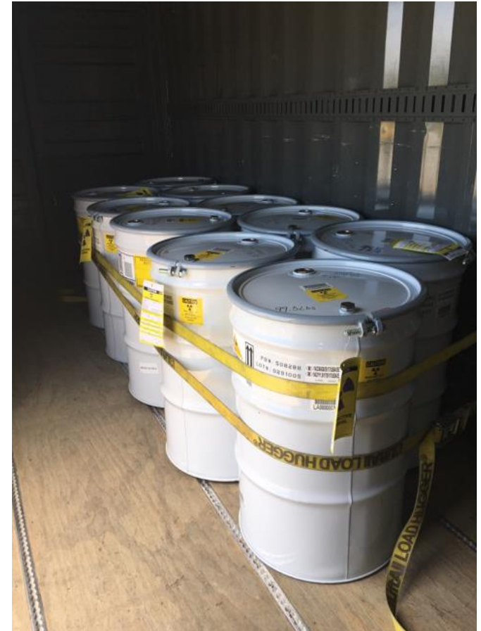
Treated RNS drums being transported to Area G