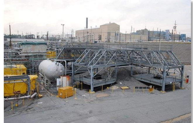
Tank 20 at the Savannah River Site