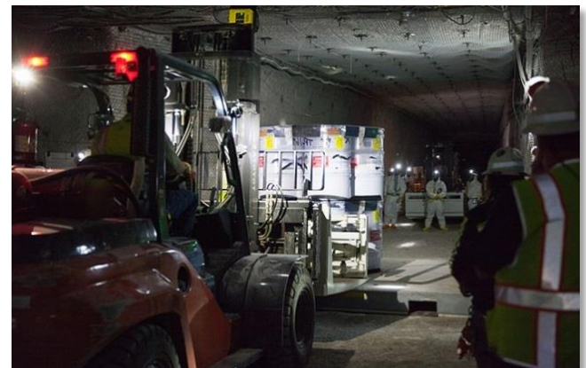
Waste Emplacement at the Waste Isolation Pilot Plant