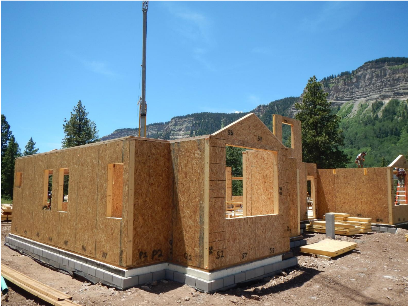
Poly core SIPs