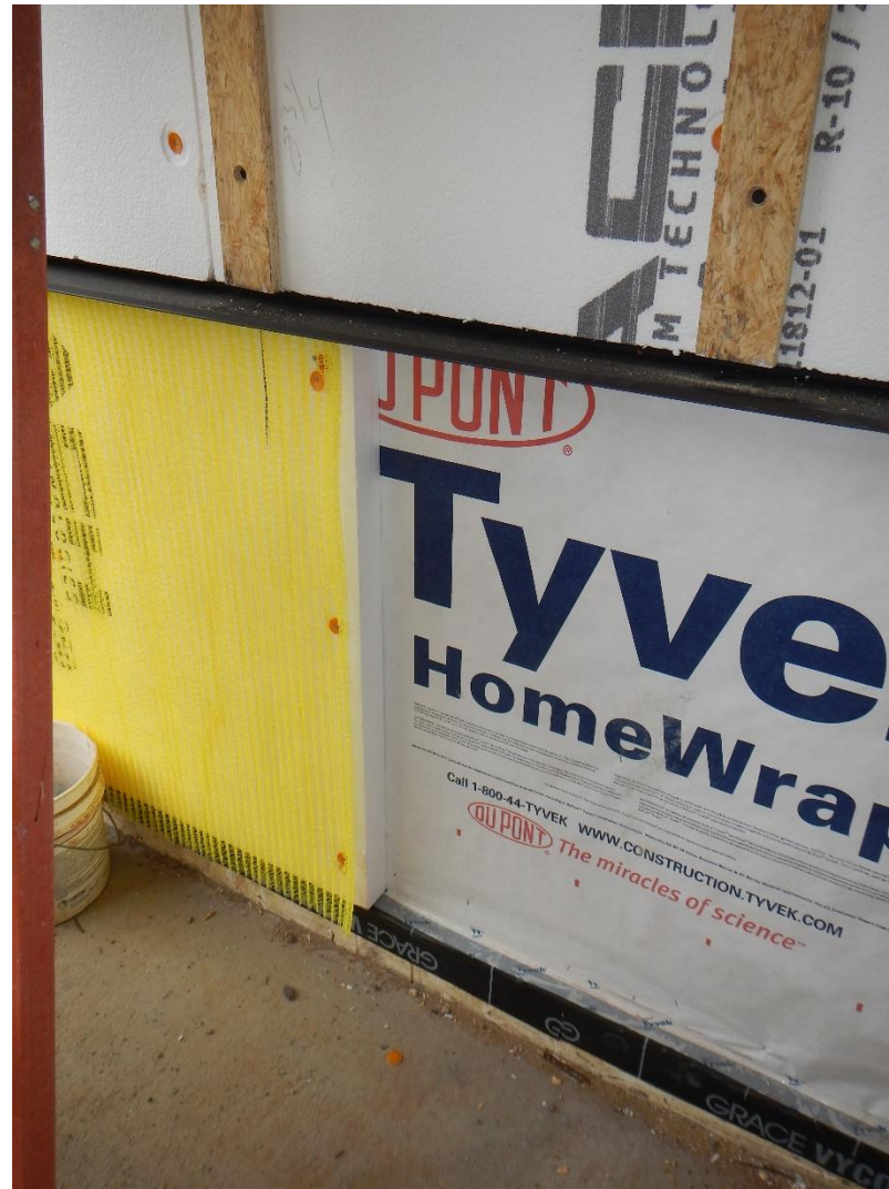
2" Rigid Exterior Foam