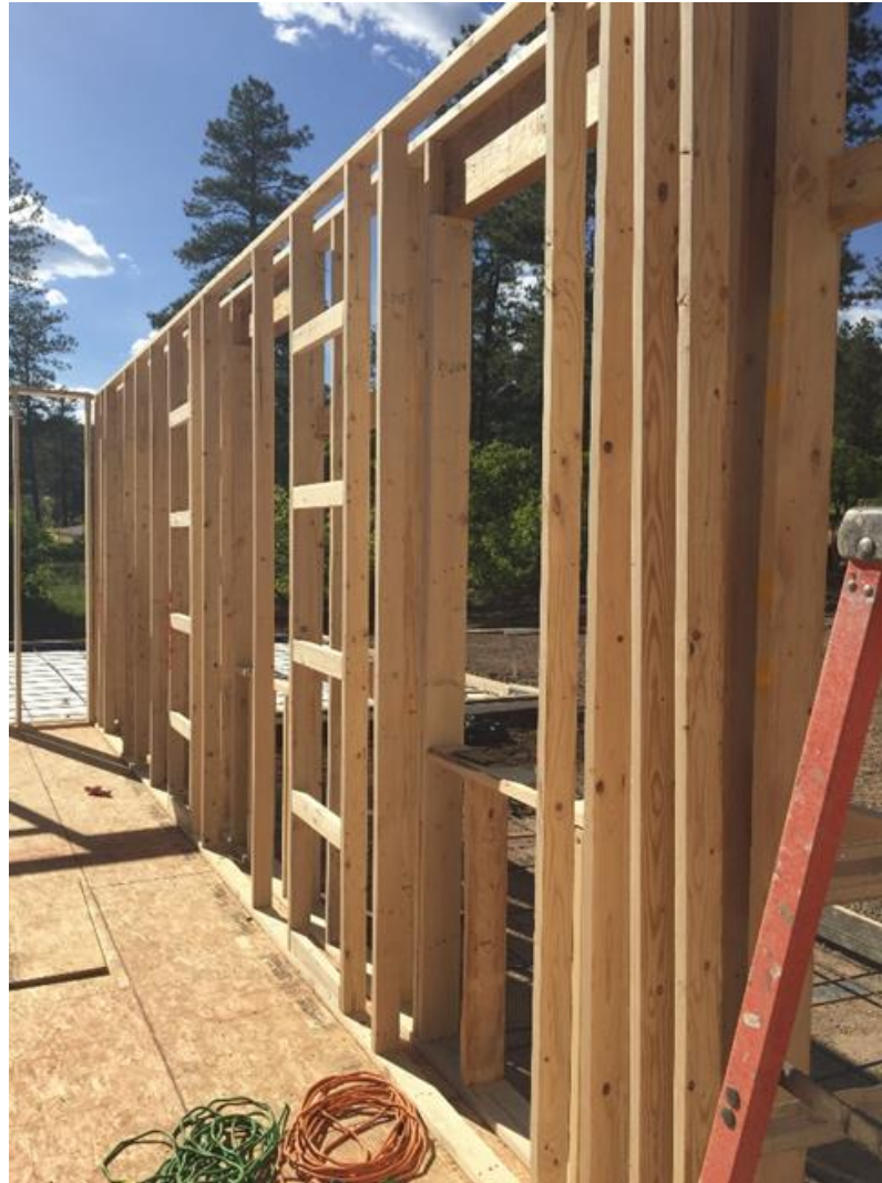
Double Stud Wall