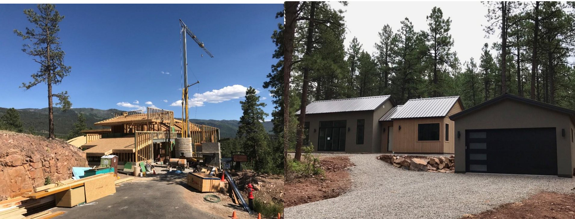
Larger Estate Homes