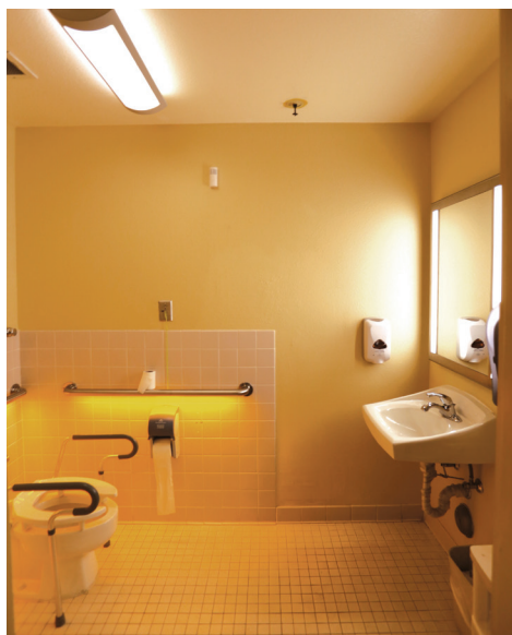
A mirror with integrated LED lighting was installed above the bathroom sink, and a surface-mounted LED luminaire with decorative lens was installed above the toilet area. The amber LED night lighting that was integrated into the railings is also shown.

corridor was estimated to be 68% relative to the incumbent system, considering both the reduced power and the automatic dimming.