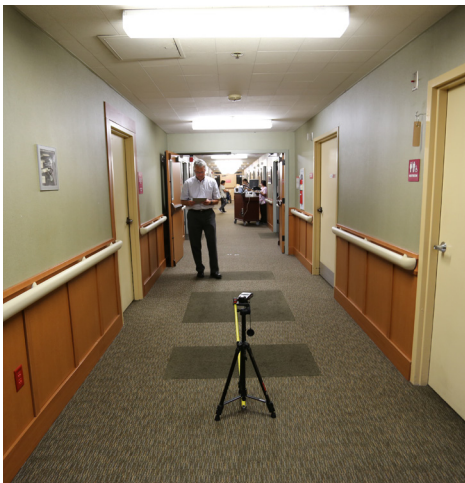
The incumbent fluorescent lighting system in the ACC Care Center corridor.

The Sacramento Municipal Utility District (SMUD) recently conducted a trial installation of tunable-white LED lighting at the ACC Care Center in Sacramento, CA, and invited the U.S. Department of Energy’s (DOE) GATEWAY program to document the performance of the new lighting systems. Among the primary goals identified by SMUD and ACC were to learn more about how tunable-white lighting affects the sleep patterns, nighttime safety, and other behaviors of the residents; and to better equip the staff to provide excellent care by improving the lighting quality (e.g., reduced glare, better controllability) relative to the incumbent system.