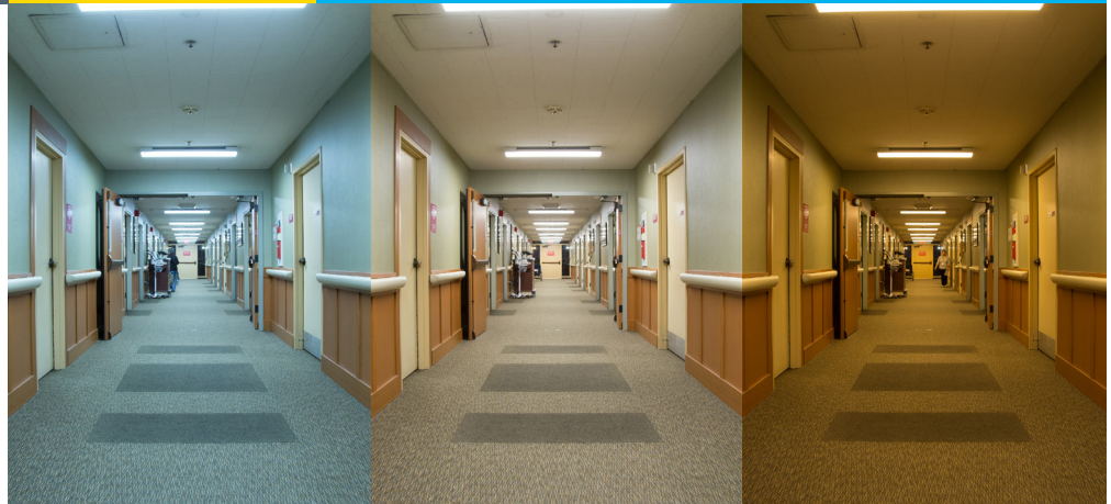
The new tunable LED lighting in the ACC Care Center corridor, shown at the morning setting (specified as 6500K at 66% output, left), the afternoon setting (specified as 4000K at 66% output, center), and the nighttime setting (specified as 2700K at 20% output, right).