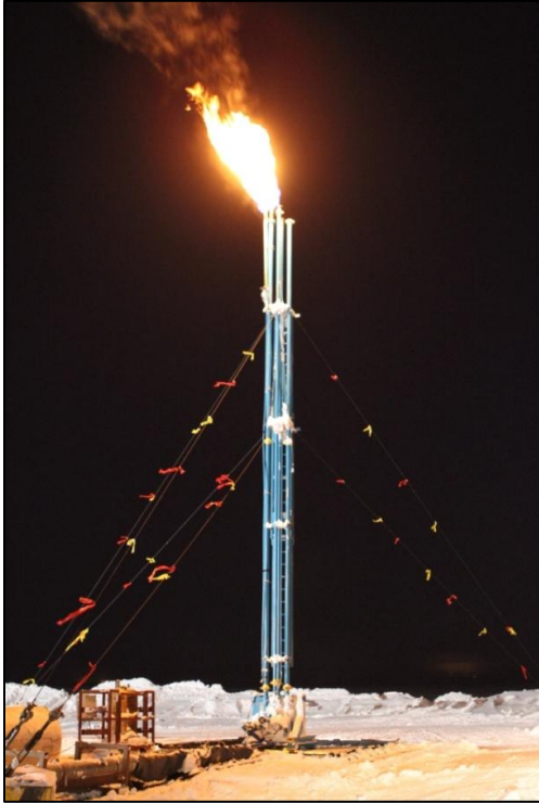
Figure 2-Flared methane gas during the production phase of the 2012 DOE-ConocoPhillips-JOGMEC gas hydrate production trial (courtesy ConocoPhillips).

lowered and a 30-ft interval of casing was perforated with no damage to the downhole pressure-temperature gauges or the fibre-optic cables. A sand screen designed to control sand production was then set across the perforated interval.