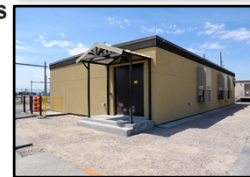
2012 MFC Dial Room