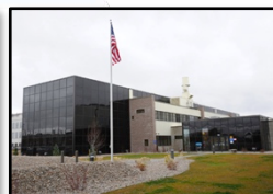
2012 - Energy Systems Laboratory