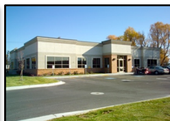
2008 - Supply Chain Management Offices