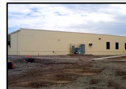
2011 Modular Office Building