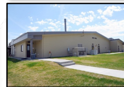
2009 Radiochemistry Laboratory