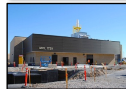
2012 Irradiated Materials Characterization Laboratory