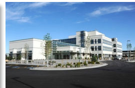
2013 - Energy Innovation Laboratory