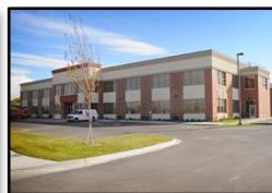
2008 - National & Homeland Security Laboratory