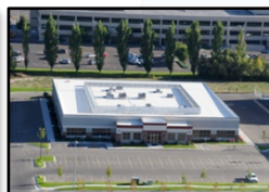
2010 - National & Homeland Security Laboratory