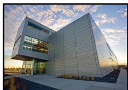
2008 - Center for Advanced Energy Studies