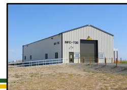
2009 Vehicle Test Station