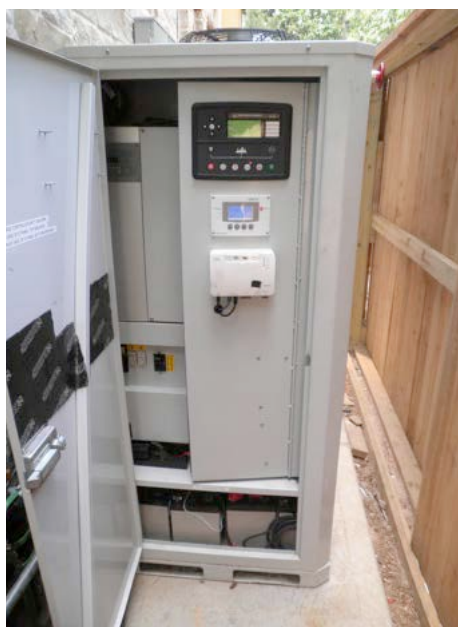
The home has the world's first tri-generation micro-generator to provide electricity, heating, and cooling in one.

High-performance dual-pane, low-emissivity, vinyl-framed windows were installed with proper sealing and flashing techniques to keep out rain and moisture. The kitchen, bathrooms, and laundry room all have exhaust fans that vent to the outside. The HVAC system has a metered and timed fresh air ventilation system that operates in the metered open position utilizing the fan mode when the system is running, and on a timer when there is a sustained period with no call for conditioned air. In addition, the supplemental desiccant wheel dehumidification system described above maintains an indoor relative humidity of 50% even when the air conditioner is not operating and substantially reduces the latent load on the HVAC system.