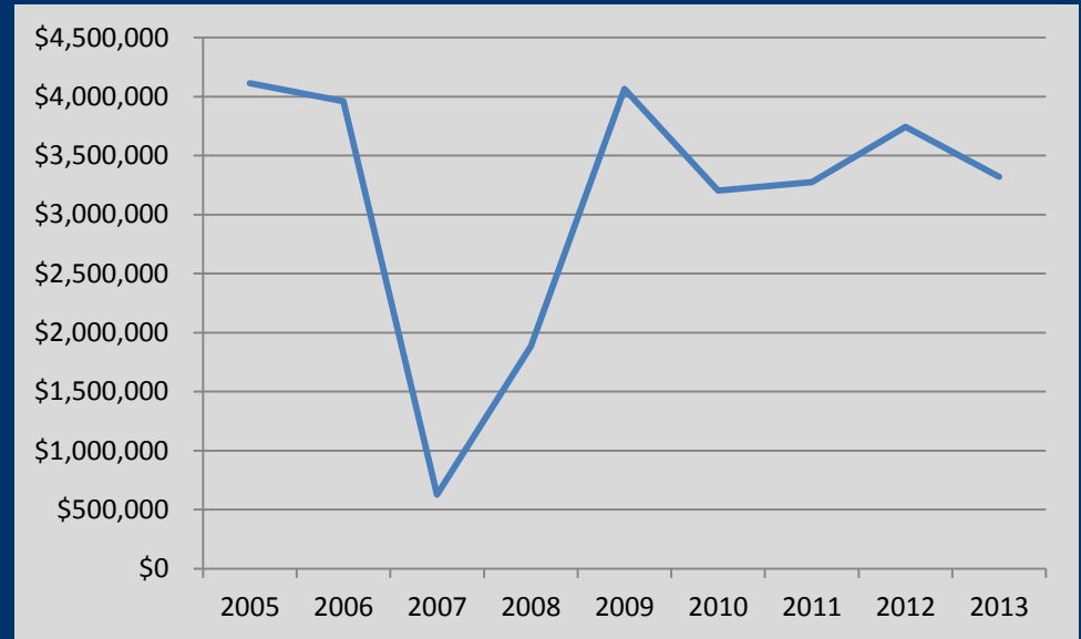
Imminent Threat Grants, FY05-FY13