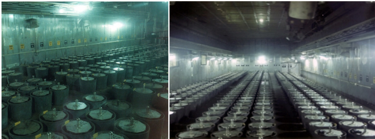
The Former Plutonium Storage Vault at Rocky Flats where Plutonium slated for weapons production was left in place upon permanent shutdown and became a responsibility of EM. The vault was eventually de-inventoried and demolished.