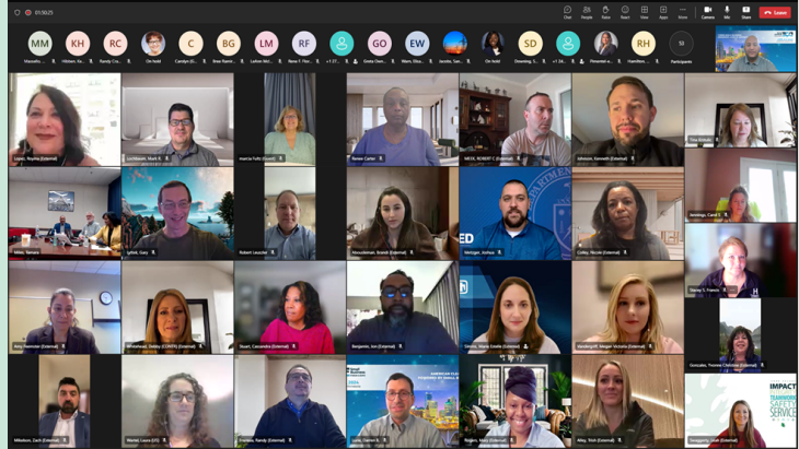
Various SBPMs, the OSDBU, and other members of the DOE Acquisition Community on Day 2 of the SBPM Summit hosted virtually.

Day 2 of the summit featured a presentation from the SBA on legislative and regulatory updates for small business government contracting programs and various interactive best practice sessions on DOE small business topics, including the DOE Mentor-Protégé Program and small business outreach. More than 80 SBPMs representing program offices, national laboratories, and sites attended the summit in person and virtually. Thanks to SBPMs for making the summit a great success!