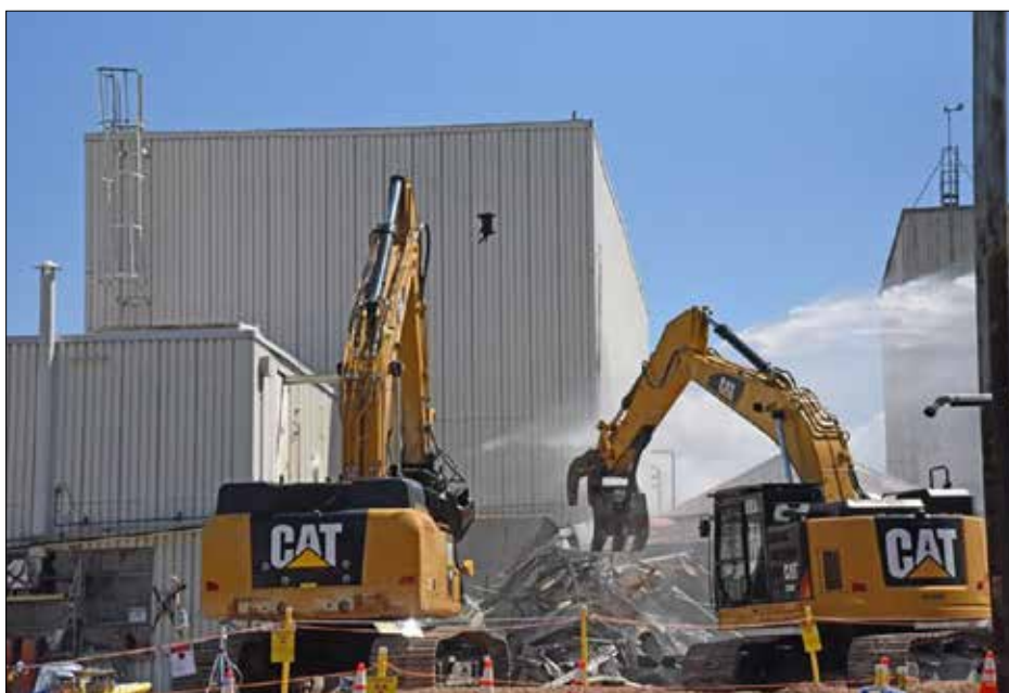
Demolition began in September on the Bulk Shielding Reactor at the Oak Ridge National Laboratory. It marks the first teardown of a former reactor at the site. The project is slated for completion this year.

Crews will complete demolition on the facility this year before transitioning to the teardown of the nearby Low Intensity Test Reactor, known as Building 3005.