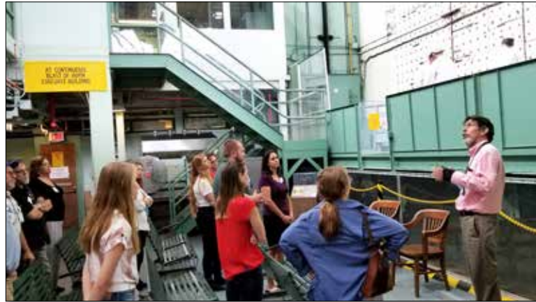
Board members tour the Graphite Reactor at Oak Ridge National Laboratory as part of their orientation training each summer.

Board membership will take some time — two or three hours in months the board meets, and there are