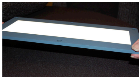
An OLED lighting prototype developed (with support from DOE funding) by UDC and IDD Aerospace for use in aircraft cabin interiors.

and reduce some of the risk of pursuing new technical approaches. DOE support has also allowed the company to devote more of its resources to energy-saving lighting, in addition to the more immediate display market. In today's display market, about 10% of consumer electronics use OLEDs. Virtually all of those OLED products—which include smartphones, tablets, TVs, and smart watches—contain UDC technology. In 2015, 250 million smartphones using UDC technology were sold—to say nothing of other consumer electronics products. Demand for UDC technology comes from both domestic and foreign markets, with UDC customers including U.S. OLED panel manufacturer OLED-Works as well as Asia-based electronic-industry giants LG Display, Samsung, and Konica Minolta.