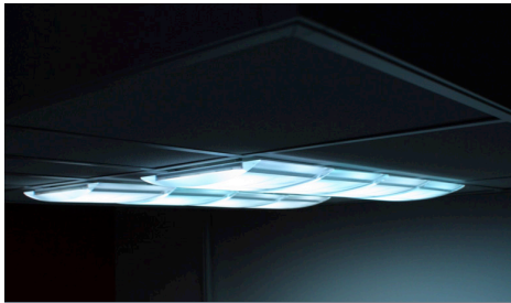
An OLED lighting prototype developed by UDC with support from DOE funding and incorporated into Armstrong Industries' advanced TechZone™ ceiling system.

A number of UDC's DOE-funded projects have been aimed at accelerating the adoption of OLED lighting through the development and demonstration of new OLED lighting prototypes. For example, in 2010 the company completed a project with Armstrong Industries to integrate an OLED luminaire into Armstrong's advanced TechZone™ ceiling system and, the following year, demonstrated undercabinet OLED lighting. In 2012, UDC successfully exhibited a color-tunable OLED luminaire in partnership with Acuity Brands Lighting, and in 2014 UDC developed, together with IDD Aerospace, an energy-saving OLED lamp for use in aircraft cabin interiors.