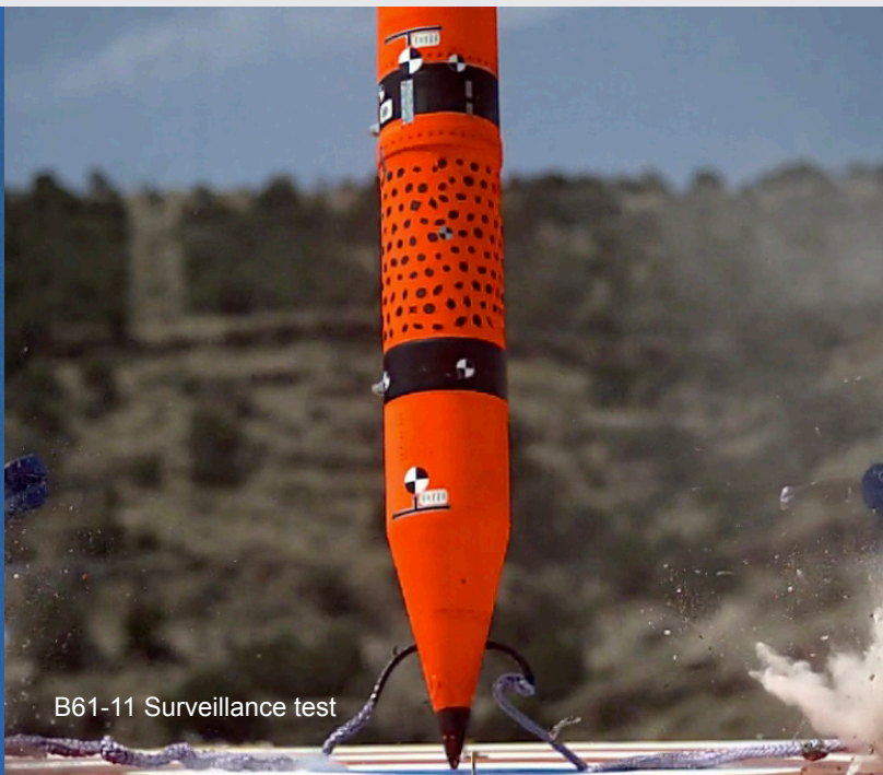
B61-11 Surveillance test