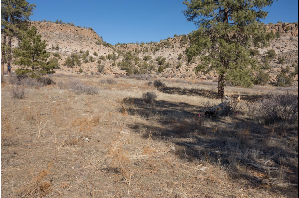
Photograph 1. Existing vegetation cover in the proposed firebreak within the floodplain