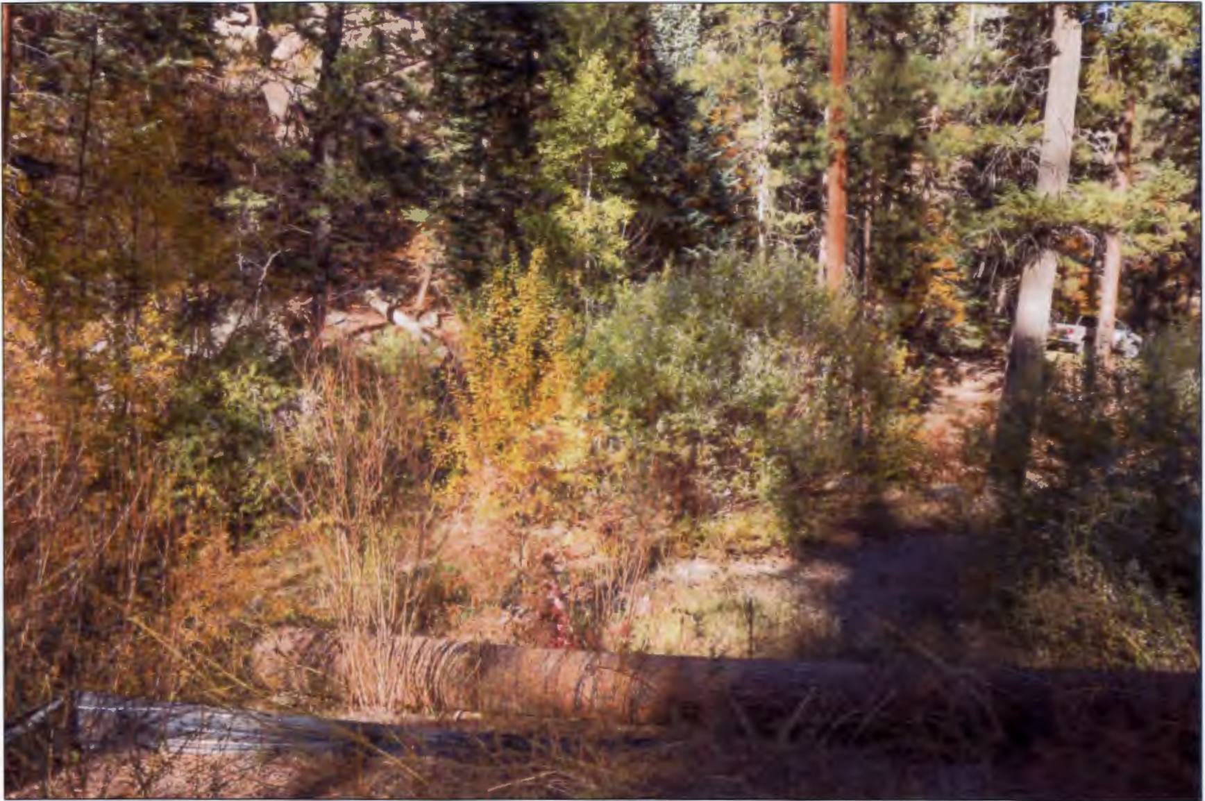
Photo 2. Facing north-northeast showing the stream channel where the water line will pass through