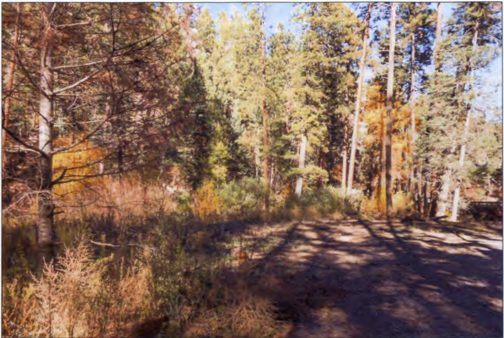
Photo 1. Facing north-northeast from the roadway in the general direction that the water line will exit the roadway