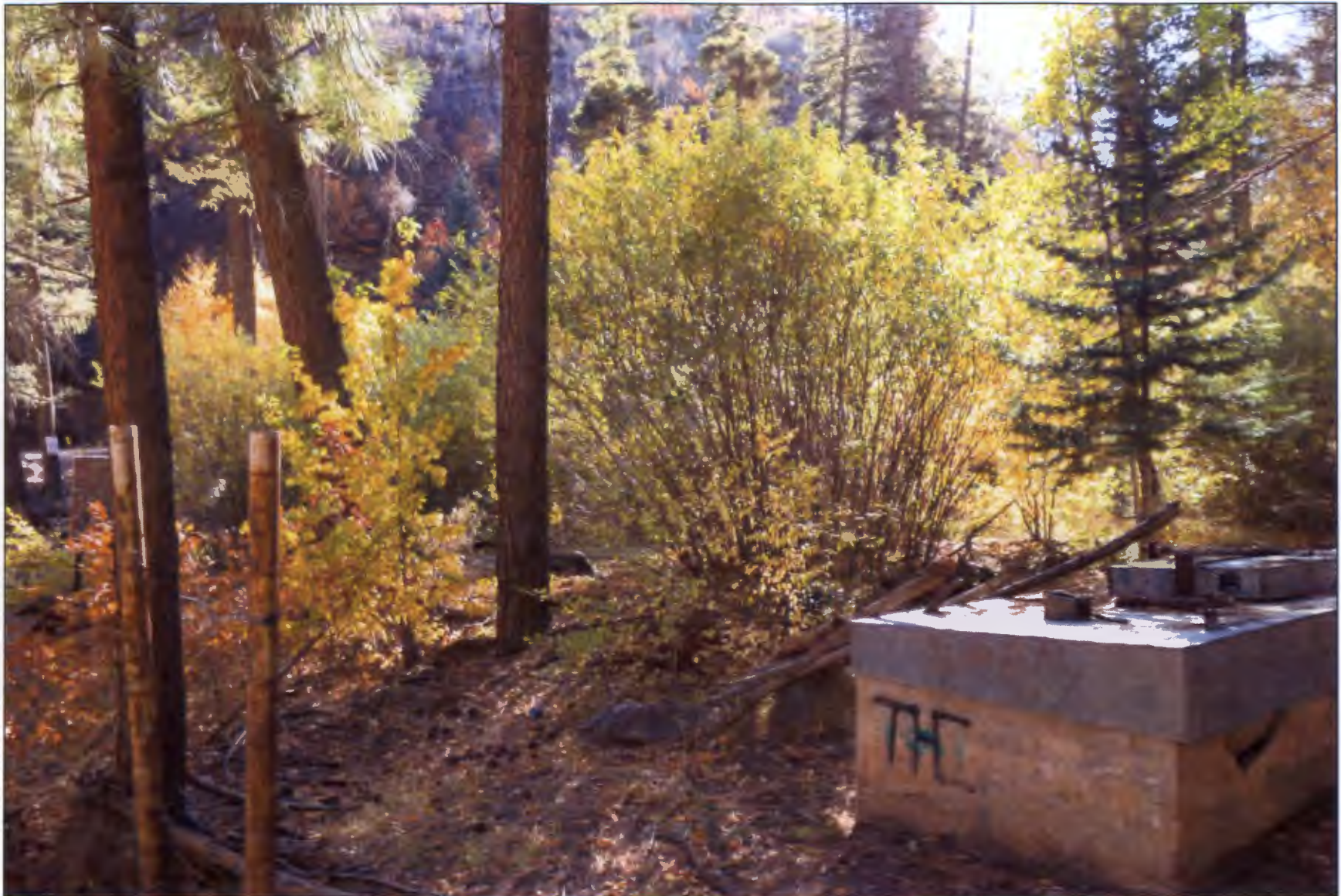
Photo 3. Facing south-southwest showing the infrastructure where the water line will terminate