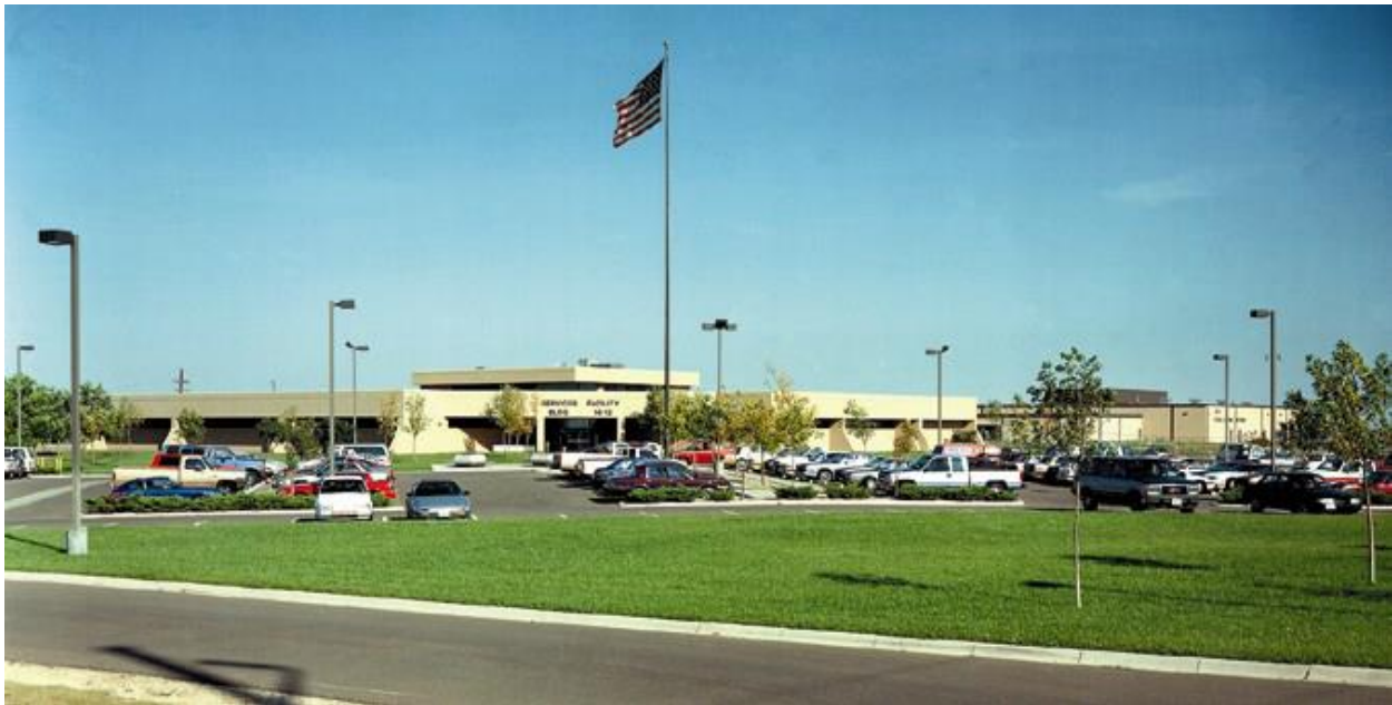
PANTEX PLANT * AMARILLO, TEXAS * 2015