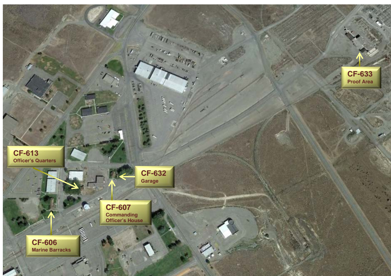
Figure 2. Location of the Signature Properties within the CFA

Past surveys for bats have documented western small-footed myotis and big brown bats roosting in five buildings at CFA during summer. Additionally, recent acoustical monitoring of bats at waste-water ponds near CFA indicates that big brown bats, western small-footed myotis, silver-haired bats, western long-eared myotis ( M. evotis ), Townsend's big-eared bat, hoary bat, and little brown myotis use the waste-water ponds and the surrounding habitat from February to August, with peak use occurring from April through June (Hafla, et al. 2014).