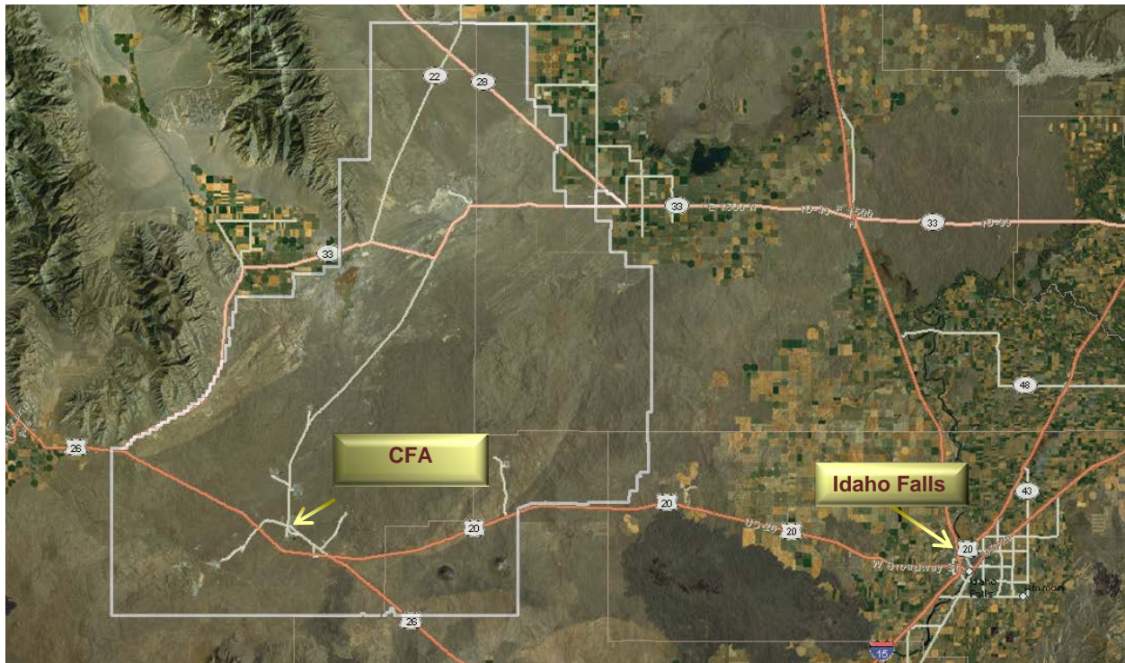
Figure 1. Location of CFA on the INL Site and the city of Idaho Falls