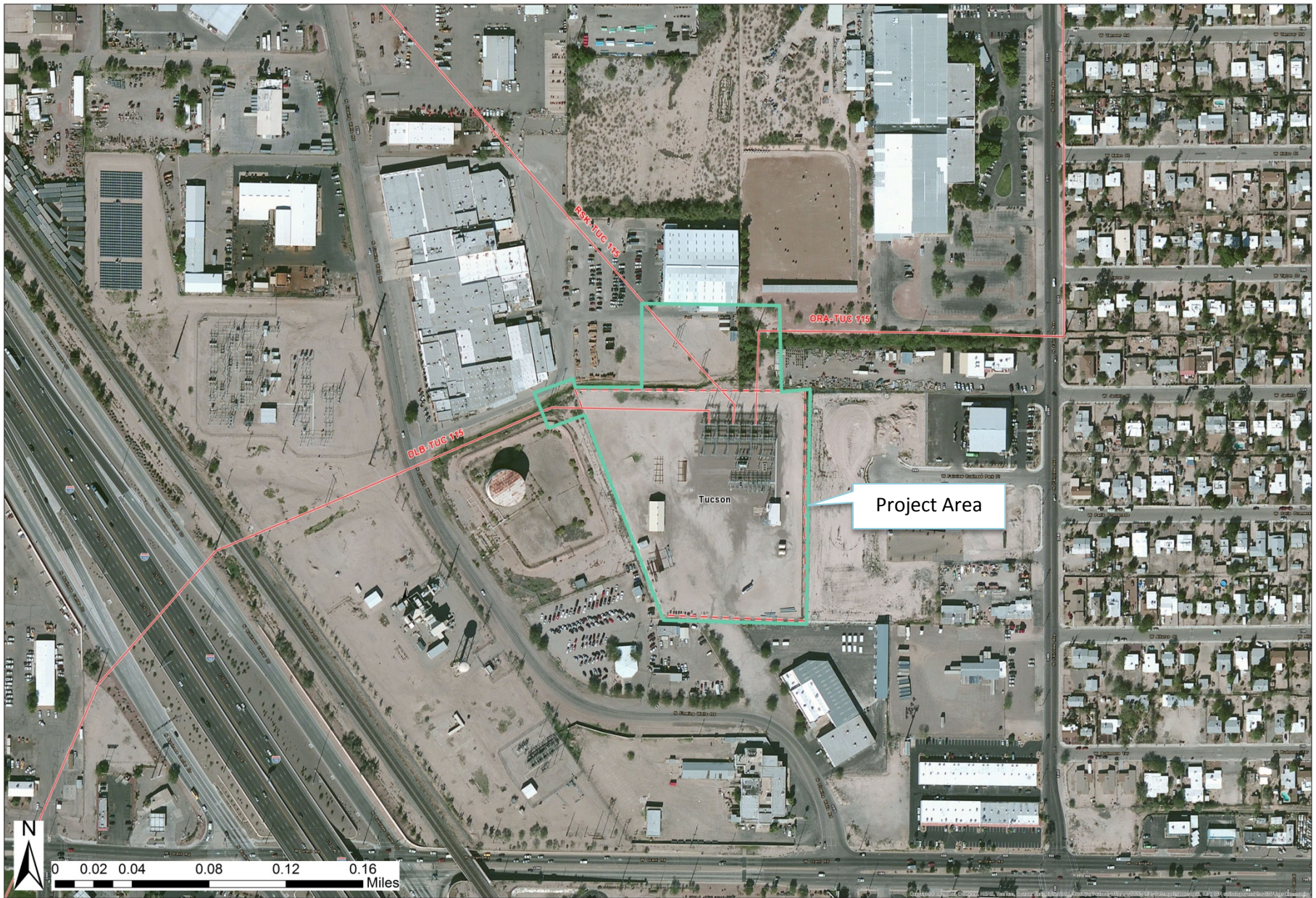
Figure 2. Project Area