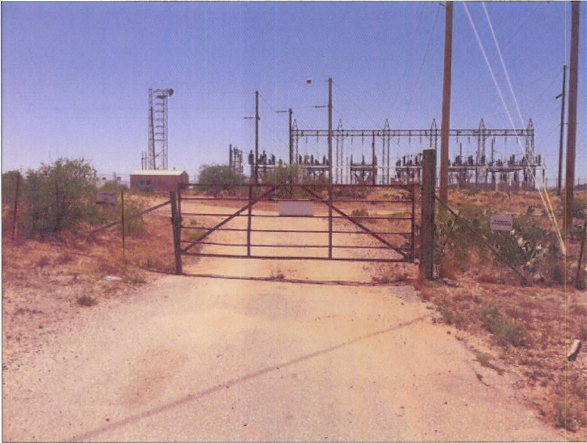
View of the existing gate accessing Oracle substation, looking west from the SR 79 ROW. (30 April 2013)