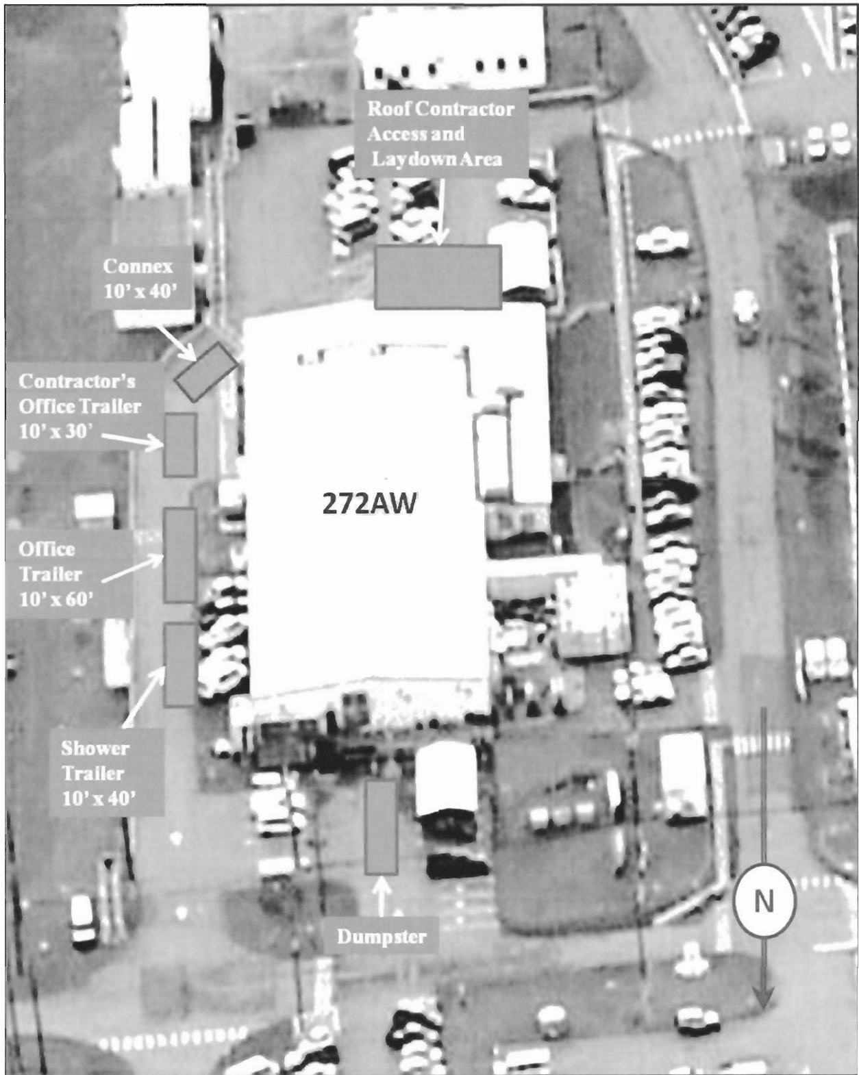
Figure 1. Aerial photograph showing an example of the relative locations of the temporary connex box, the three associated trailers, the dumpster, and the roofing contractor's laydown/staging area in relation to 272-AW.